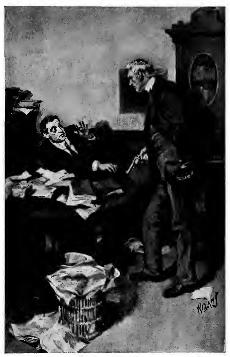
"I HAVE RESIGNED MY CHURCH-TO KILL YOU."