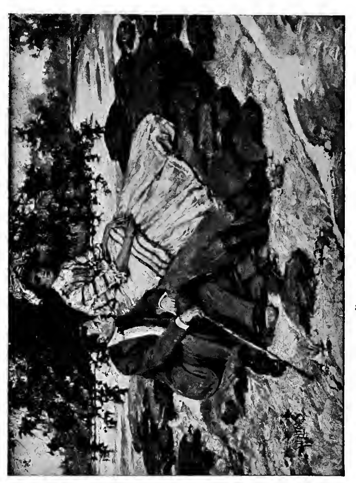
"THIS IS MY THRONE."