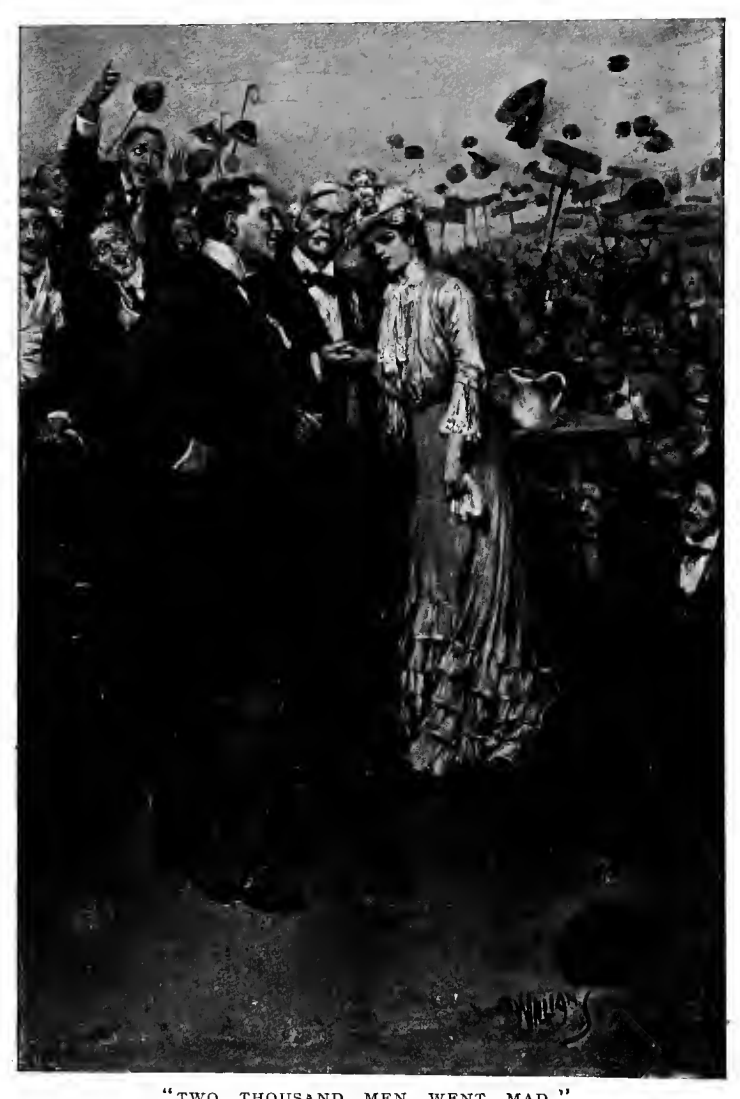
"TWO THOUSAND MEN WENT MAD."