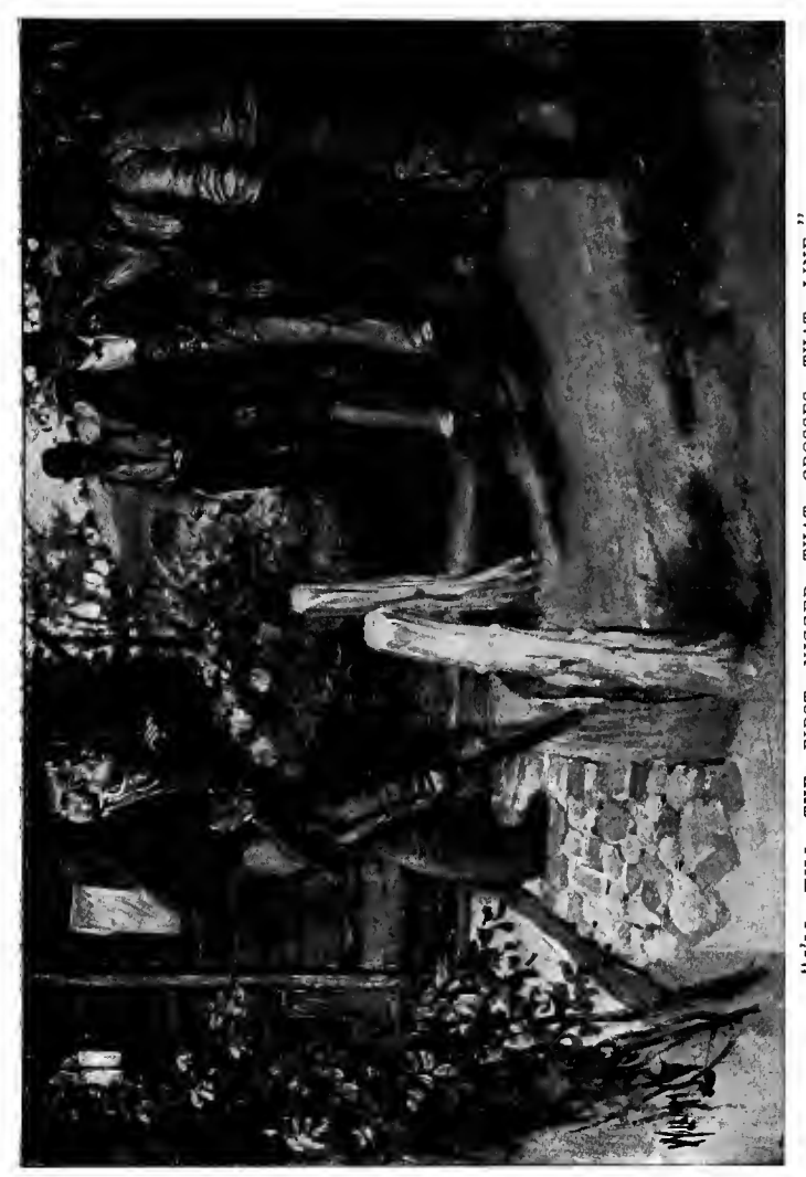
"I'LL KILL THE FIRST NIGGER THAT CROSSES THAT LINE,"