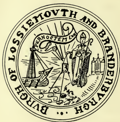
Lossiemouth and Branderburgh.