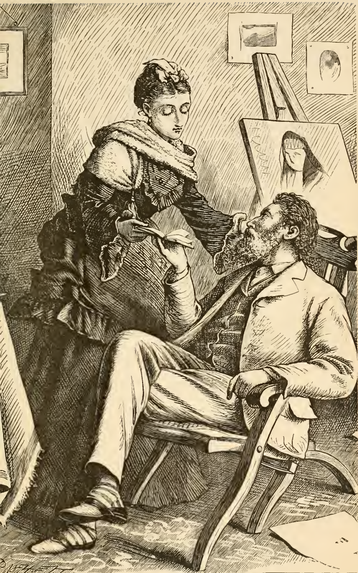
“During this period of recovery, I often came upon him reading his Greek New Testament.”