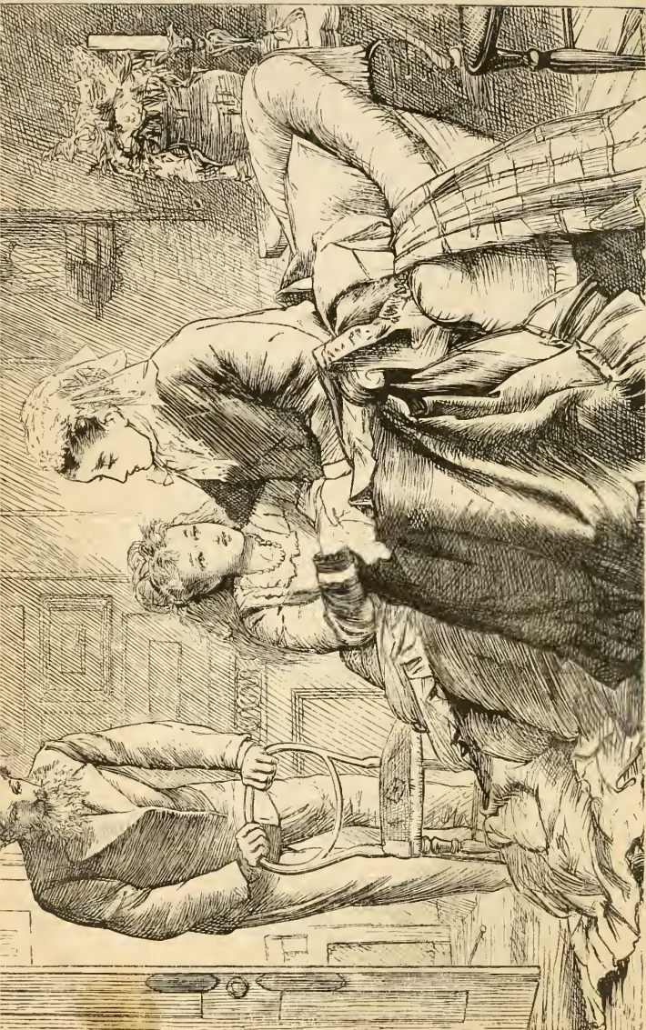
I knelt down, put my arms round her, and looked up in her face.