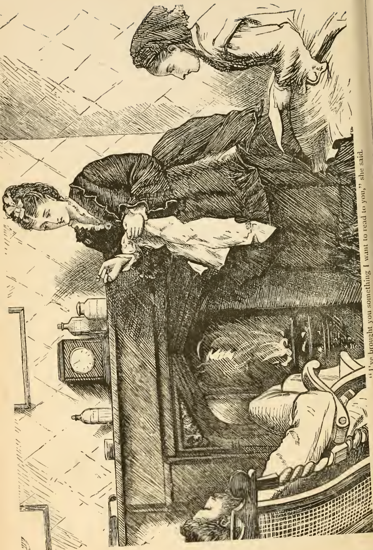
"I've brought you something I want to read to you," she said.