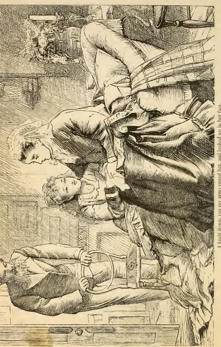
I knelt down, put my arms round her, and looked up in her face.