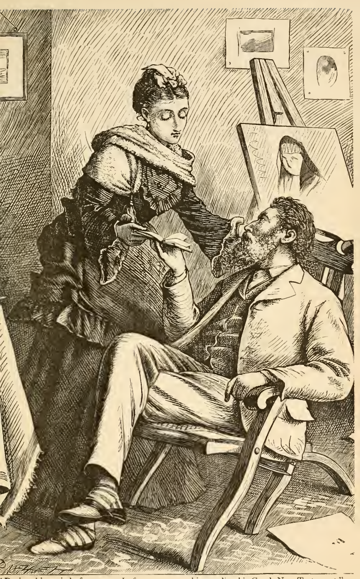
During this period of recovery, I often came upon him reading his Greek New Testament."