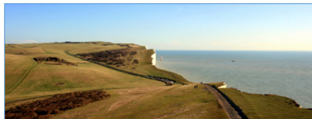
View east from the tower towards the new lighthouse at the base of Beachy Head