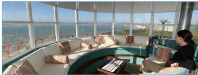
The lantern room at Belle Tout with its 360 degree views of the channel and the downs

"A truly amazing experience, we didn't want to leave."