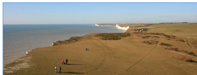
View west from the tower towards The Seven Sisters and Seaford Head in the distance

An ideal present for friends and family. Any denomination and gift card included. Call now to order yours.