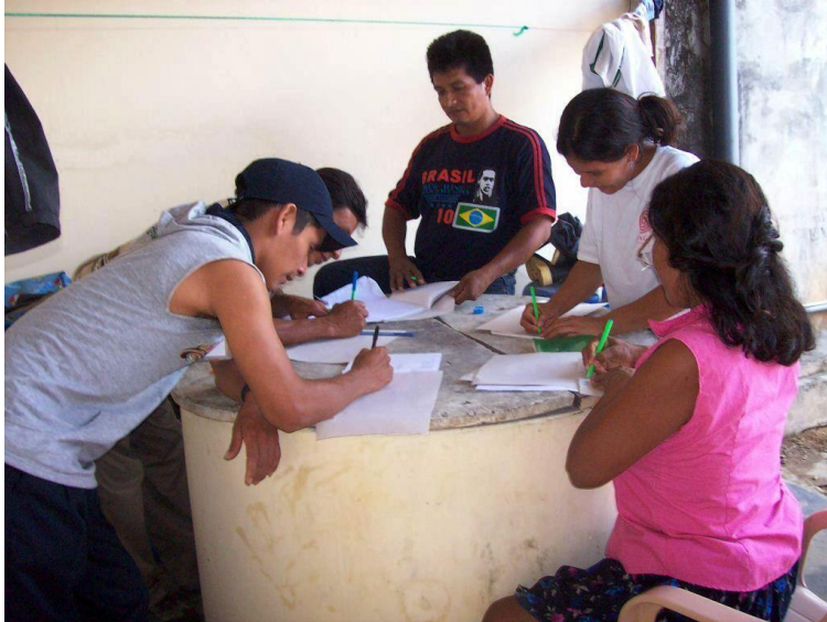
Radio correspondents undergoing training in writing letters to the radio program

These ground-based, year-round educational efforts in rural schools were complemented with Minga's popular on-air, intercultural radio educative program, Bienvenida Salud . Further, along with their teachers and Minga's cadre of community-based promotoras several students in each participating school were trained as radio correspondents, in-charge of encouraging youth in their respective communities to listen to Bienvenida Salud and then provide feedback, including proposing new subjects for inclusion and treatment on the radio program. Presentations were also made to parents of students on domestic violence, HIV/AIDS, and community health issues in several participating schools. Through combined efforts, the programmatic intervention reached an estimated 3,600 families in the Peruvian Amazon.