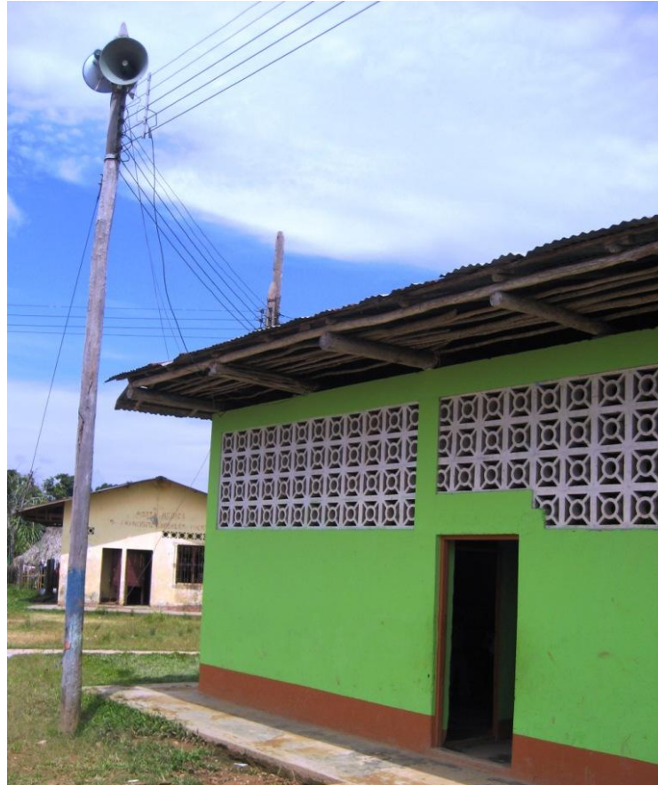
The community loudspeaker in San Francisco to amplify radio broadcasts and more

In the past few years, nearly ten riverine communities in the Peruvian Amazon, spurred by their own initiative and with help from Minga Perú, a non-governmental organization, have established loudspeakers to amplify their favorite radio broadcasts. ii In April, 2008, when we alighted from the speedboat to enter one of these communities, called San Francisco, we could hear announcements on the loudspeaker echoing all the way to the Marañon River iii .