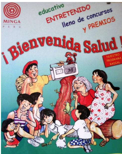
A poster promoting Bienvenida Salud!

Bienvenida Salud is a half-hour radio program broadcast three times a week (Monday, Wednesday and Friday) at 5:30 a.m. – the time when people are waking up in the Amazonas, and then repeated the same days in the evening. Bienvenida Salud is purposely designed to both entertain and educate to increase audience members' knowledge about reproductive health, sexual rights, and gender equality, creating favorable attitudes, shifting social norms, and changing overt behavior. x By mid-2008, Minga Perú had broadcast over 1,100 episodes of Bienvenida Salud , earning audience ratings of about 40 to between 45 to 50 percent among radio-owning households in the rural area of the Loreto Region. Each show is taped and sent to local stations for rebroadcast. Tapes are also given to local school teachers as well as Minga Perú's community promotoras to play on audio-cassettes.