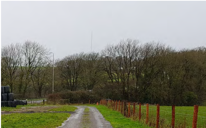
1. The view of the A48 from the site

Despite being adjacent to the A48, off-site visibility would be minimal due to the high hedgerows and mature trees coupled with the topography.