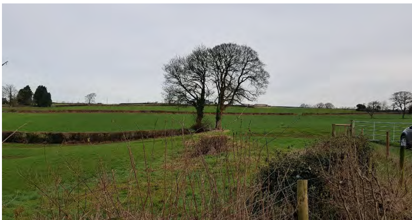
2. The view to the North

The site is well-contained and will be well-screened behind large numbers of roadside trees and mature hedgerows. Furthermore, topography of the site assists in screening the site from external views.