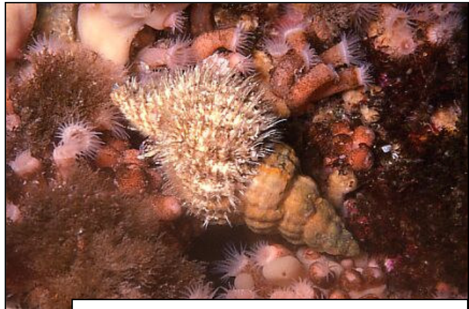
An Oregon triton amongst zoanths and bryozoans.

Gastropod mollusks were relatively diverse and abundant. The largest and most conspicuous gastropod was the Oregon triton Fusitriton oregonensis . Several smaller species of snails were observed in large numbers, including Amphissa sp. Six species of nudibranchs were observed, the largest the lemon nudibranch Anisodoris nobilis [Plate 16], a predator of sponges. Other species included the opalescent nudibranch Hermisenda crassicornis , orange-spotted dorid Triopha catalinae , alabaster nudibranch Dirona albolineata , Dendronotus frondosus and Janolus fuscus .