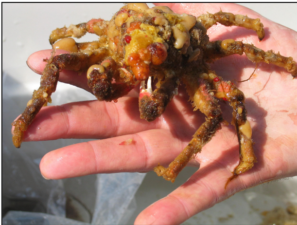
Plate 14: The moss crab ( Loxorhynchus crispatus ) is an expert at self-decorating. The carapace and legs of this specimen are totally obscured by zoanths, sponges and bryozoans that the crab has attached to itself.