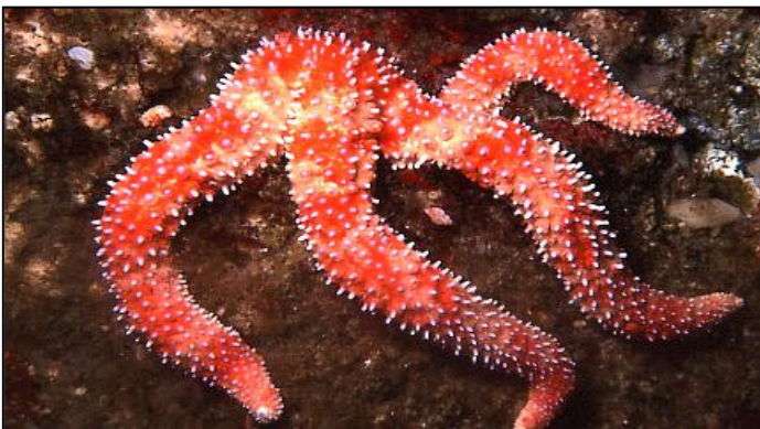
Plate 3: The painted star ( Orthasterias koehleri ) is relatively uncommon at Bowie, but its bright colour makes it stand out