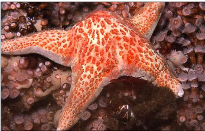
Plate 11: The broad-rayed leather star ( Dermasterias imbricata ) is common on the summit. It is known to consume a variety of prey, including anemones. It reaches 20 cm in diameter.