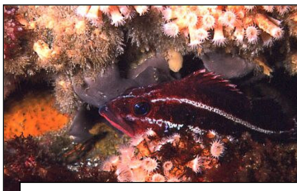
A juvenile yelloweye rockfish displaying the dark colouration typical at Bowie.

Bowie Seamount is a very “fishy” site. Rockfish, especially, are very abundant. One of the most abundant species of rockfish was the yelloweye rockfish ( Sebastes ruberrimus ) with large specimens reaching 60 cm or more. This species tended to congregate near the bottom, especially in the many gullies and crevices that riddle the reef. These yelloweye rockfish are extremely dark in colour, an unusual characteristic that has been previously reported (Yamanaka et al. 2000). Juvenile yelloweye rockfish, conspicuous due to their bands of white, were very abundant, generally hiding close to reef crevices and cracks. Stomach analysis of several adult yelloweye rockfish showed that their prey included smaller rockfish of various species.