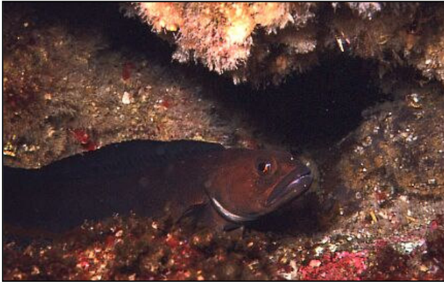
Plate 7: A wary reef dweller, the Alaskan ronquil ( Bathymaster caeruleofasciatus ) is well adapted to life amongst the crevices and caves on the summit of the seamount. It is rarely seen in British Columbia waters, except in northern areas.