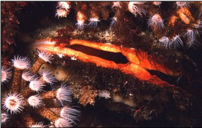
Plate 17: Rock scallops ( Crassadoma gigantea ) were common on the summit, their shells completely obscured with encrusting growth such as sponges, bryozoans, red algae and zoanthids.