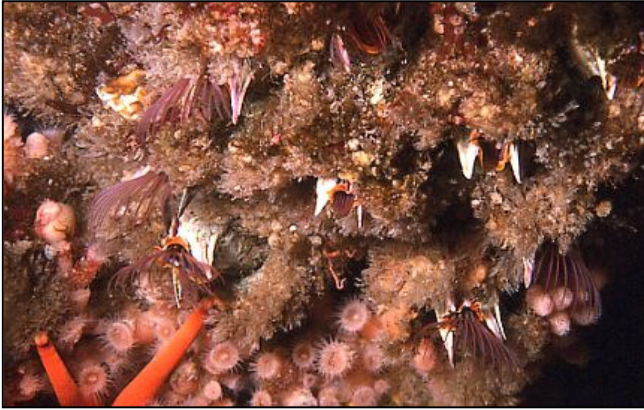
Plate 10: Clusters of giant barnacles ( Balanus nubilus ) crowded the edges of the rocky pinnacles, their shells overgrown with a dense turf of bryozoans, sponges, hydroids and zoanthids. Hairy cancer crabs ( Cancer oregonensis ) often occupied empty barnacle casings.

transporting live specimens back to Vancouver.