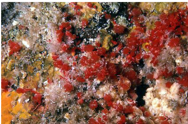
Plate 12: Tunicates were not common on the summit, however the red tunicate Ritterella rubra was common on vertical rock faces.