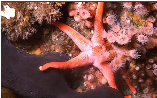
Plate 15: Blood stars ( Henricia leviuscula ) were common, eating various species of sponges. To the left is the grey ridge sponge Penares cortius .