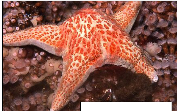
A leather star.

Sea stars were relatively conspicuous on the reef summit. The most abundant species was the blood star Henricia leviuscula [Plate 15], known to predate on sponges. The leather star Dermasterias imbricata [Plate 11] was found mostly on the top of the reef amongst various seaweeds. Other sea stars found in small numbers included the painted star Orthasterias koehleri [Plate 3], the sunflower star Pycnopodia helianthoides , the mottled star Evasterias troschelii and the long ray star Stylasterias forerri .