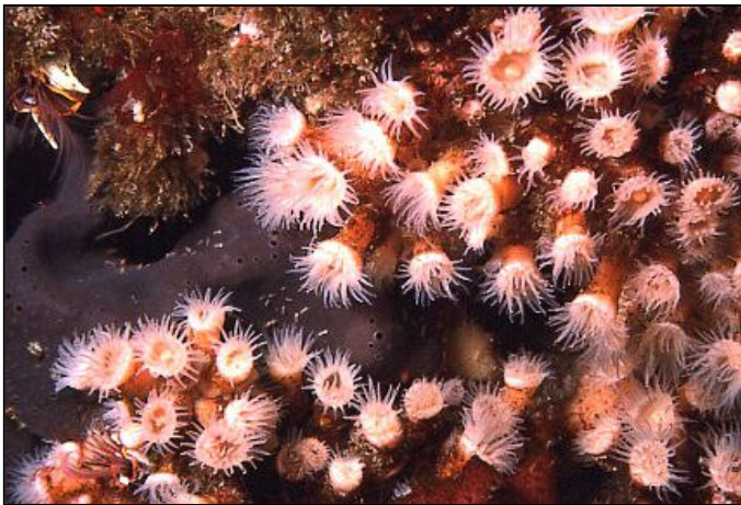
Plate 5: Colonial zoanthids ( Epizoanthus scotinus ) are very abundant on the flanks of the reef summit. They form carpets of feeding polyps that cover several square metres.

Plate 4: The red Irish lord ( Hemilepidotus hemilepidotus ) is a colourful sculpin that reaches 30 cm long. An ambush predator, it lies absolutely still on the bottom, capturing prey in its capacious mouth.