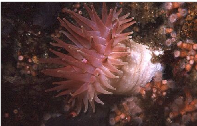
Plate 2: Reaching 15 cm in diameter, crimson anemones ( Cribrinopsis fernaldi ) are common on the summit, mostly on the steeper flanks of the reef. They have stinging cells in their tentacles that are used to capture small prey.