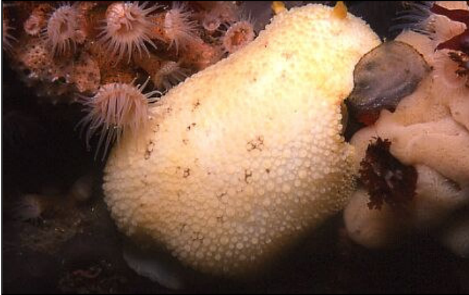
Plate 16: The lemon nudibranch ( Anisodoris nobilis ) was the largest nudibranch found on the summit, with specimens reaching 20 cm in length. It preys upon sponges.