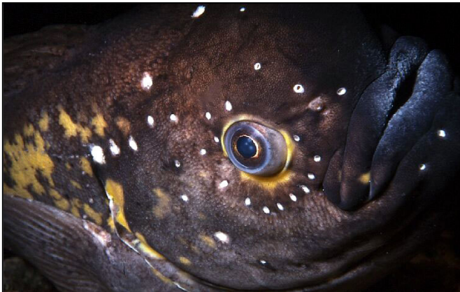
Plate 8: The only member of its family in the world, the prowfish ( Zaprora silenus ) reaches a metre in length. Those at the seamount were extremely curious, often approaching the divers closely. Individuals could be recognized by their distinctive yellow markings on the head and sides.