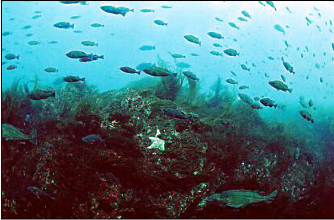
Plate 1: Twenty-five metres below the surface, the clear blue water above the summit of Bowie Seamount swarms with schools of widow ( Sebastes entomelas ) and harlequin rockfish ( S. variegatus ). The top of the volcanic peak is covered with stringy brown seaweeds known as acid kelps. Many species of algae are found deeper here than anywhere else in British Columbia waters.