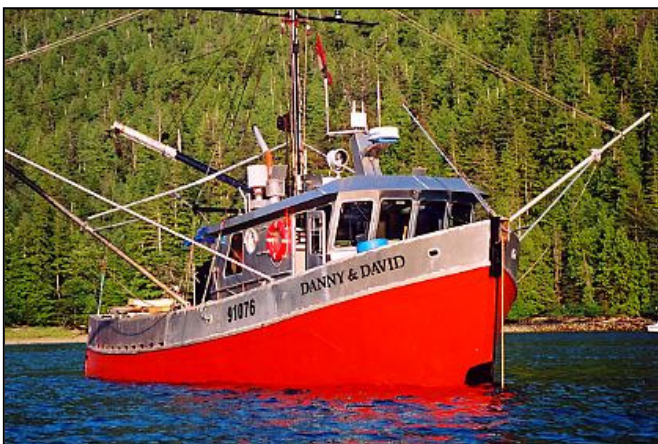
Plate 9: Converted for use as a packer in the seafood harvesting industry, the 18-m Danny & David proved to be the ideal vessel for the trip to Bowie Seamount. Its fish-hold was flooded to provide a means of