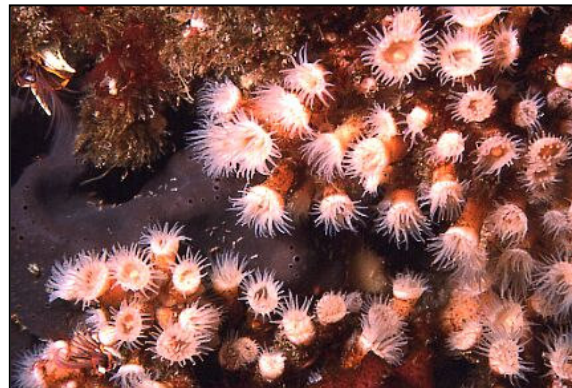
A dense mat of zoanthids.

The most abundant and conspicuous benthic cnidarian was the zoanthid ( Epizoanthus scotinus ) [Plate 5] which formed extensive mats on vertical surfaces. Several species of anemones were observed, including the plumose anemone ( Metridium farcimen ), crimson anemone ( Cribrinopsis fernaldi ) [Plate 2], fish-eating anemone ( Urticina piscivora ) and white-spotted anemone ( Urticina lofotensis ).