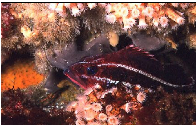
Plate 6: A juvenile yelloweye rockfish ( Sebastes ruberrimus ) rests in a crevice. With their two bold horizontal stripes, these young specimens were once thought to be a separate species since they look quite unlike adult yelloweyes.

Plate 5: Colonial zoanthids ( Epizoanthus scotinus ) are very abundant on the flanks of the reef summit. They form carpets of feeding polyps that cover several square metres.