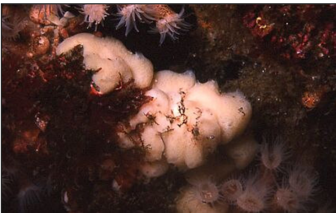
Plate 18: Several different species of sponges were observed on the summit, including this puffy encrusting species. Samples were collected for identification.