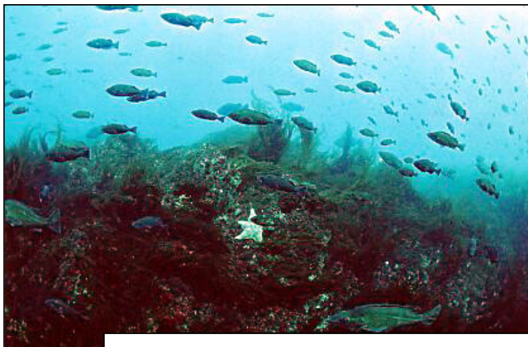
The top of the seamount showing schools of rockfish and a dense growth of the flattened acid kelp.

Water clarity at the seamount is very good, resulting in high levels of light penetration to depths of 40 metres or more. Consequently, brown and red seaweeds are diverse and abundant. Brown seaweeds dominate the upper parts of the reef, while red algae are more widely distributed.