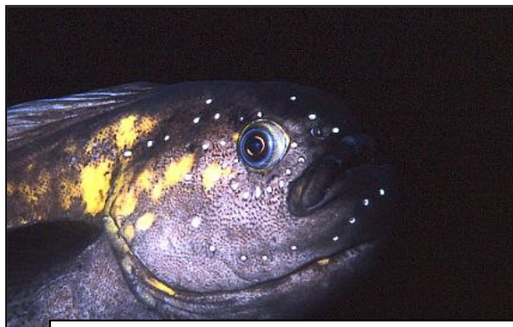
Prowfish were common at Bowie, often swimming in the open.

The prowfish Zaprora silenus [Plate 8] was found living in caves on the reef, and was also encountered swimming in the open. These peculiar fish were extremely curious and would often approach divers very closely. On several occasions they followed divers nearly to the surface, nibbling at plastic bags they thought might be edible jellyfish.