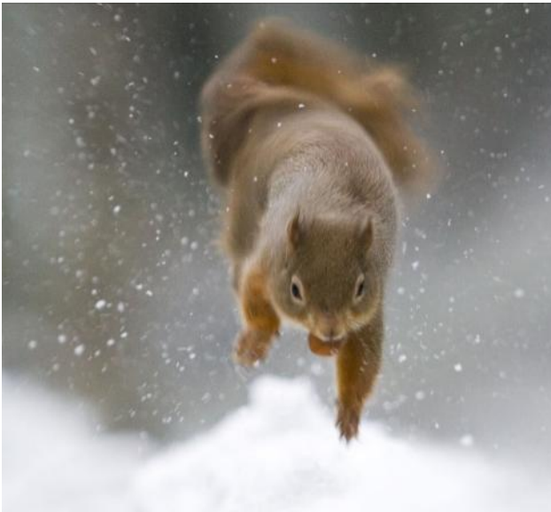
Red squirrel ( Sciurus vulgaris ) in Cairngorms National Park, Scotland: species of European Community Interest listed in Annex 4 of the Directive in need of strict protection

There are also lessons from the poor performance in the EU to be learned if others adopt similar transnational approaches. Three are fundamental. First, top-down approaches are negative, result in legitimate opposition from affected parties, especially private owners, and result in longer timescales and high costs through legal challenges through the courts. Second, all policies and financial instruments which have or could have a perverse effect on biodiversity need to be addressed and hopefully resolved, otherwise, however well conceived the biodiversity conservation measures are, they will not be effective. Third, as is well known in some continents, but not in Europe, large scale connectivity measures are needed to cope with species migration and with the effects of climate change on the distribution of species and habitats.