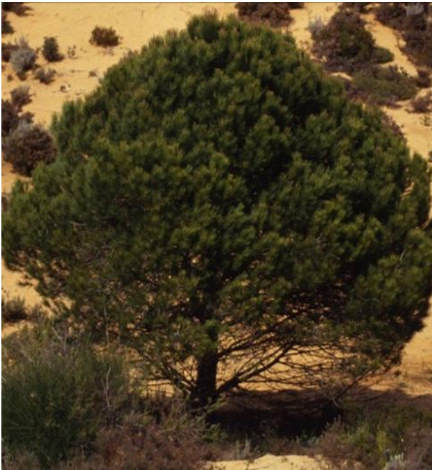
Coto Doñana National Park, Spain: large wetland, shrub and sand dune area internationally important for migrating birds and the Imperial Eagle

more environmentally friendly, for example the Maastricht Treaty, the EC Communication introducing the Biodiversity Strategy, the El Teide and Malahide declarations and the European Parliament Resolutions (for example, on the EU Biodiversity Strategy, 20 th April 2012) and the conclusions of relevant Council meetings (for example, 19 th December 2011). The Mid-Term Review of the CAP, implemented over the past decade in Member States, is perhaps the most far-reaching step as no support for agriculture is now provided to farmers without their compliance to a strict code of environmental practice. However, the recently agreed revision of the Common Agricultural Policy is arguably a retrogressive step as compliance with nature protection is not changed in a positive direction as the European Commission originally proposed, demonstrating the power of the agricultural lobby in Europe compared with the nature conservation lobby. There have been instances where Member State governments have been threatened with removal of access to certain EC funds unless they improve their performance on the implementation of Natura 2000, for example, Bulgaria and Romania. These approaches are helpful, but there is not a universally agreed approach linking compliance with agreed EU Directives with the provision of funds for programmes and projects which might cause problems.