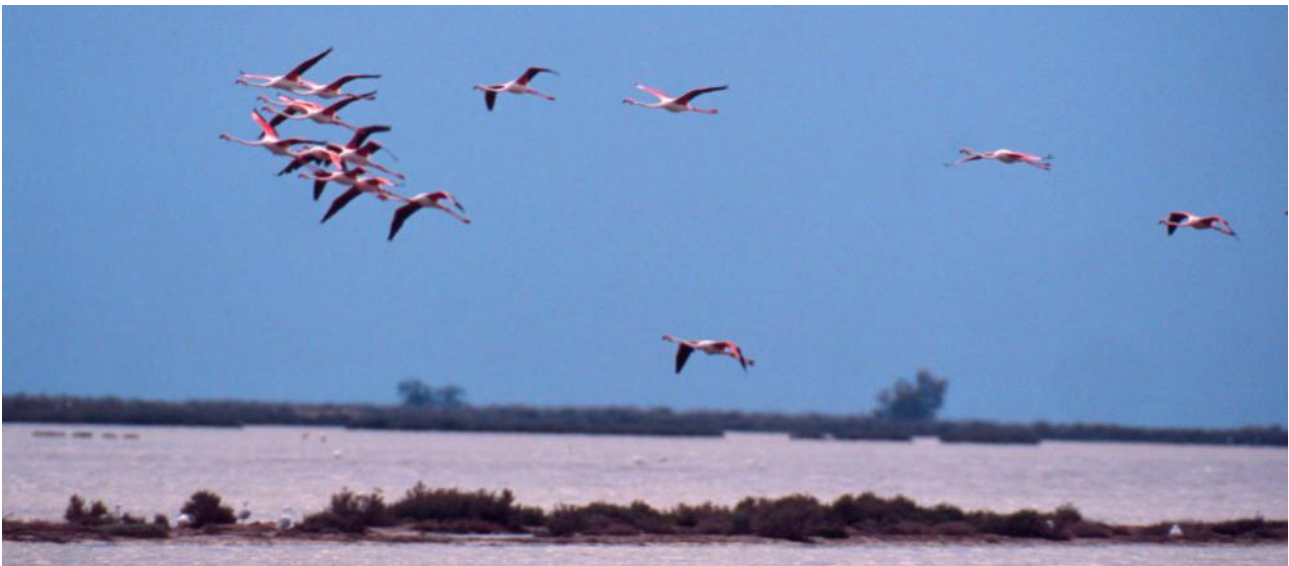
Coastal lagoon habitat for bird protection; greater flamingo ( Phoenicopterus ruber ) flock. Camargue, France

The only way forward in some countries was for the implementation agency to take the matter into its own hands and establish a consultation process. However, the consultation could only be on a limited basis because of the way the Directives are worded: did those consulted agree or otherwise with the scientific case for classification of the site? This was a very difficult question for many stakeholders to answer as they had neither the scientific expertise nor the information to challenge the conservation experts. This led in some instances in Scotland, for example, to protestors hiring their own nature conservation experts to challenge the case put forward by the state agencies. In retrospect, this was a valuable exercise as it forced a more rigorous approach to be taken by the state agencies. Although use of formal procedures for effective engagement with key stakeholders would have lengthened the timescales for agreeing sites to be designated, it would have probably resulted in more durable agreements between the interests.