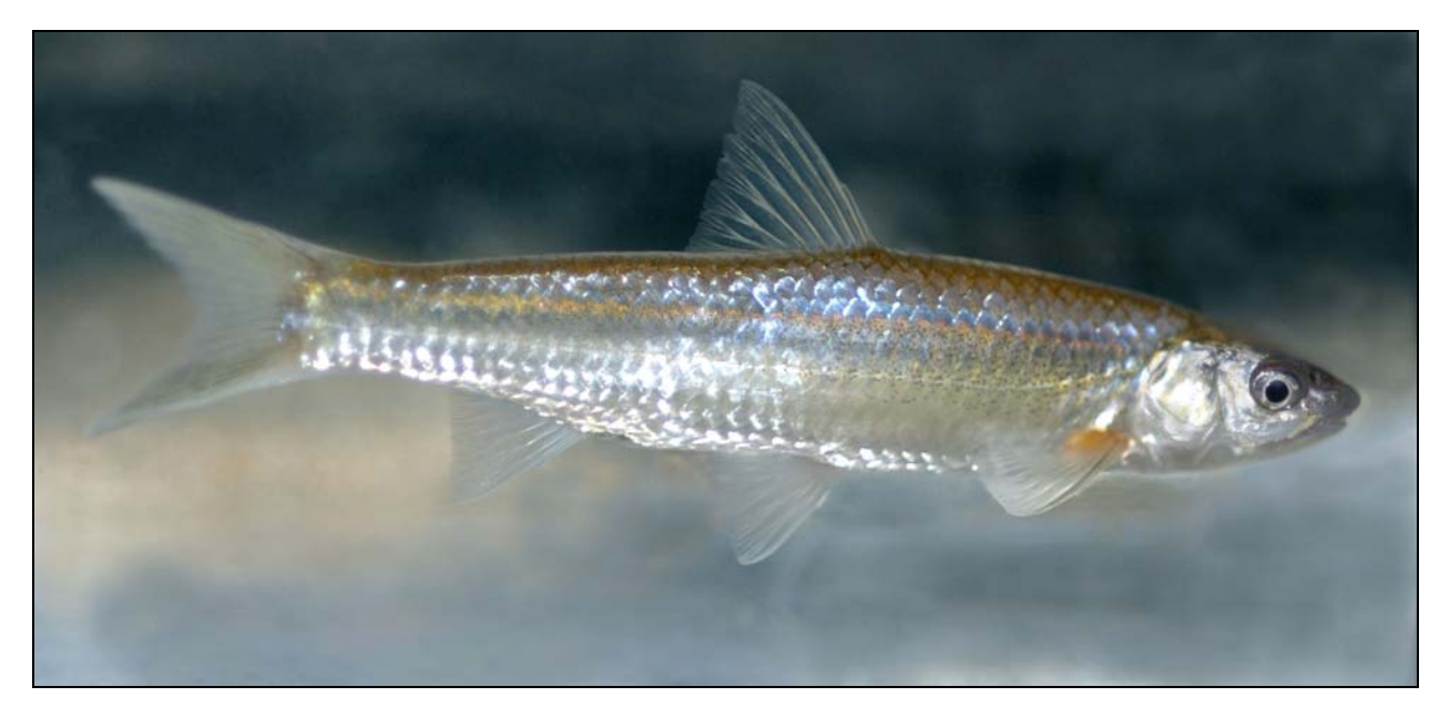
Figure 2. Western silvery minnow (Photo Credit: Karen Scott, DFO).