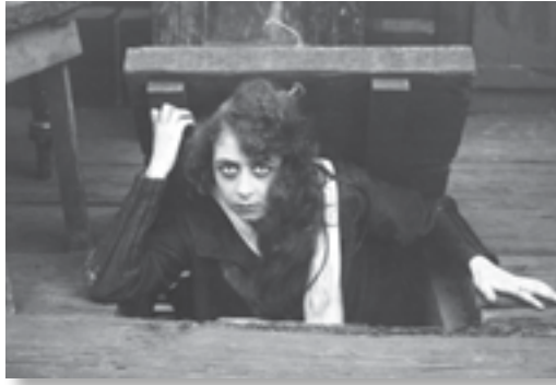
Lottie Lyell stars as Eileen in The Church and The Woman (Australia 1917, Raymond Longford).