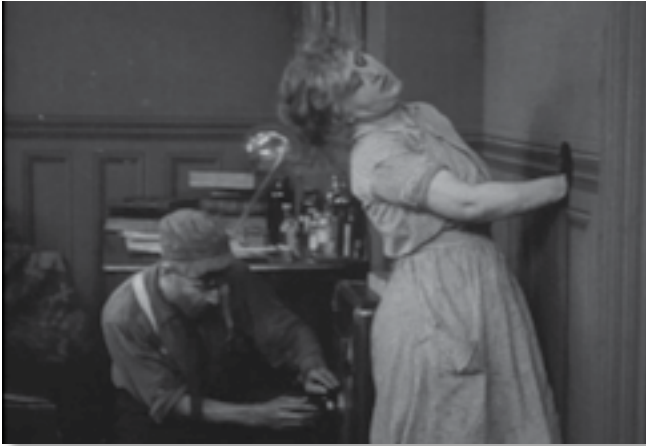
Harry Carey and Grace Henderson in The Unseen Enemy (Biograph, 1912).