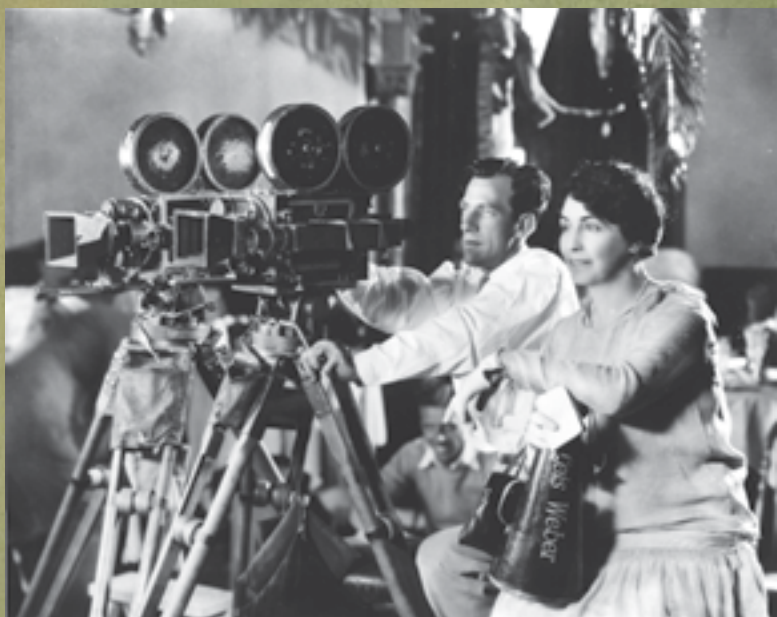
Lois Weber on the set of The Angel of Broadway (1927) with cinematographer Arthur C. Miller.