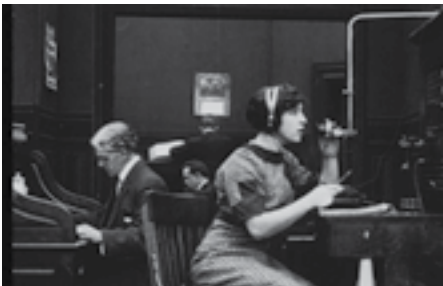
Telephone Girl (1912).

Telephone Girl (US 1912, Vitagraph Company) 9 minutes. Digital. [World premiere of the 2015 restoration.]