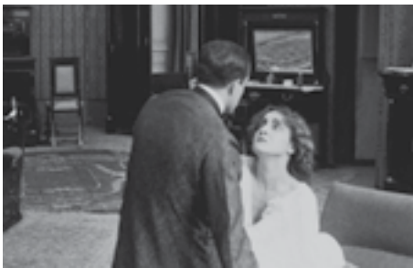
Lyda Borelli in Una Notta a Calcutta (1918). Courtesy of EYE.

Mario Caserini) 9 minutes. Digital. Courtesy of EYE. [US premiere of the 2014 restoration.]