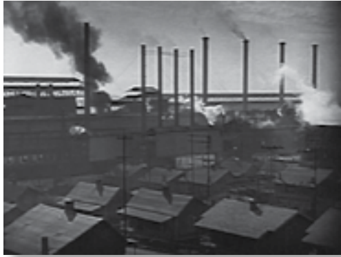
The final shot of Baby Face (Warner Bros., 1933).