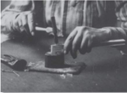
Fabricatie van kanten waaiers (1911). Courtesy of EYE.

Fabricatie van kanten waaiers [ Manufacturing Folding Fans ] (France 1911, Pathé) 5 minutes. Digital. Courtesy of EYE.