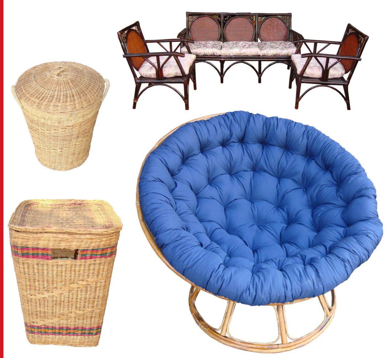
Sustainable Rattan Production; EC/SWITCH-Asia in cooperation with WWF Austria

Hotel: Cambodiana Hotel, Raffle Le Royal, Seaworld River Phnom Penh, Angkor Siem Reap and Angkor Phnom Penh.