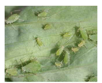
Potato aphid (Macrosiphum euphorbiae)