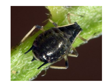
Green citrus aphid (Aphis spiraecola)