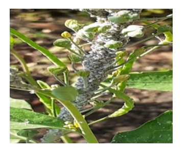
Aphis craccivora (cowpea aphid/ Ground nut aphid)