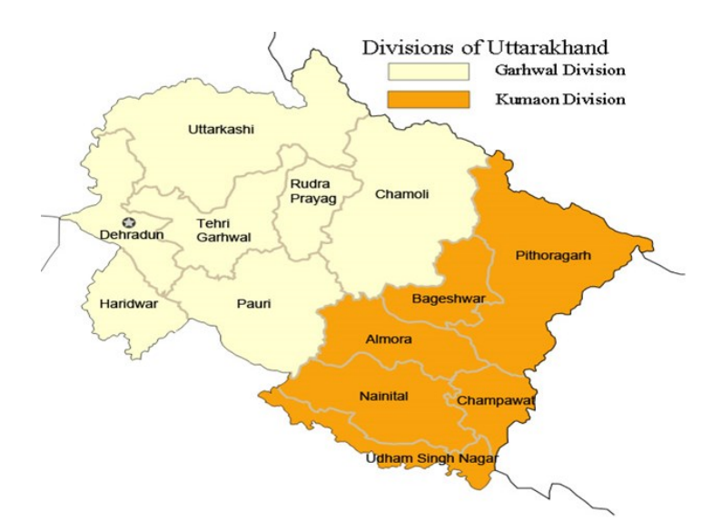
Figure 2. Map of Aphids diversity and ecology in Garhwal region of Uttarakhand.