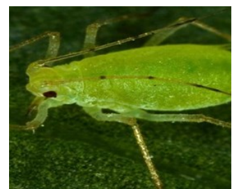
Cabbage aphid (Brevicoryne brassicae)

Figure 3. Selected aphids species of Uttarakhand.