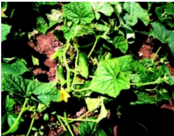
Fig. 1. Gherkins infected with ZYMV