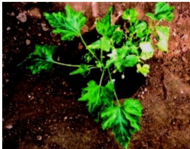
Fig. 2. Zucchini plant infected with ZYMV

ZYMV was confirmed by electron microscope (Fig. 4). The virus isolates were transmitted by aphids and mechanically on indicator plants. The presence of ZYMV in the indicator plants was confirmed by ELISA. Cucumber mosaic virus (CMV) was not detected by ELISA in any indicator plant with ZYMV symptoms. The differentiation of three isolates of ZYMV on indicator plants is presented in Table 2. Isolate ZYMV-K was characterised as mild pathogenic, isolate ZYMV-L as medium severe pathogenic, and ZYMV-H as severe pathogenic.