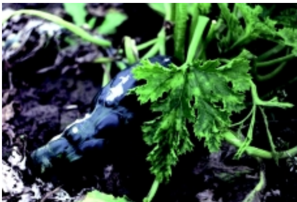
Fig. 3. Zucchini fruit infected with ZYMV

Our results proved that in the Czech Republic, ZYMV overwinters in Tripleurospermum maritimum , Stellaria media and Trifolium repens of which Sea Mayweed, T. maritimum , is a new natural host. Infected weeds are a source of infection on cucurbits in springtime. We are continuing the research on the epidemiology of ZYMV in the Czech Republic and on transmission of ZYMV by seeds of cucurbit plants.