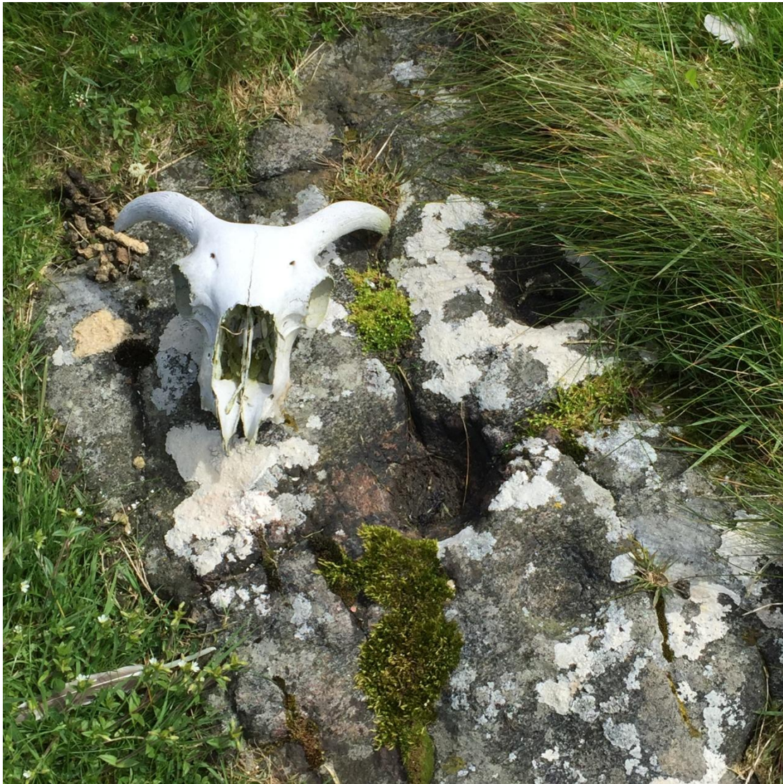
Cup-marked rock near the biggest mound. We put the sheep's skull there - for scale, not ritual! I think it remains the case that nobody really knows what cup marks were for.

What Martin had referred to as “this little plot” seemed to me to extend over perhaps a dozen acres, but sense of this is perhaps made by the RCAHMS statement: “Until the early 20th century the site was marked by an uncultivated area in arable ground ... but there are no remains except for the cross-marked stone.” RCAHMS also suggests that mounds to the west of the burial site are field clearance mounds. I lacked the archaeological competence to interpret what I was seeing, but clearly, some modern survey work would be merited. The largest of the mounds are visible with the naked eye from where Alda stopped his taxi as pimples on the hilltop three miles away.