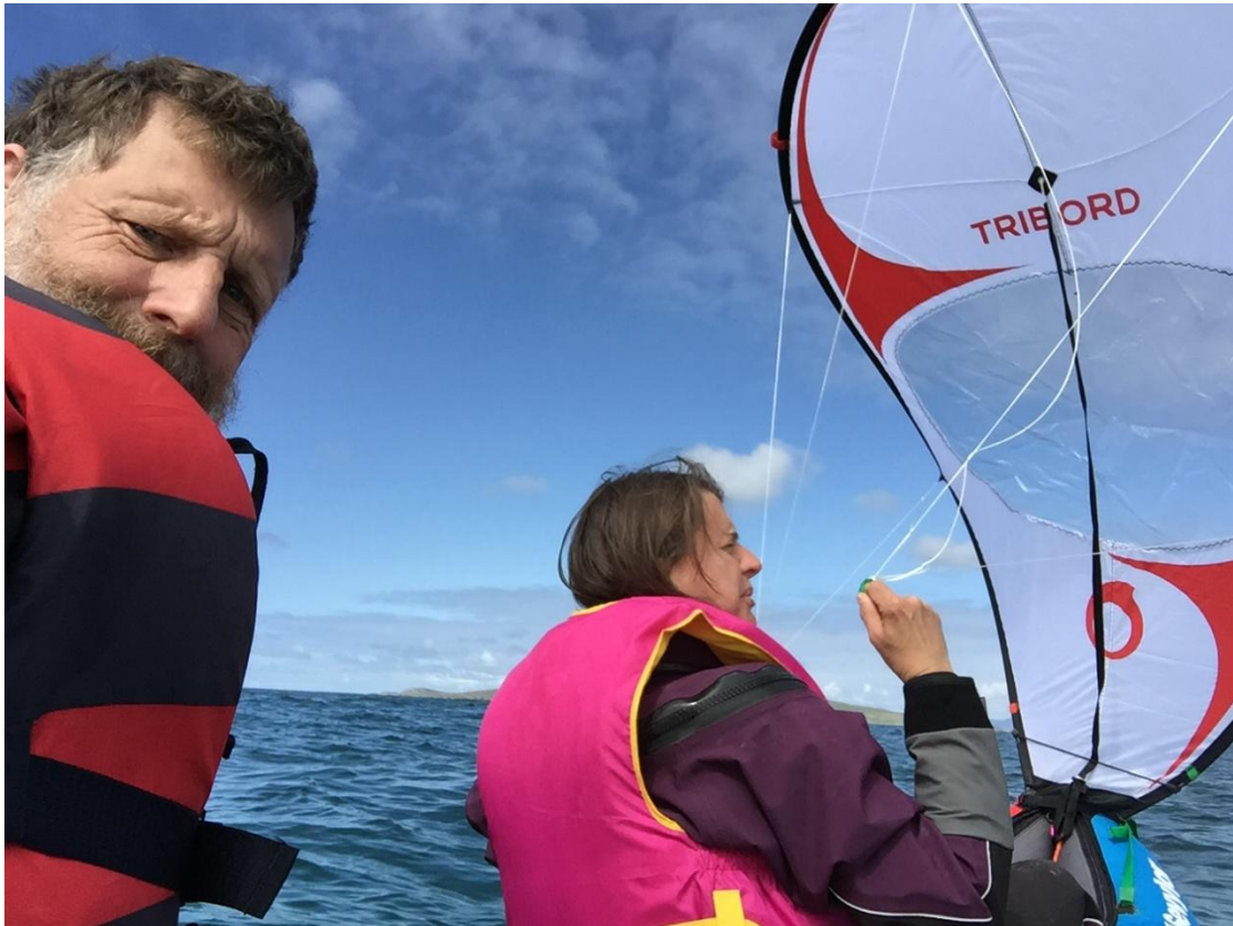
Back to Berneray under sail in a gentle breeze