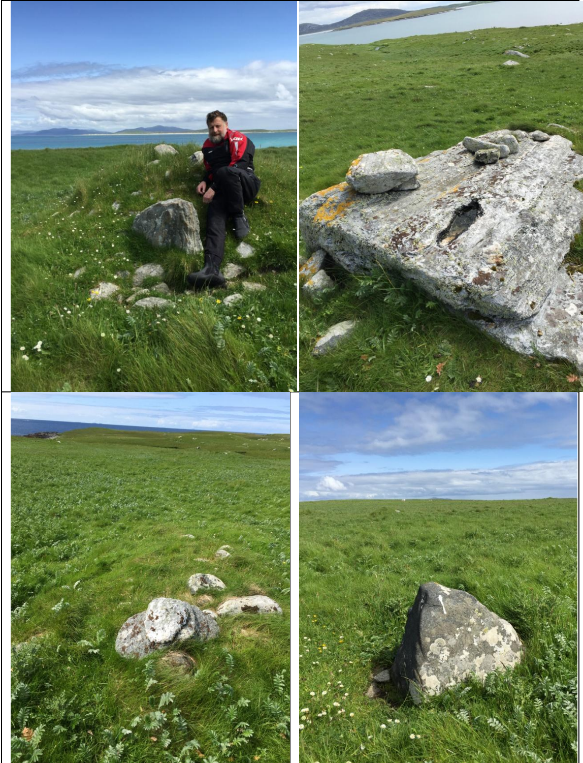
Clockwise: 1) The largest of the Boreray mounds, 2) Slab with apparent footprint, 3) Quartz headstone on low mound, 4) A black hornblende rock that reminded me of the type found in Scandinavia to which a dab of fish oil would be applied as a blessing or propitiation, such stones being seen as “old friends”.

Vérène and I scrambled up the slope behind the cross, heading west towards a number of low mounds on the skyline. Close to the largest mound we found the cup marks and in an area of about twelve acres round about, there were various other mounds and distinctive stones including a huge slab that appeared inset with a footprint, a mound headed with a quartz knob and a pinnacle-like black hornblende boulder.