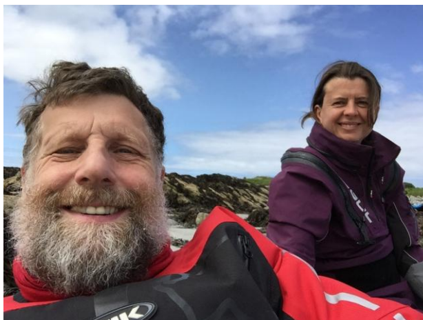
What they call these days a "Selfie" – the on-board taking of which being a yogic feat of navigational contortion