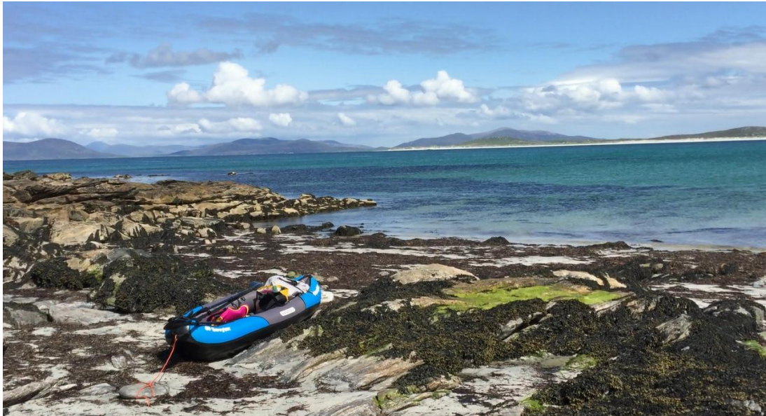
Looking back to Berneray beach from Boreray, Roineabhal on Harris to the right

by the superquarry dreams of a multinational corporation – the most prominent. On gaining a little height, St Kilda and other oceanic islands were clearly visible to the west, and hidden from sight but far to the south would have been Eigg, Iona and then, eventually, the full stop of Ireland, far to the foot of the great Outer Hebridean exclamation mark in the sea. At least, that is how it might look from space.