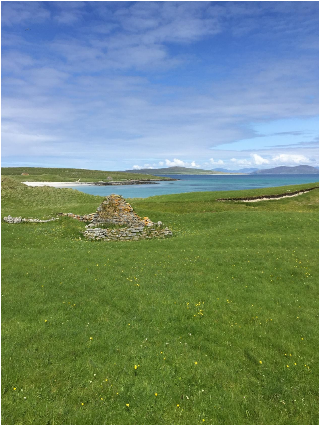
Walking back from the Field of the Monks towards Cailleacha Dubha (distant green point) where our canoe was beached