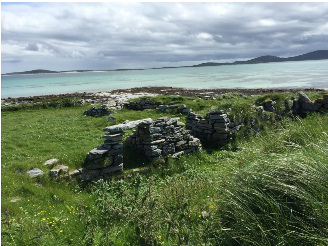
Boreray was evacuated in 1923, having become too remote for all but one family

Once fully ashore, we wandered amongst the ruins of past settlements. The islanders had chosen to evacuate in 1923. One family subsequently returned, but the last of these died in the 1960s after the creation of the island's single croft smallholding.