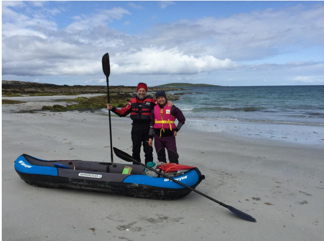
Departure from Berneray, with the northerly hump of Boreray looking deceptively close behind