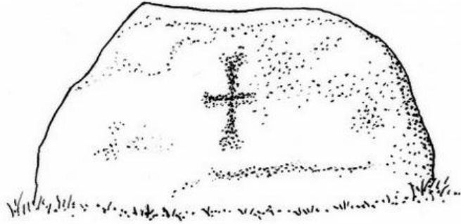
The Boreray cross-incised stone that may have gone missing, RCAHM reference SC 406991