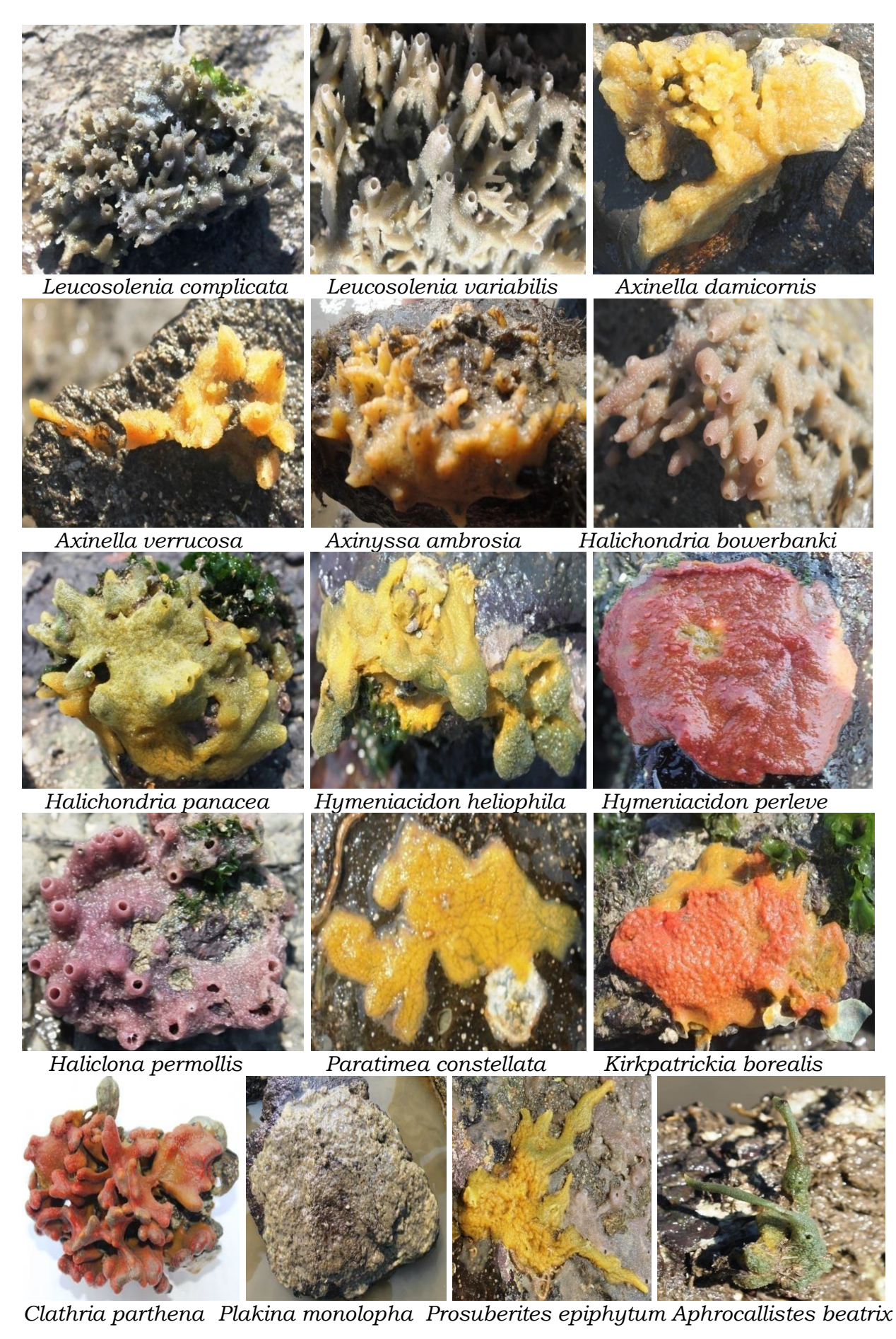
Figure 3: Sponges from coastal waters of Uran, Navi Mumbai