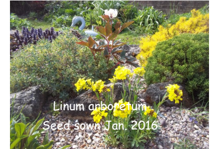
Linum arborescens Seed sown Jan. 2016