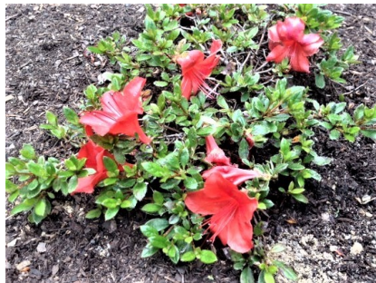
A couple of pictures from my garden.

Cyclamen hederifolium I've never had it flowering this early before, June. A late flowering dwarf Rhododendron, called I think, R. nakaharae 'Mariko'.