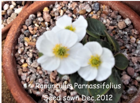
Ranunculus Parnassifolius Seed sown Dec.2012