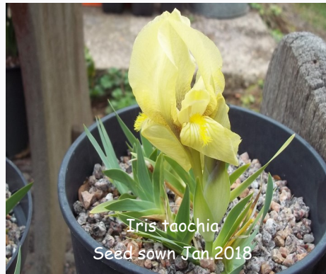
Iris taochia Seed sown Jan 2018