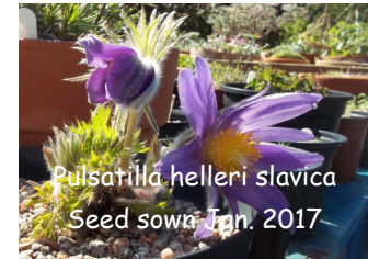
Pulsatilla helleri slavica Seed sown Jan. 2017