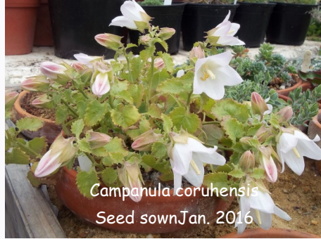
Campanula coruhensis Seed sown Jan. 2016