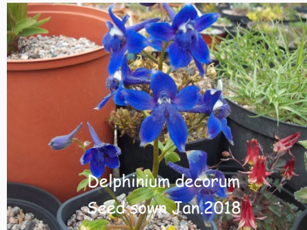
Delphinium decorum Seed sown Jan.2018