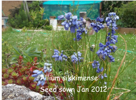
Allium sikkimense Seed sown Jan 2012