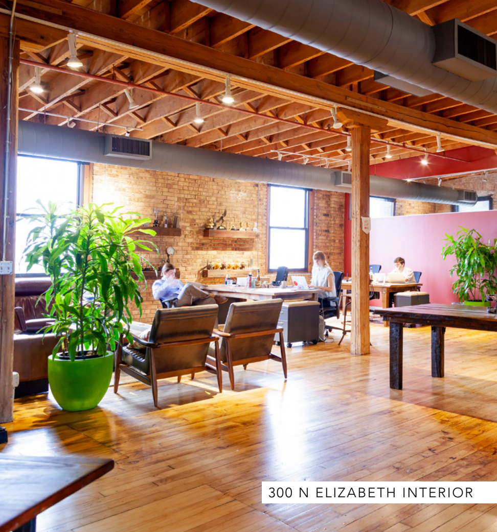
300 N ELIZABETH INTERIOR