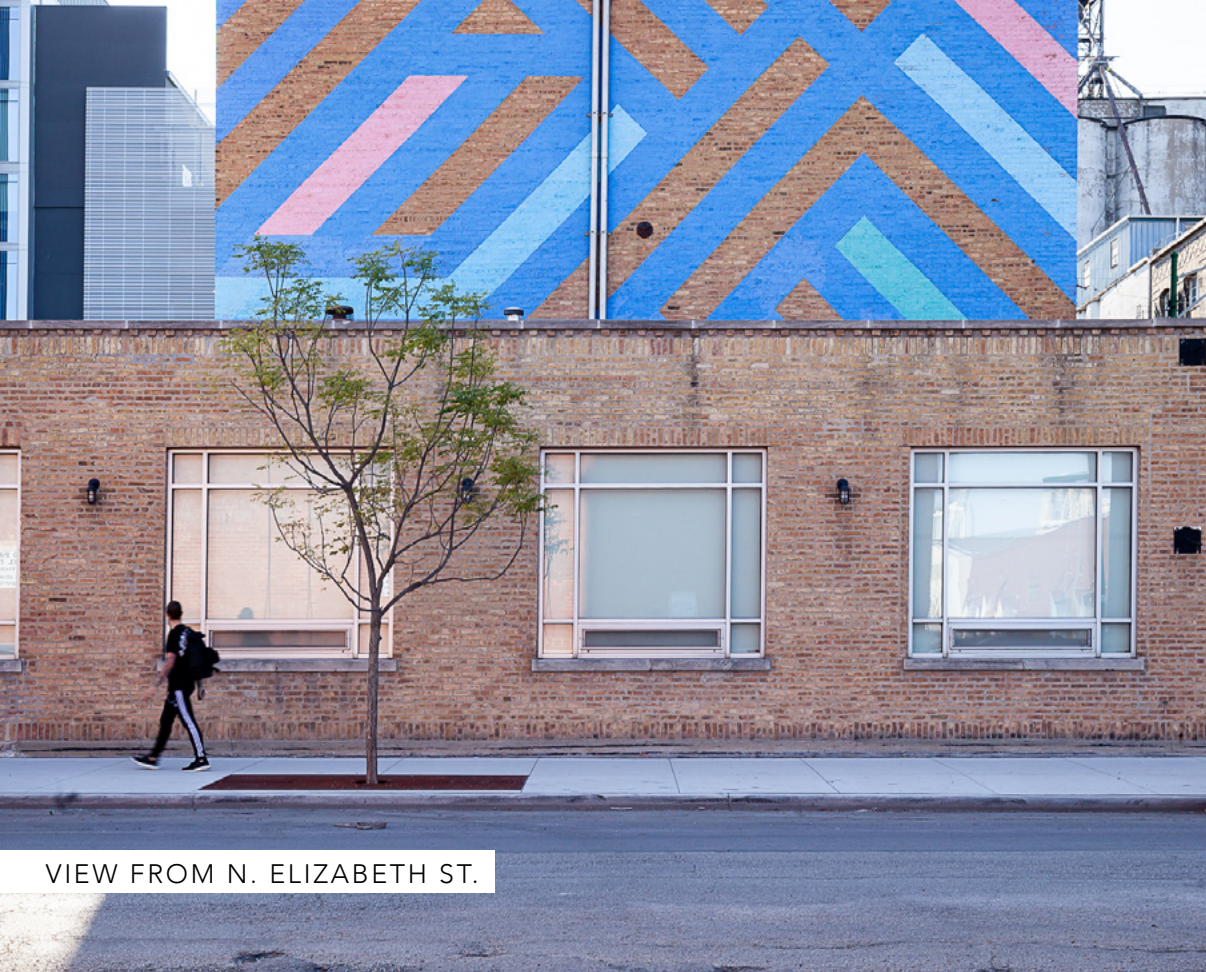
VIEW FROM N. ELIZABETH ST.