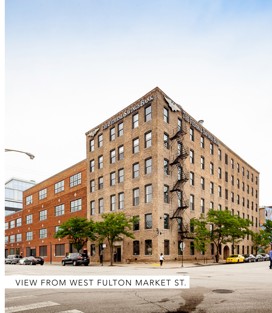
VIEW FROM WEST FULTON MARKET ST.

The Fulton West Loft Office Portfolio comprised of three buildings located at 300, 316, and 320 North Elizabeth Street in Chicago's Fulton Market District. 300 and 320 N Elizabeth were built in 1916 and 1920, respectfully. The trio of buildings total 167,000 SF of premier, boutique, brick-and-timber loft offices. The buildings are arranged into a campus setting, featuring a connecting outdoor courtyard.