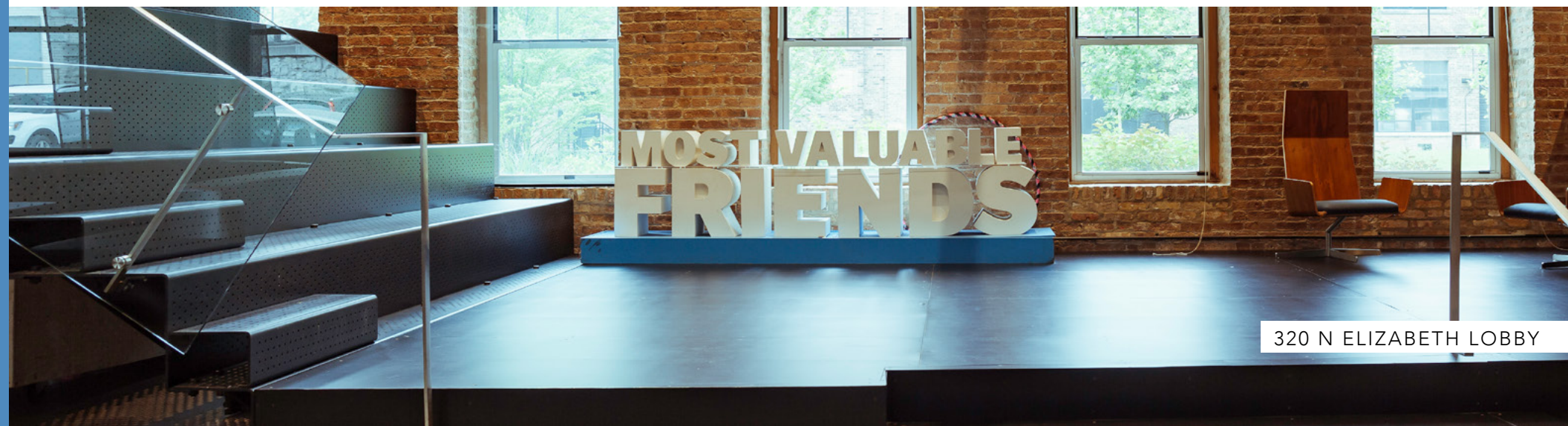
320 N ELIZABETH LOBBY