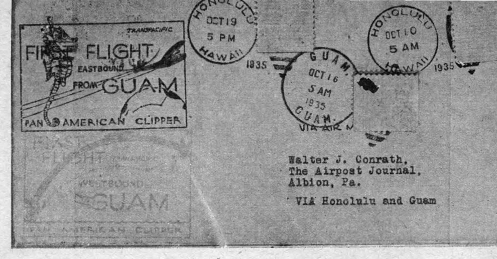
• UNOFFICIAL EXPERIMENTAL cover of the last trans-Pacific pioneering flights. This P.A.A. souvenir was carried by the Clipper on the first extension to and from Guam.

map cachet mainland of Asia, the Pacific Ocean and North America, with the route of the Clipper Snip inscribed.