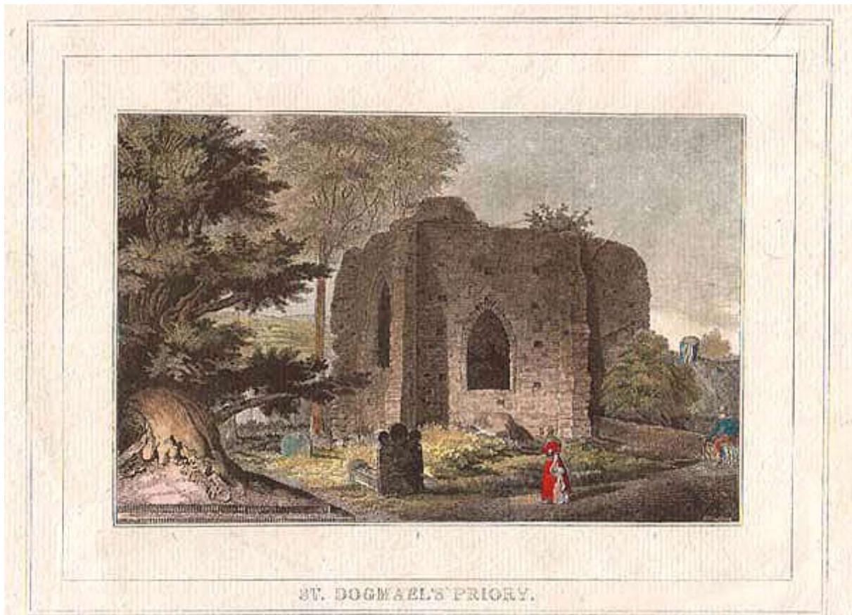
Coloured wood engraving by Hugh Hughes, dated 1823

As to when the walls were built, there are a number of old images of the site that provide some clues as to the history both of the tree and also that of its enclosure. A wood engraving by Hugh Hughes, published in 1823 (and later hand coloured) shows the scene looking north-west to south-east. By coincidence, Tim Hills’ photograph taken in 1999 was taken from the same viewpoint with the same ruined section of the north transept of the abbey in the background.