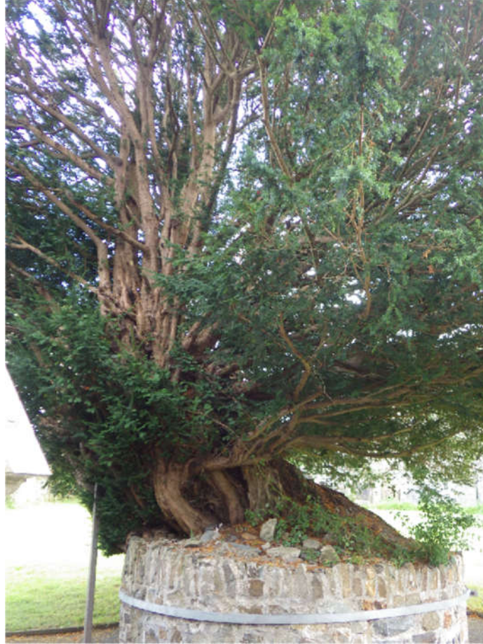
Yew tree viewed from north to south