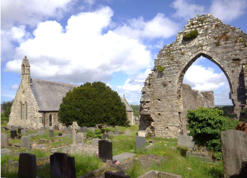
Church as seen from the south-west

St Dogmaels (also known as Llandudoch in the Welsh language) is a large village in Pembrokeshire, situated on the south side of estuary of the river Teifi, a mile downstream from Cardigan, county town of neighbouring Ceredigion. At the heart of the village are the ruins of St. Dogmaels Abbey and to the north of the abbey, within its former precinct, stands the parish church of St Thomas the Martyr. Immediately adjacent to the church is the Yew tree that is the subject of these notes.