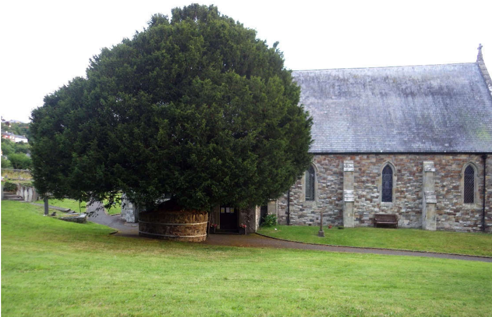
Church and tree seen from the south

The tree is growing within a circular stone enclosure 3.6 metres in diameter with walls about 1.45m above the surrounding asphalt-surfaced path just 3 metres from away the south porch. The structure of the enclosure has been reinforced by two substantial iron bands fitted around its circumference.