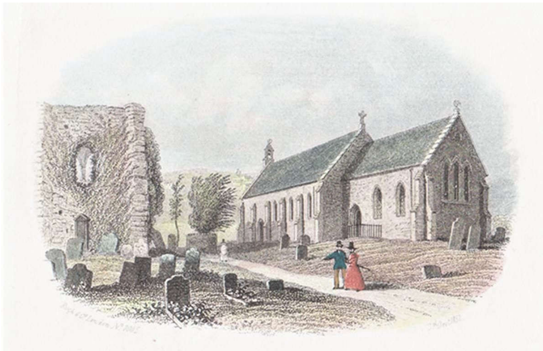
"Church & Abbey of St. Dogmaels". Line engraving by Rock & Co. London. Published December 1852 with later hand colouring

The building shown in these images from the first half of the 19 th century is not the structure that now stands on the site as the church was rebuilt over the period 1848 to 1852. We have another engraving, this one published by Rock & Co and dated 1852, the date indicating that it must illustrate the new building very soon after it was reopened. (Note the absence of the south porch, which was only added in 1925).