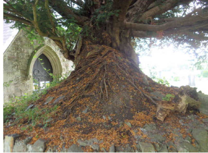
Base of tree SW to NE