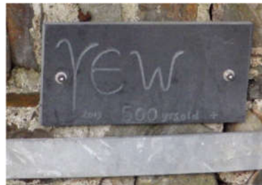
Plaque on east side of enclosure