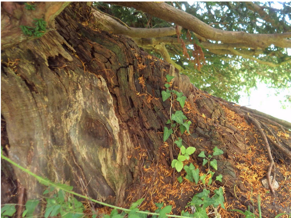
West side of the base of the tree showing cubical rot. Note also the surface roots, exploiting the decayed material derived from the breakdown of the dead woody material.

The situation we see now is but a fragment of the original tree but one that survives and continues to flourish, entirely confined to the easternmost part of enclosure, the mounded surface to the west no doubt reflecting the presence of the decayed trunk below the surface. One reason that the tree does continue to flourish is no doubt as a result of fungal action breaking down old, dead material within the enclosure, freeing up nutrients for the tree to re-absorb. The mounded central area is no doubt composed in large part of the decayed remains of the original trunk. Decay can also be seen to be proceeding in exposed parts of the tree where a red-brown cubical rot is apparent, typical of decay caused by the sulphur polypore fungus [ Laetiporus sulphureus ], a species that commonly affect yews.