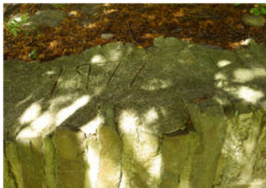
Date 1977 incised in cement