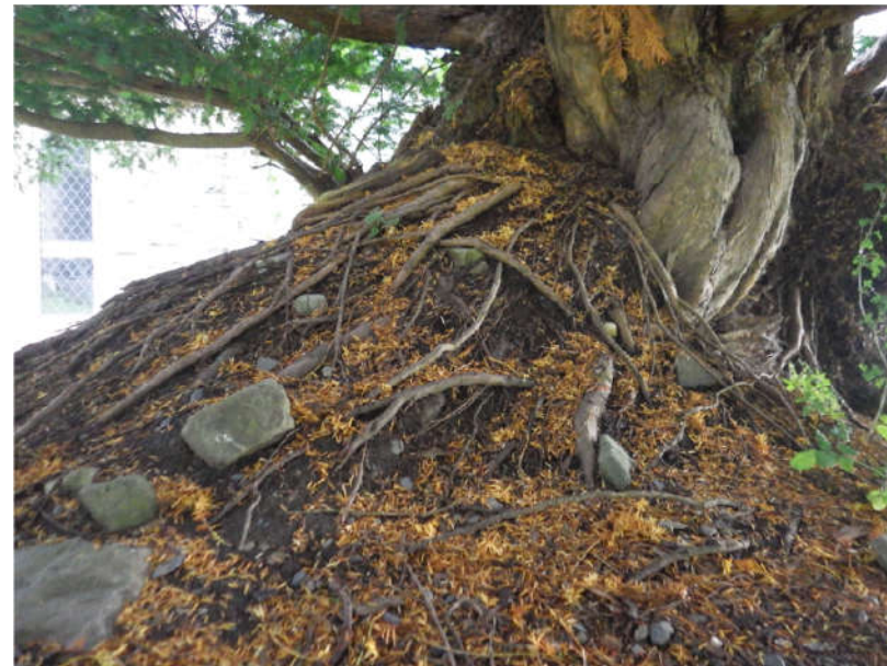
Base of tree, south side