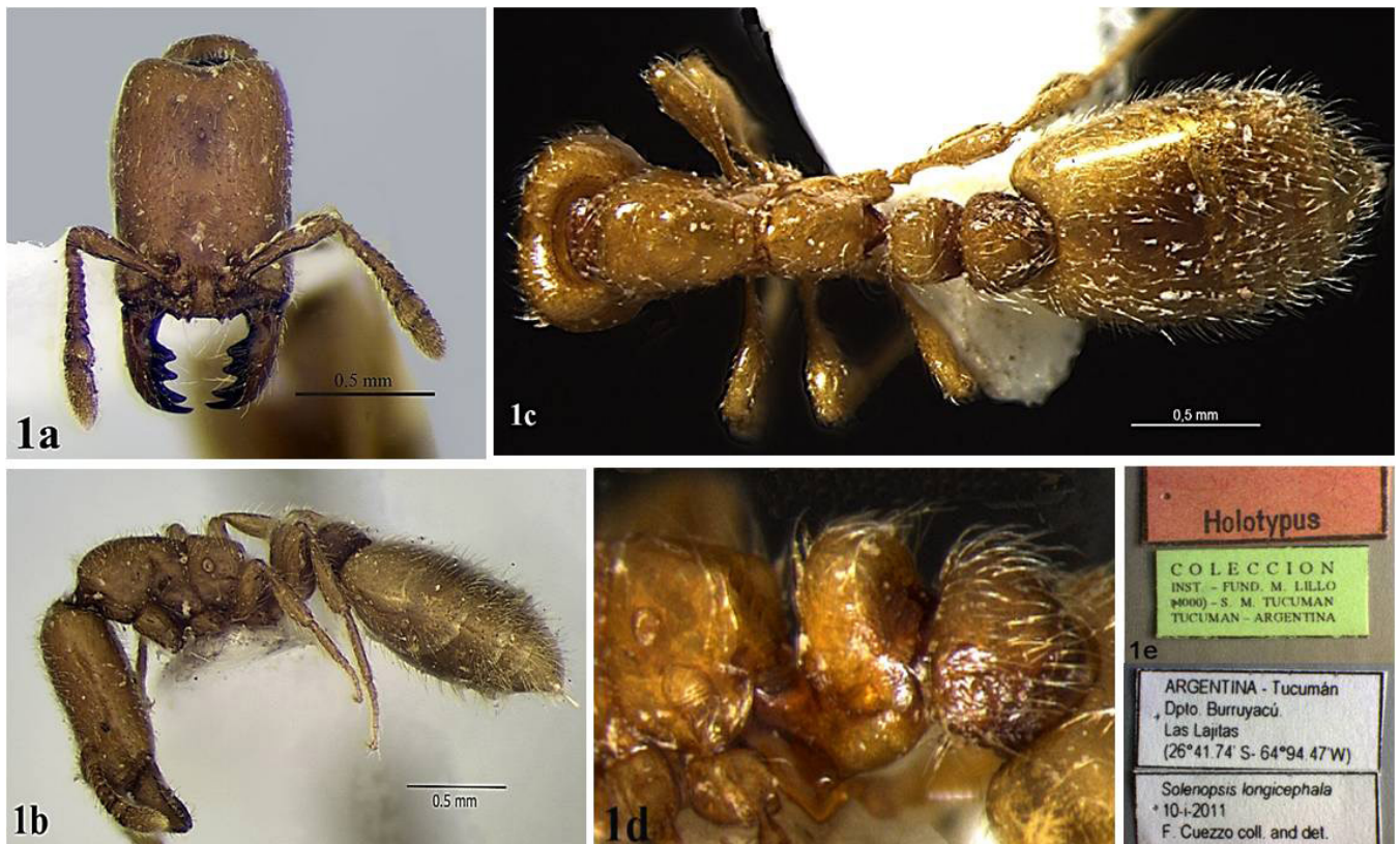
Fig 1a-e. Habitus of Solenopsis longicephala sp. n. major worker: a - head in full-face view; b - left side of body, in profile; c - dorsal view of body; d - petiole and postpetiole, lateral view; e - Holotypus labels.

Type data. Holotype major worker: Argentina, Tucumán, Dpto. Burruyacú. Las Lajitas (26° 41.74' S- 64° 94.47' W) 10-i-2011, F. Cuezco coll. (deposited in IFML). Paratypes (same data): 10 major workers and 10 minor workers (deposited in ICN), 5 major workers and 10 minor workers (deposited in MZSP), rest of the series (n= 33 major workers and 439 minor workers) deposited at IFML.