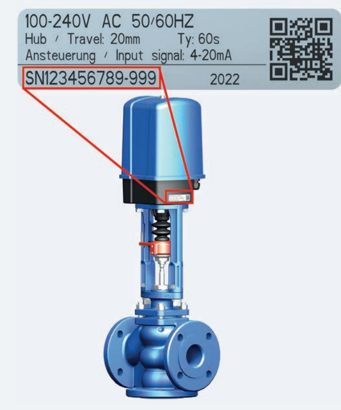
Fig. 4: Name plate showing the ARI-ID and serial number (red box) on a control valve with an electric actuator

You can find the name plate of the electric actuators in our PREMIO series on the actuator housing (Figure 4). In addition to the serial number, the name plate also shows our ARI-ID (QR code). You can get an overview of the spare parts available for your specific control valve using the ARI-ID or the serial number