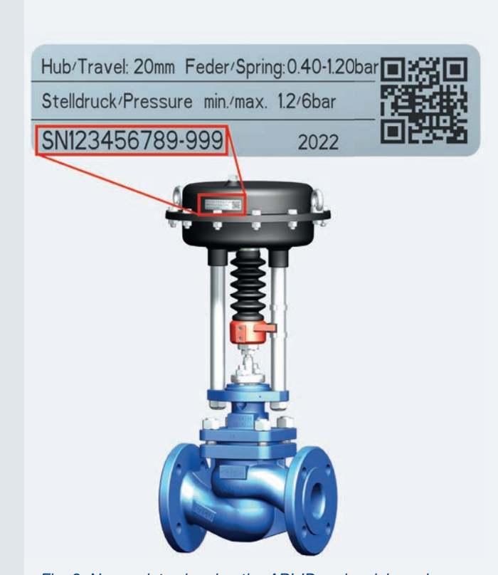
Fig. 3: Name plate showing the ARI-ID and serial number (red box) on a control valve with a pneumatic actuator

You can find the serial number of a pneumatic actuator on the name plate on the top part of the actuator housing (Figure 3). In addition to the serial number, the name plate also shows our ARI-ID (QR code). You can get an overview of the spare parts available for your specific control valve using the ARI-ID or the serial number.