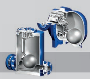
Mechanical pump systems CONLIFT®, CONA® P