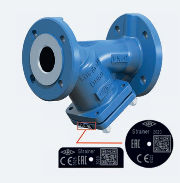
Fig. 2: Typical examples for strainers

If your valve is an older model – without an ARI-ID – please ask your regular ARI contact or get in touch with your local ARI branch office directly. You can find the contact details under "Contact" in the navigation bar. We'll be happy to help you.