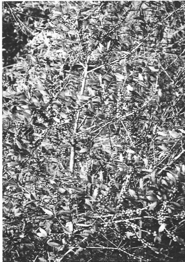
Figure 1. Close-up yaupon ( Ilex vomitoria ), showing leaves and fruit (top) and branches heavily laden with drupes in late fall (bottom)