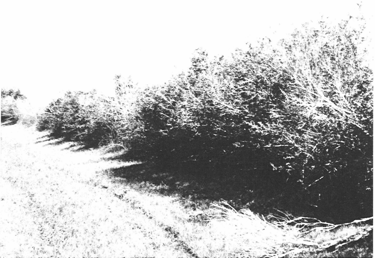
Figure 2. Yaupon thicket along a roadside in south-central Texas

on sites subjected to winds, limited salt spray and, in some instances, moderate amounts of salt in the soil (Wigginton 1963). Yaupon grows well in shade and sun, but best growth and maximum fruit production occur in open areas (Halls 1977).