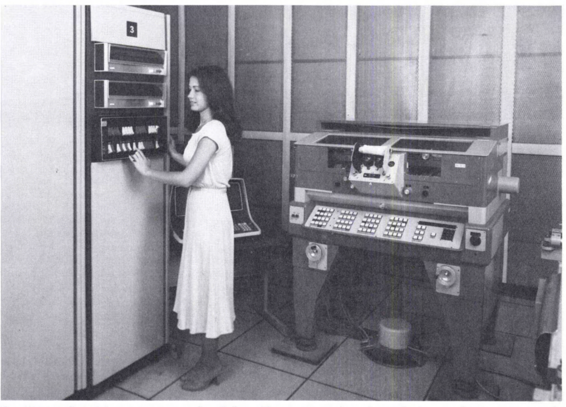
The AS-11 Analytical Stereoplotter is used at Defense Mapping Agency's Hydrographic/Topographic Center in Brookmont, Md., and at its Aerospace Center in St. Louis.