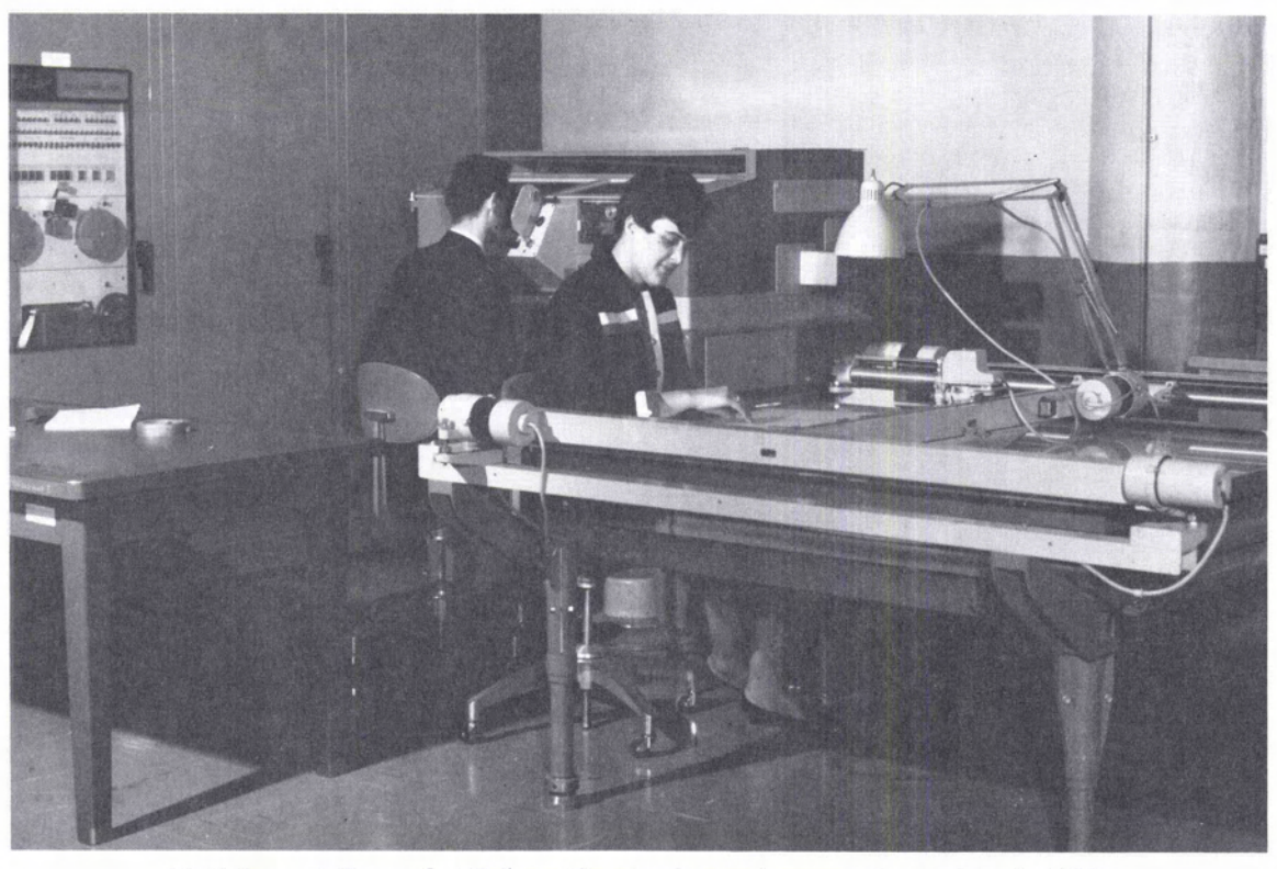
AS-11 Stereoplotter used at Defense Mapping Agency Aerospace Center in early 1960's.