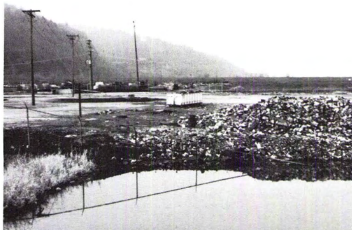
FIG. 1. Piles of car batteries over-fill areas of Doane Lake, Oregon. The December 1983 View looks to the west.

Both these photos represent the same season during different years. The 1:24,000-scale topographic maps were evaluated to determine the progression of filling the lake. Area measurements determined the approximate area of the lake filled with waste and other materials. The original area of the lake was