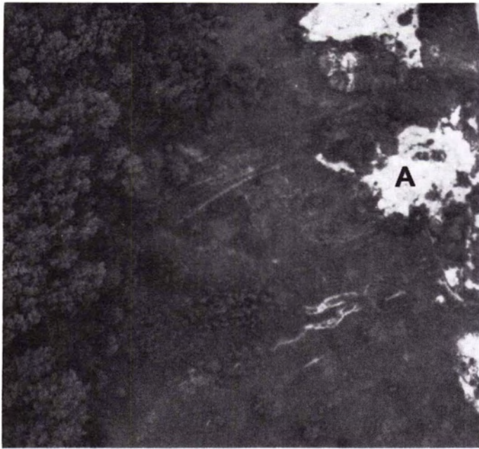
FIG. 4. Low altitude aerial photos of a closed landfill in Ohio (September 1984, original scale, ~ 1:1,000). White toned areas are bare of vegetation and are locations of surface runoff.