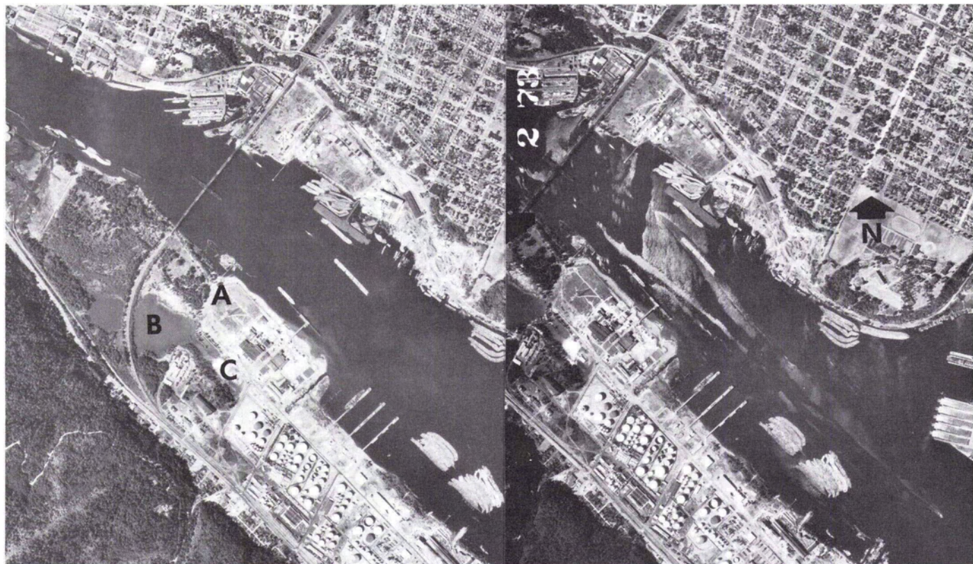
FIG. 2. 1951 aerial photograph of Doane Lake (original scale was 1:20,000). Note presence of drainage connecting the lake to the Willamette River (A), the lake east of the railroad bridge (B), and the bare area at the east end of the lake (C).

hazardous waste site (Erb et al. , 1981). The locations of the canal, school, playground, and homes constructed on the site were evident. Later coverage showed a canal covered by soil, and subsequent development of a school and homes on the site. The absence of vegetation on the covered canal in the 1970s was detected by the white tone of bare soil as interpreted from low altitude photos (Erb et al. , 1981; Lyon et al. , 1981). The low relative density of vegetation cover may be indicative of a "poisoned" site where few plants were able to grow.