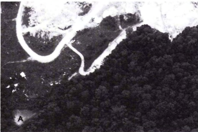
FIG. 5. Low altitude aerial photo of an open landfill in Ohio (September 1984, original scale, ~ 1:1,500). Note location of a pond formed of runoff from the pit (A).

are covered with plants in a few years. The "succession" or replacement of barren soil areas with shrubs and eventually with other woody plants is known to occur on most sites in humid regions. Plant species are adapted to exploit a variety of soil and hydrologic conditions, and "weedy" species rapidly populate sites with bare soil. With time weedy species are replaced with woody shrubs. Shrubs, in turn, will be replaced by tree species where the dominant regional land cover is forest.