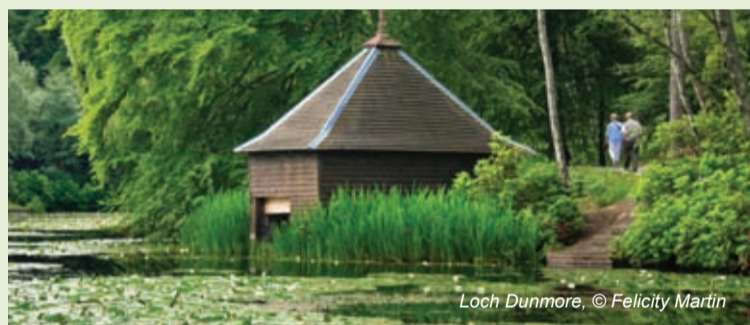
Loch Dunmore