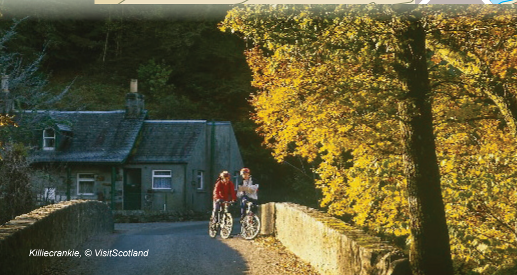
Killiecrankie, © VisitScotland