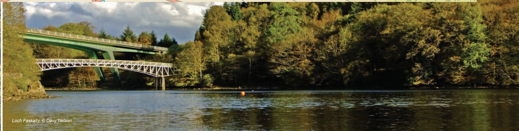
Loch Faskally