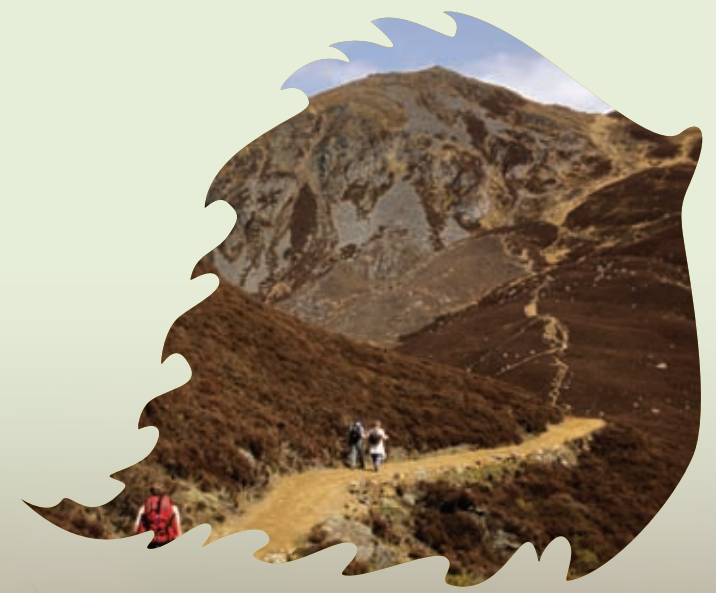
Ben Vrackie, © Phil Seale

Perth & Kinross Council, Community Greenspace on 01738 475000