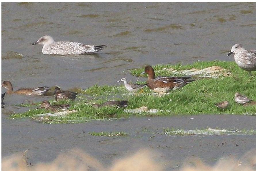
Lesser Yellowlegs at Fail