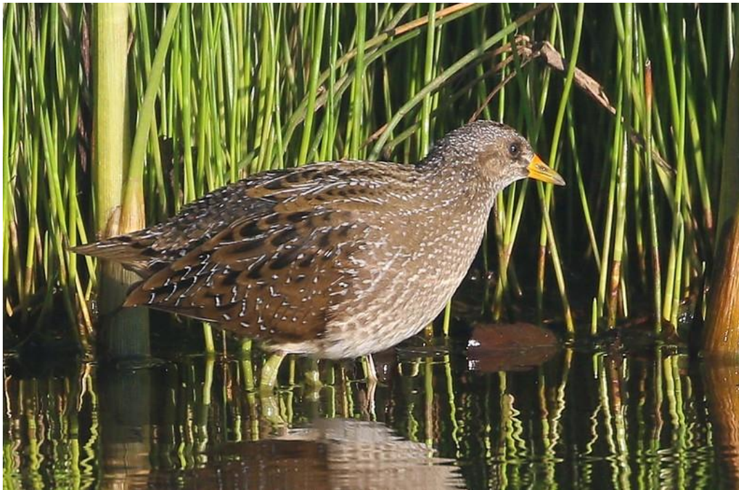
Juvenile Spotted Crake at Doonfoot (Dougie Edmond)

A well-watched juvenile was present at Doonfoot from 17 Aug-4 Sep (F McC et al. )