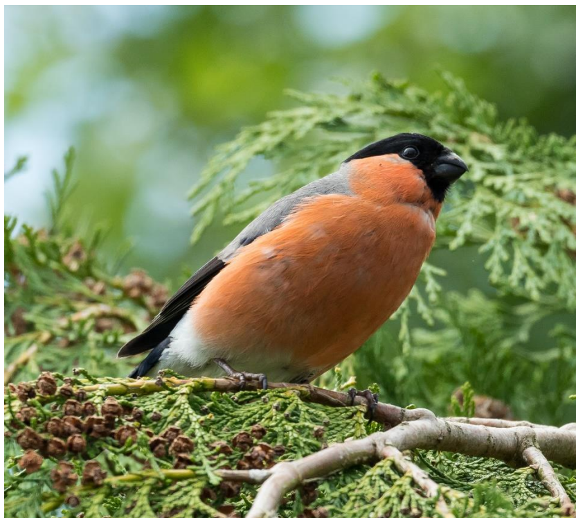
Male Bullfinch in Coylton

Counts: 5 Barclaugh Wood 11 Apr, 5 Martnaham Loch 2 May, 11 Stinchar Falls 11 Dec.