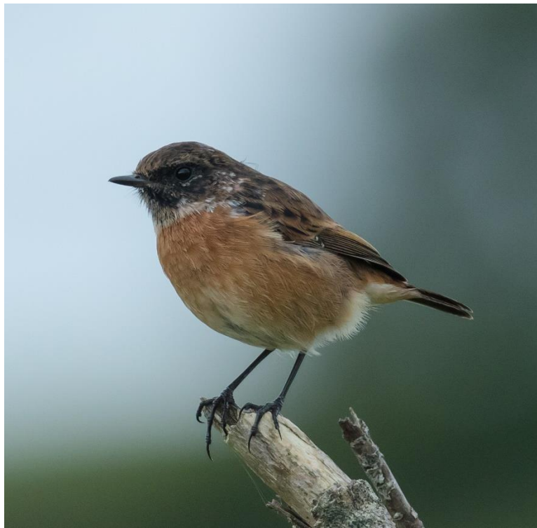
Stonechat male, post breeding

Migrants noted at Barnshean Loch (9 on 1 Sep), Carleton Port (8 on 20 Sep) m Doonfoot (6 on 28 Sep).