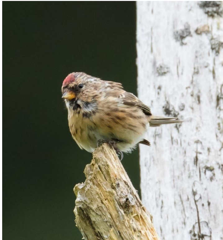
Lesser Redpoll at Barnshean

Few large flocks were reported. 15+ Knockshinnoch lagoons 20 Feb, 65 Trabboch Loch 12 Sep, 80+ Bogton Moss 5 Oct.