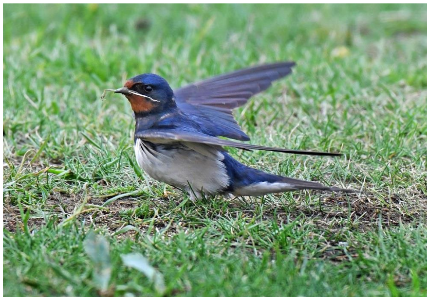
Swallow collecting nest material at Ballantrae ( Angus Hogg )

Counts and autumn departure: 30 Gull's Walk 16 Jul, 30+ Loch Doon 30 Jul, 50 Glen Afton 28 Aug, 25 Maidens 4 Sep, 24 Loans 7 Sep, 45 Fail 12 Sep, last birds included singles at Muirhead on 17 and Gypsy Pool on 26 Oct.