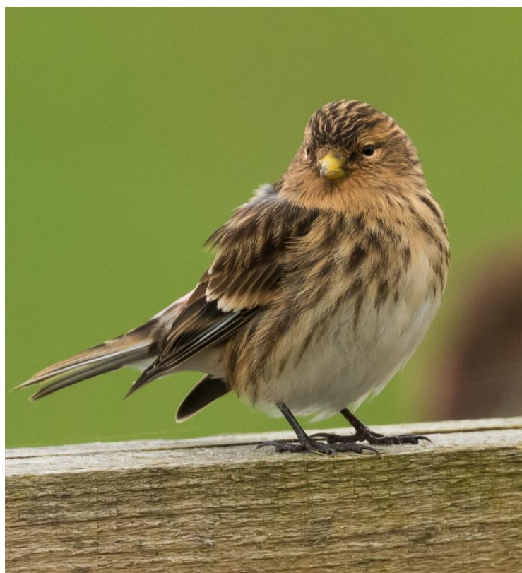
Twite at Dipple ( Dave Grant )