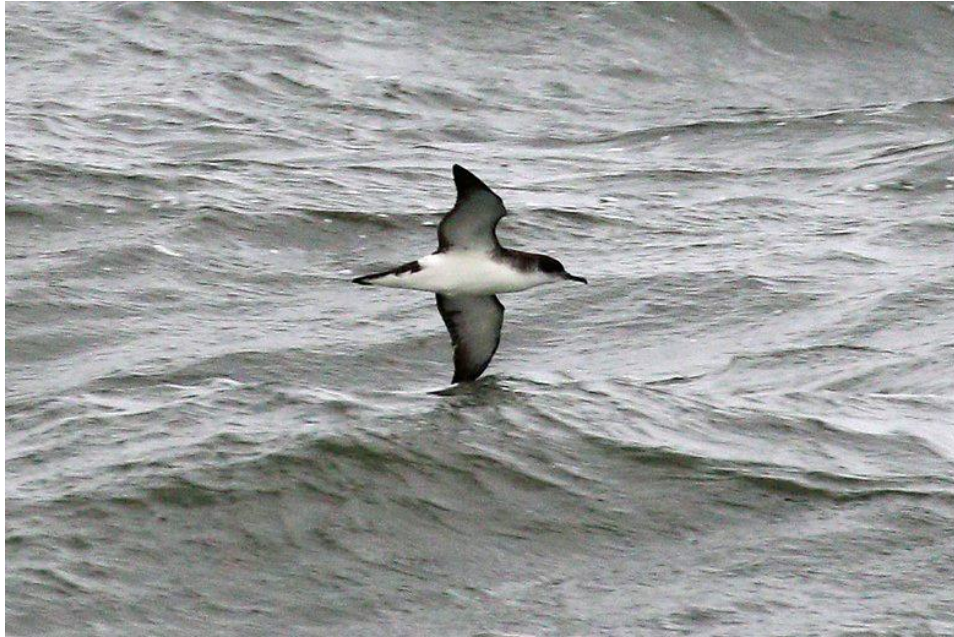
Manx Shearwater off Stevenston Point ( Dougie Edmond )