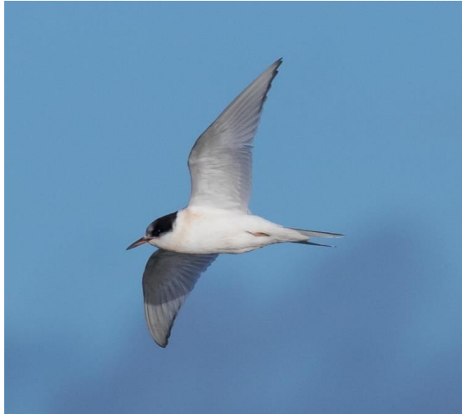
Juv Arctic Tern in November at Maidens ( Dave Grant )

Arrival was from 29 Apr when 1 was at Heads of Ayr, but spring passage was largely unobserved due to Covid restrictions.