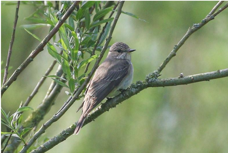
Spotted Flycatcher at Loch Doon ( Dougie Edmond )

In the autumn, the last bird was seen at Auchincross on 30 Aug.