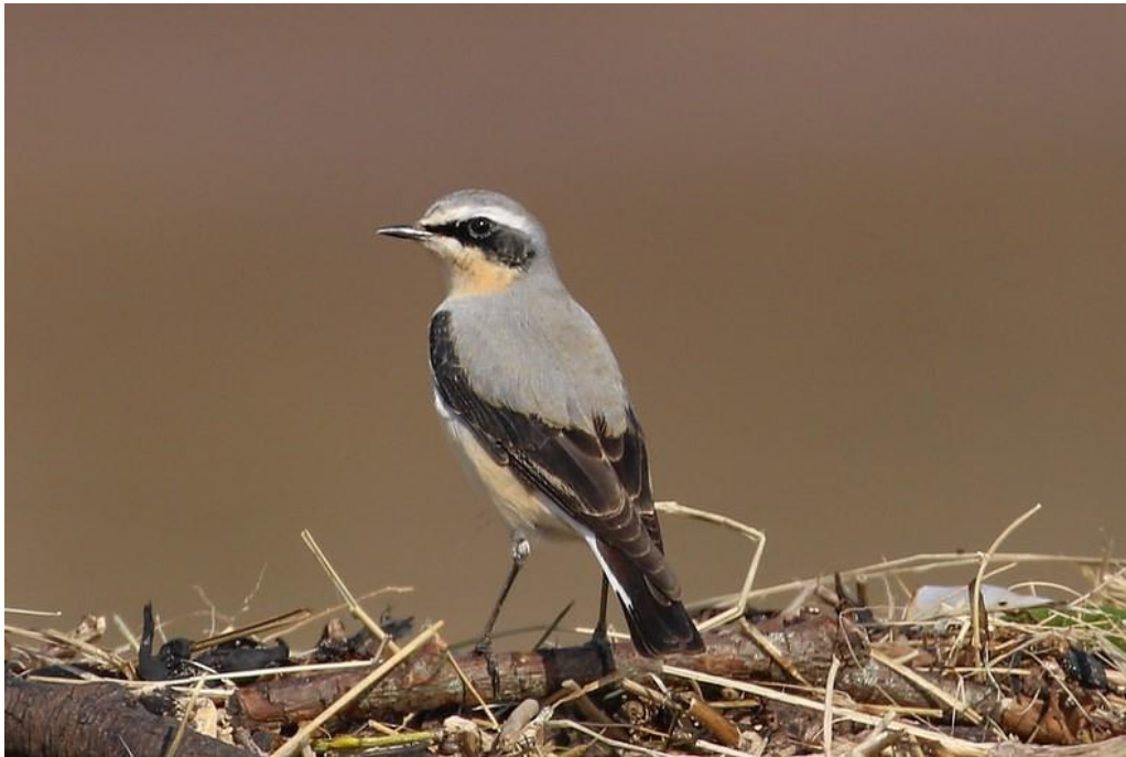
Male Northern Wheatear a Pow Burn ( Dougie Edmond )

4 Auchincross, 6 Carleton Port and 2 Ballantrae 20 Sep, 4 Cronberry 23 Sep, 2 at Auchincross on 4 Oct, and singles at Barassie, Troon and Doonfoot on 6 Oct. The last was a very late individual on Troon south beach from 28 Nov-1 Dec.