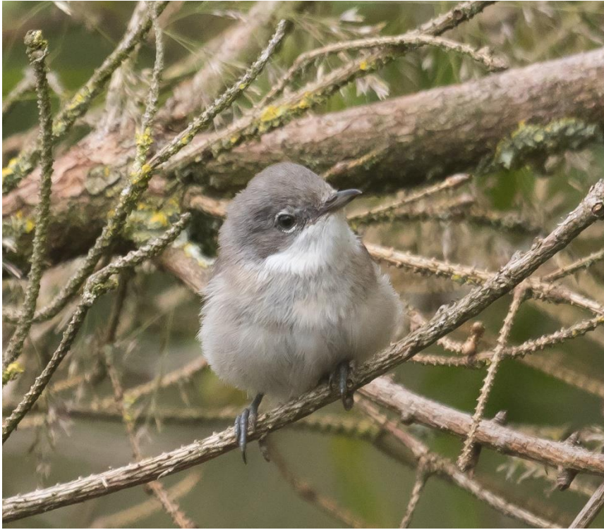
Lesser Whitethroat Trabboch Loch (Dave Grant)