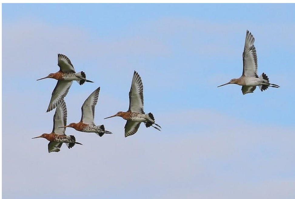
Black-tailed Godwits at Pow Burn ( Dougie Edmond )