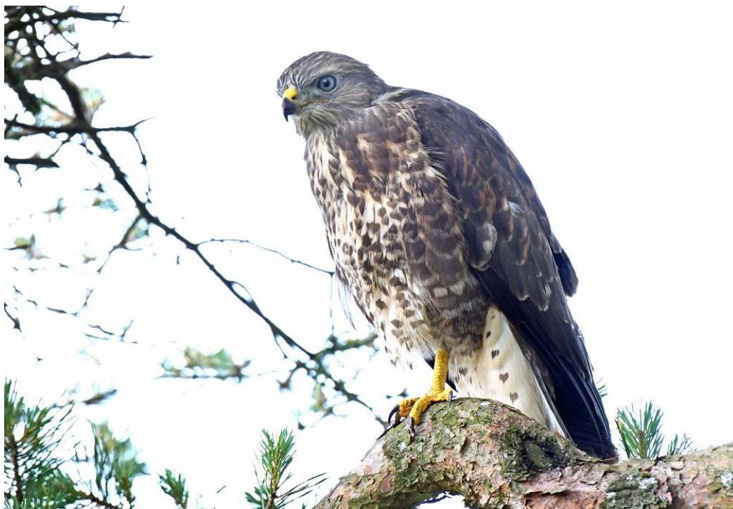
Common Buzzard at Drumlamford ( Angus Hogg )

Migration/counts: 16 Auchincross 10 Jan, 23 Auchincross-Dalgig 7 Feb, 8 on 13 Nov.