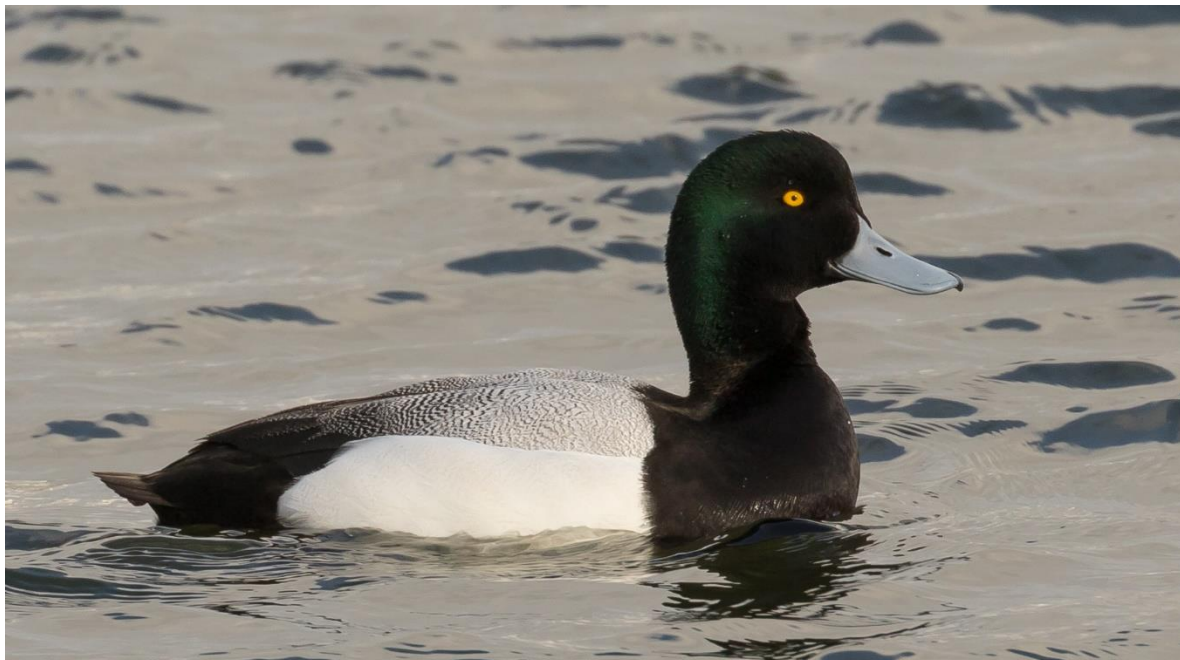
Greater Scaup at Auchenharvie (Dave Grant)