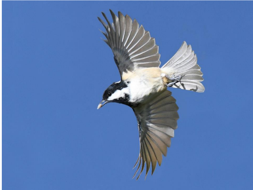
Coal Tit leaving feeder at Crosshill ( Angus Hogg )