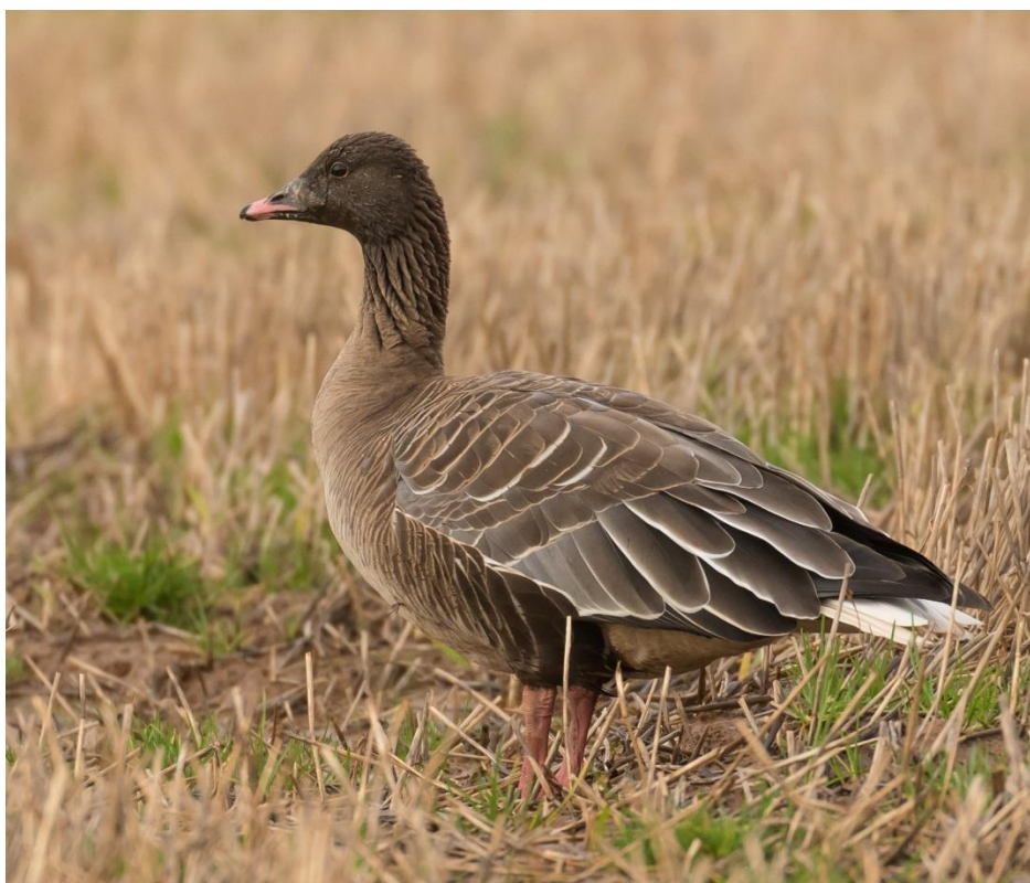
Pink-footed at Martnaham