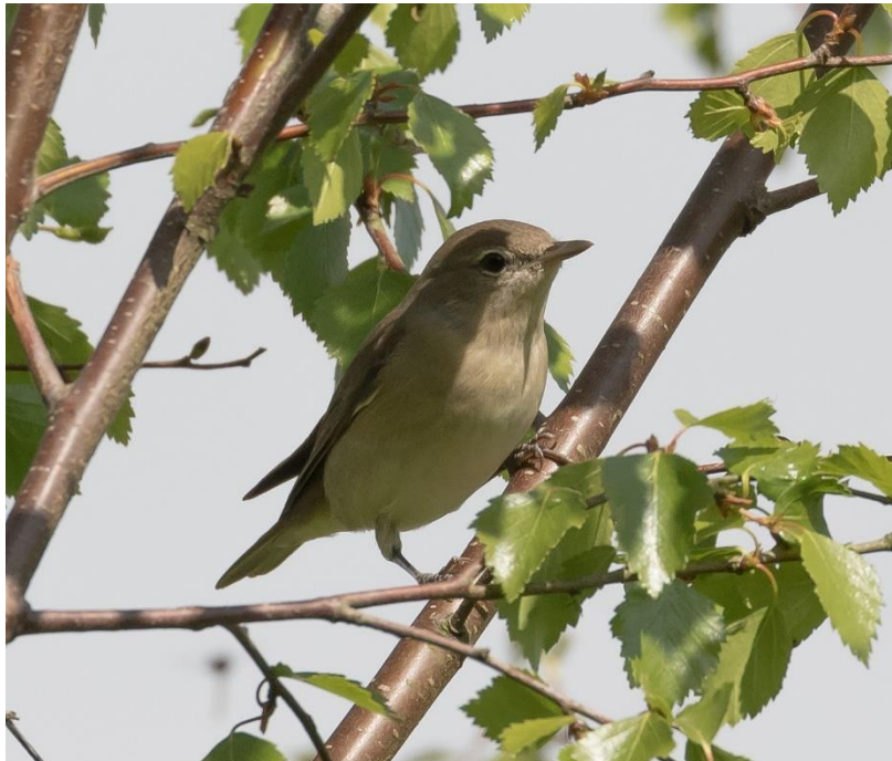
Garden Warbler Martnaham ( Dave Grant )