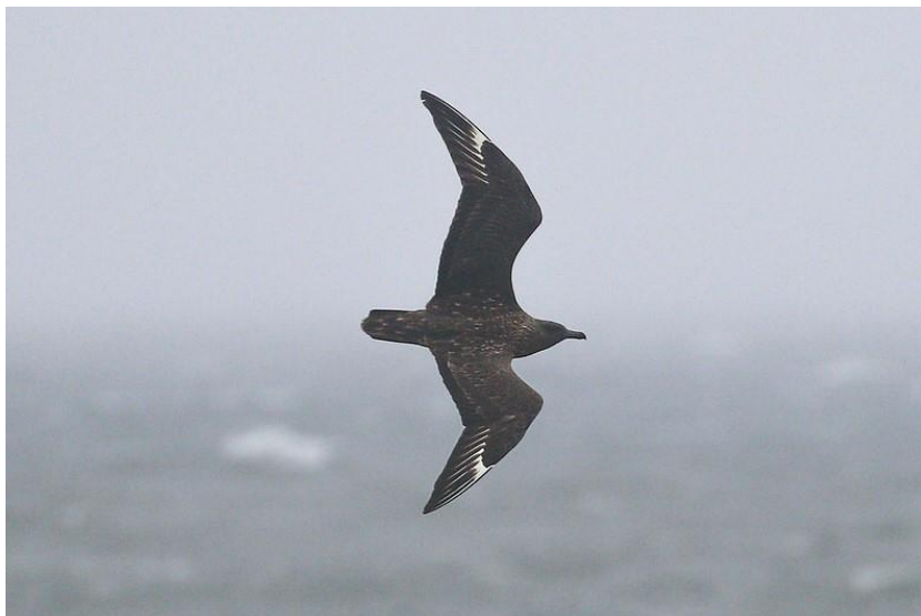
Great Skua at Saltcoats ( Dougie Edmond )