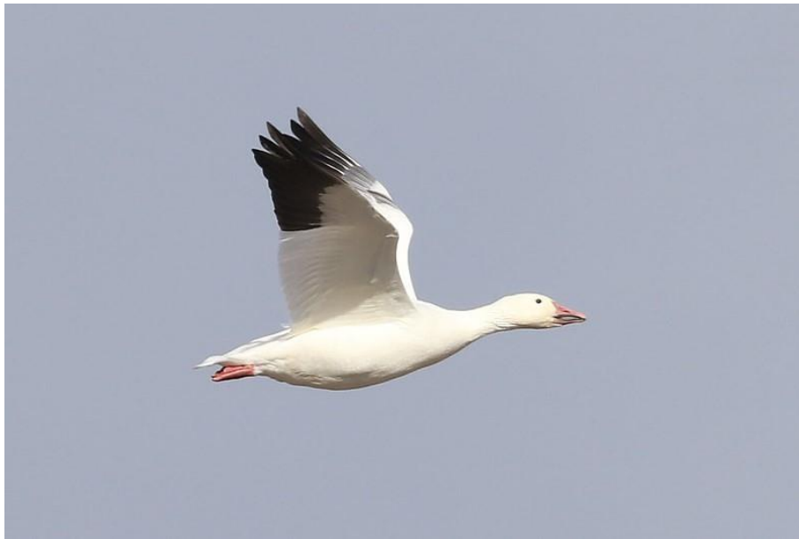
Snow Goose at Auchincross ( Dougie Edmond )

A pale morph adult was in the New Cumnock/Auchincross area on 2 Jan – 16 Mar (M H et al. ).