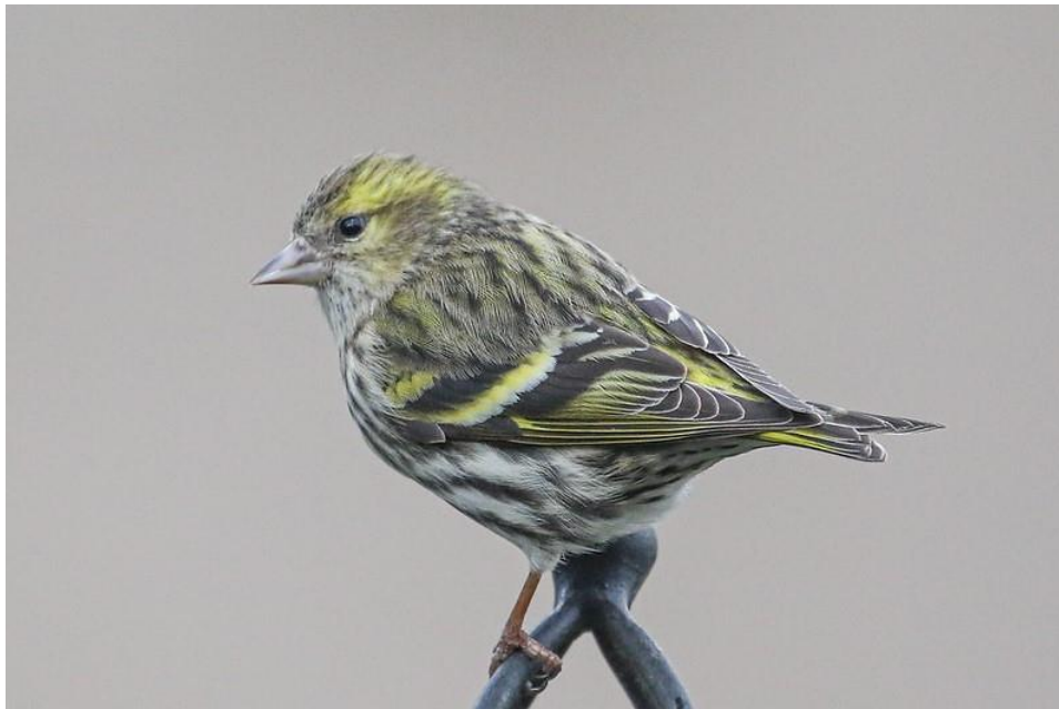
Eurasian Siskin at Kay Park

Counts: 19 Eglinton CP 1 Jan, 40+ Crosshill Kirklea 2 Feb, 40 Shalloch Place Ayr 13 Feb, 70+ Auchincross 15 Jul, 100 Knockshinnoch lagoons 14 Sep, 40 flew S/hr Loch Doon dam.