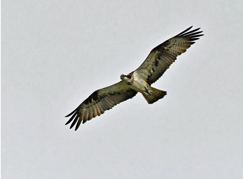
Female Osprey in South Ayrshire ( Angus Hogg )

Autumn birds were noted at Kilbirnie Loch on 27 Jun, Jelliston on 1 Jul, with the last 2 over Ness Glen on 10 Sep.