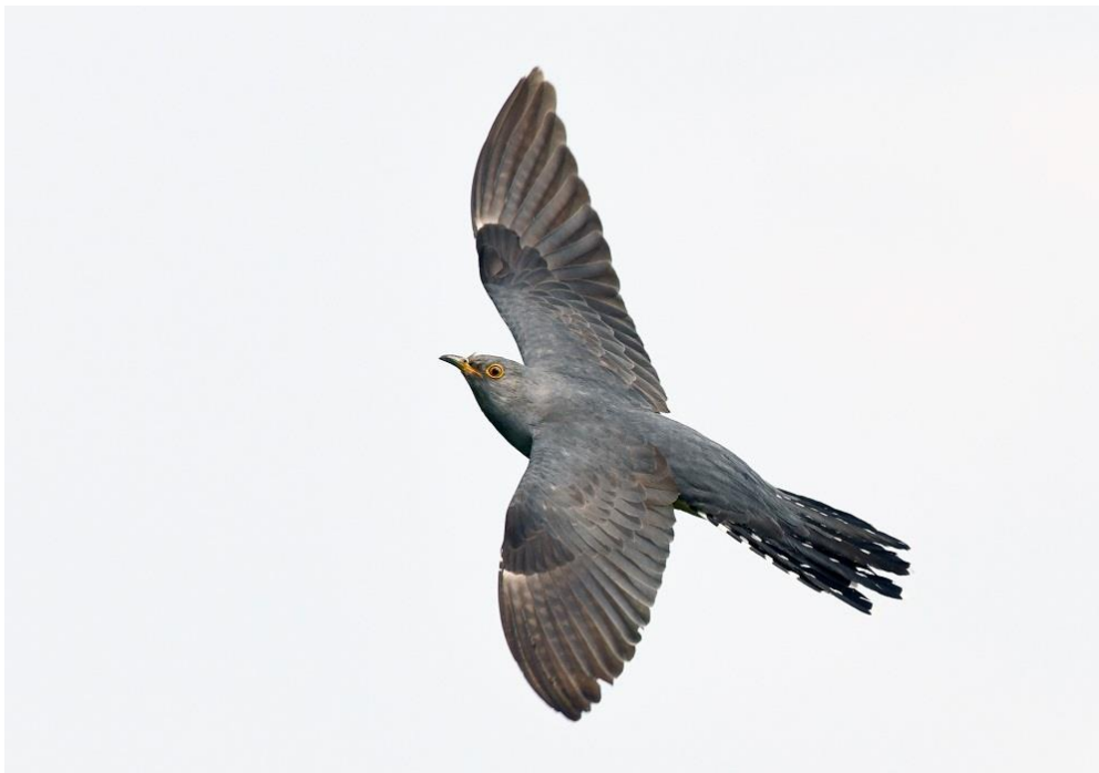
Common Cuckoo at Craigens Kirkoswald (Angus Hogg)

The last departure date was 8 Jul when 1 was at Ochiltree.