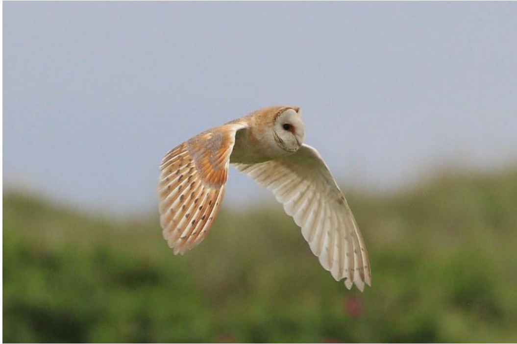
Barn Owl at Pow Burn ( Dougie Edmond )