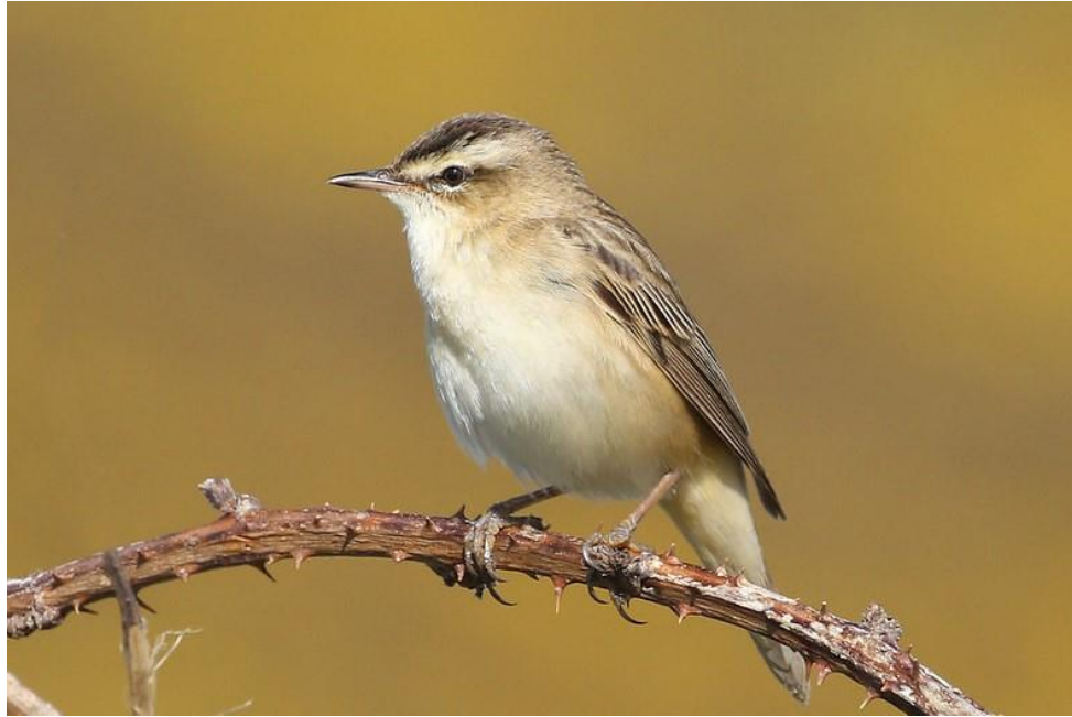
Sedge Warbler at Pow Burn ( Dougie Edmond )