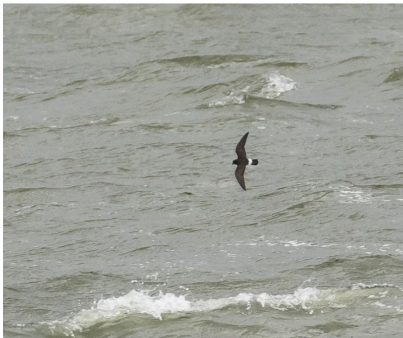
European Storm Petrel Troon (Dave Grant)

An improved showing, with 2 Outer Nebock Rocks Saltcoats on 24 May (TB), 9 flew N Stevenston Point on 29 Jun (TB), and 4 off Troon on 29 Jun (DGr/DC).