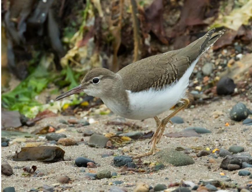
Juvenile Spotted Sandpiper at Rancleugh Burn

A juvenile discovered at the Rancleugh Burn on 16 Oct (HF) remained in the area over the winter, most often observed between there and Segganwell. This is the first record of the species for Ayrshire.