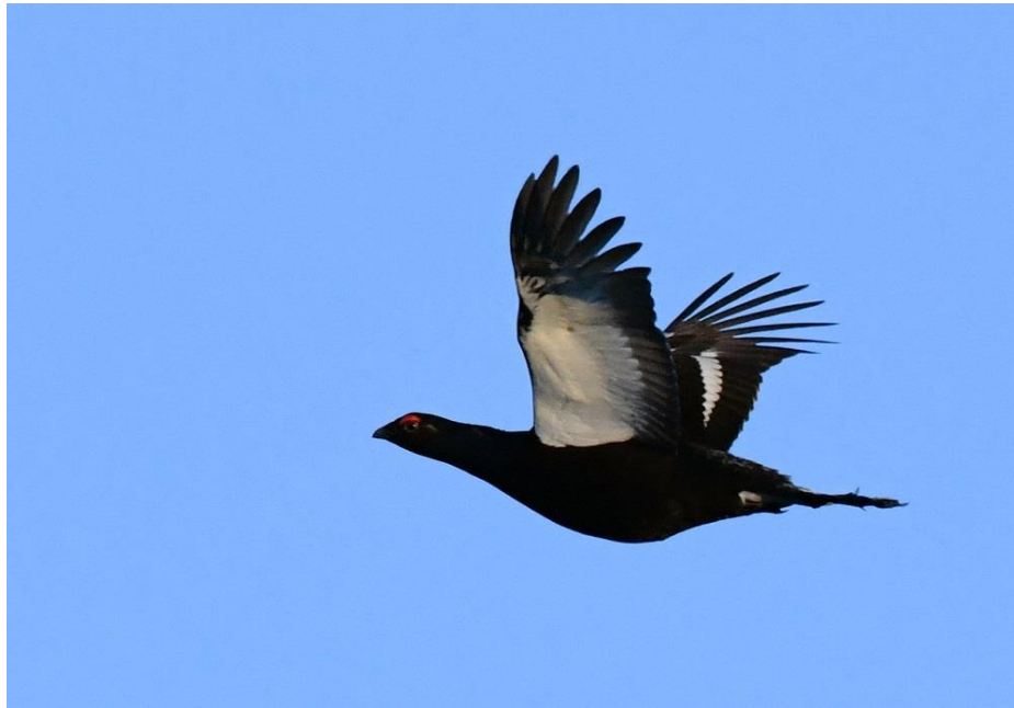
Male Black Grouse in South Ayrshire ( Angus Hogg )

Counts and presence: 2 Airds Moss 23 Dec.