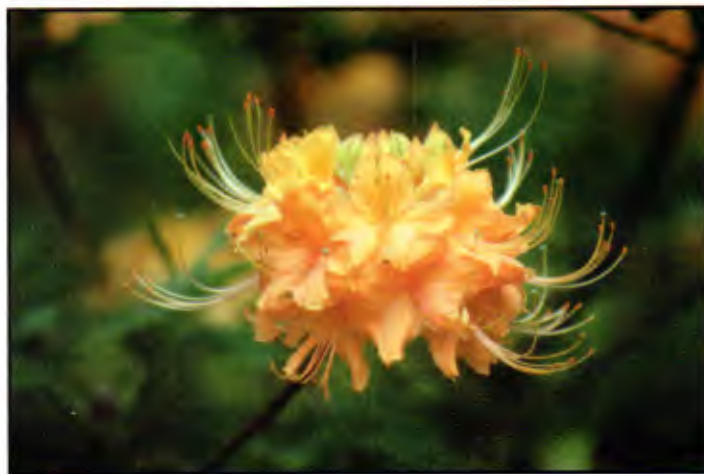
Another example of R. flammeum crossed with an Exbury hybrid. (Photo by Earl Sommerville)

A two-species cross, R. calendulaceum x R. flammeum . (Photo by Earl Sommerville)