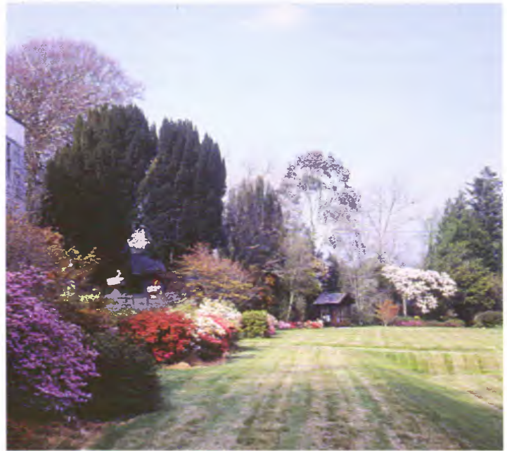
The long terrace at Tremeer provides an ideal sunny location for the colorful “Stevenson’s Collection” of the fifty varieties planted by Roza Stevenson in 1961 (shown in April 2002). The deep red is ‘Hinode-no-kumo’, that Roza rated as a better color than Wilson’s #42, ‘Hinodegiri’ (syn. ‘Red Hussar’).

However they withstood the drastic 1963 winter, when nearly everyone all over the British Isles suffered burst pipes! And many other calamities and upon thinking back, I recollect we had a superb October (Indian