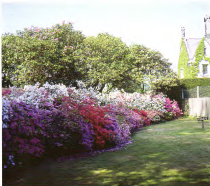
May 1991. Part of the remnants of a “Wilson’s Fifty” collection at Lingholm in the English Lake District. Note how these Kurumes are far more open and leggy when grown in partial shade. A second group can be found on the north end of the terrace, and these are low and compact due to their location in full sun.

The remnants of what appear to be two further sets can be found, one at Lingholm Gardens, near Keswick, Cumbria, and the other at Colonsay House Garden at Kiloran on the Isle of Colonsay. There are probably others, and we will return to this aspect shortly.