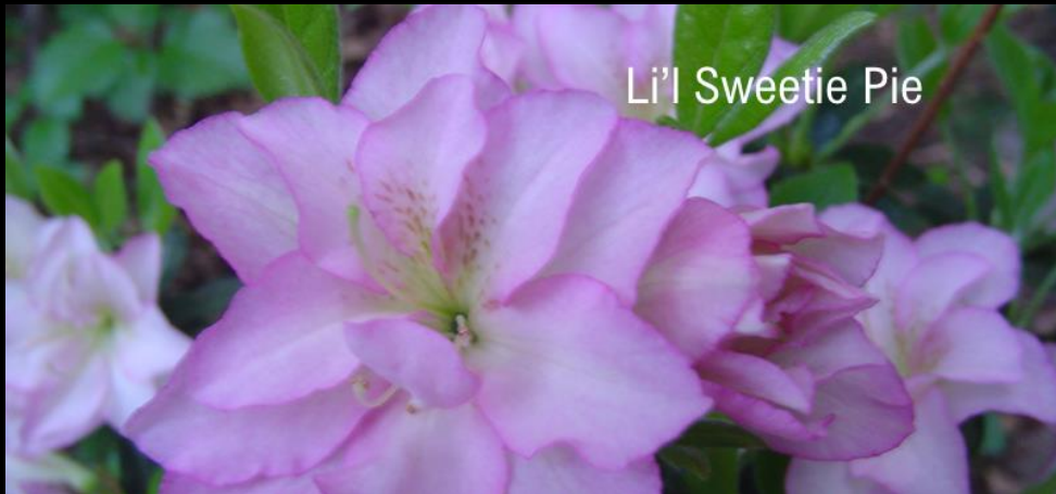
Li'l Sweetie Pie