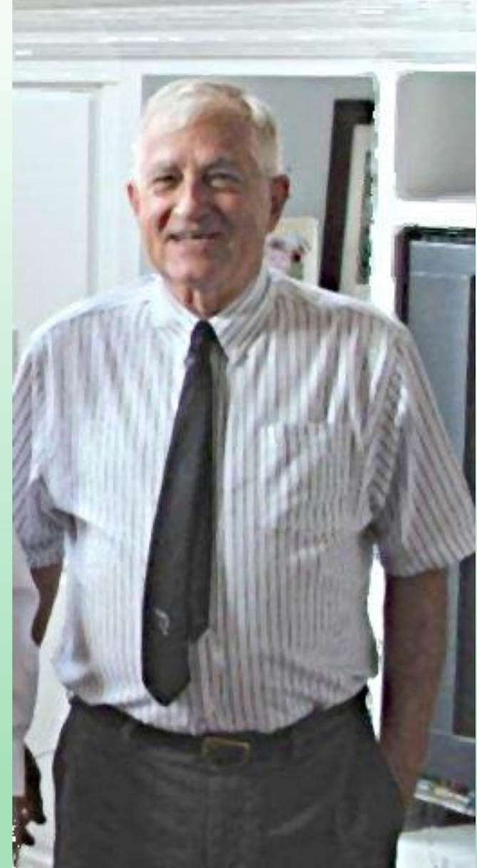
Buck Clagett – photo from March 2015 Azalea Clipper

All photos by Buck Clagett unless otherwise noted.