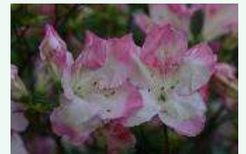
RBS-37 ' Sheri Ann '