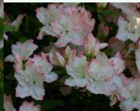
RBS 27 ' Betty Ellen '