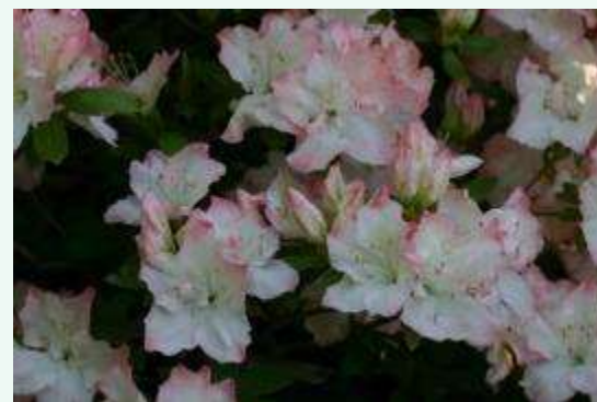
RBS 27 ' Betty Ellen '