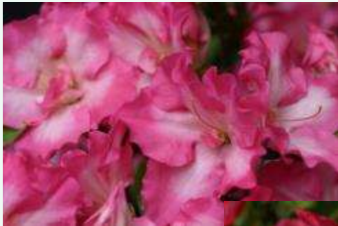
RBS-01 'Ashley Ruth'