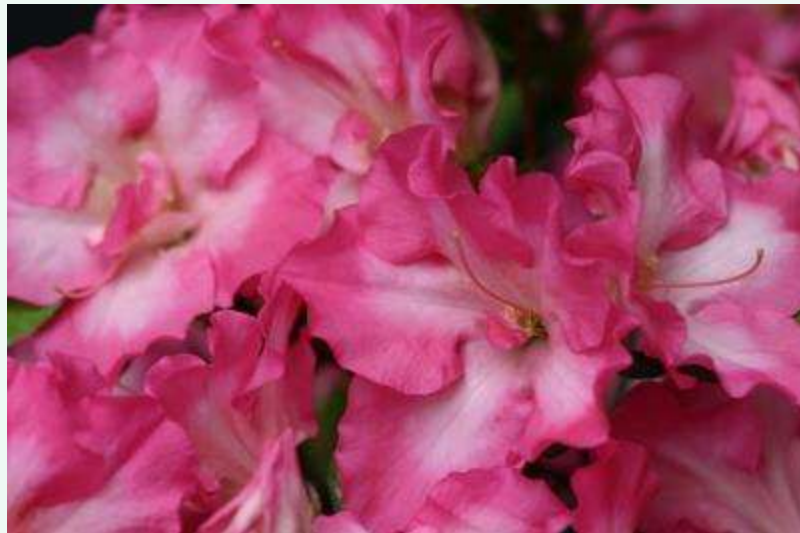
RBS-01 'Ashley Ruth'