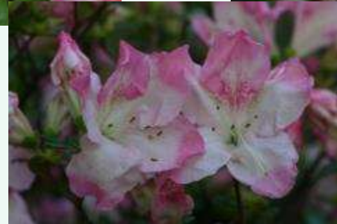
RBS-37 'Sheri Ann'