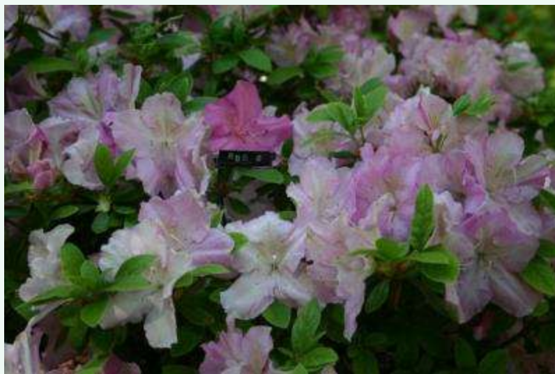
RBS-06 'Sarah Jessica'