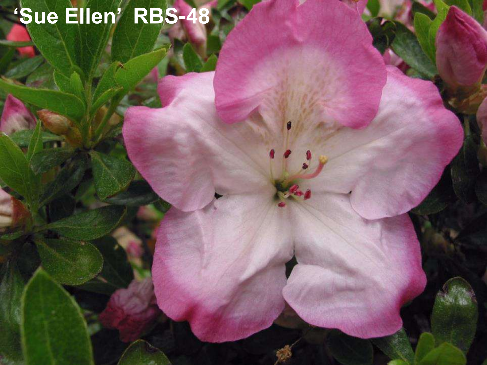
'Sue Ellen' RBS-48