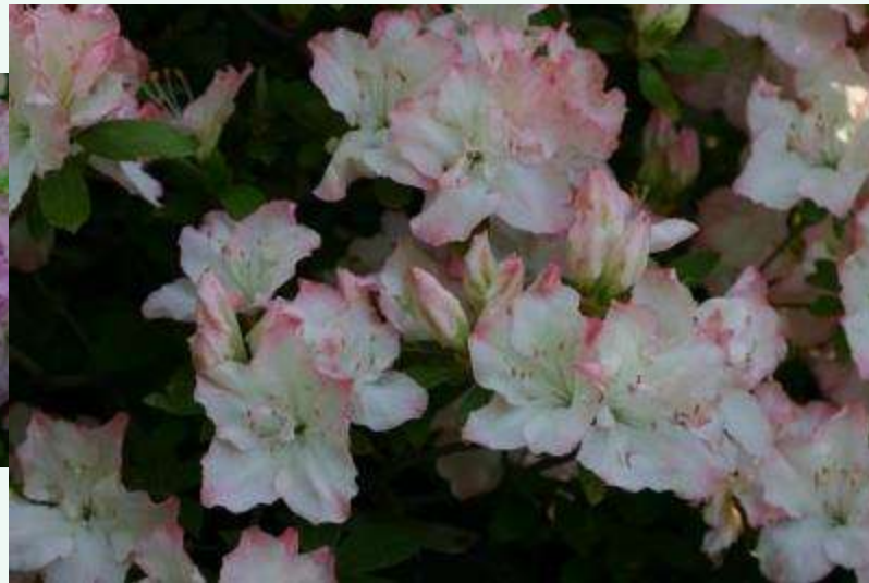
RBS 27 ' Betty Ellen '