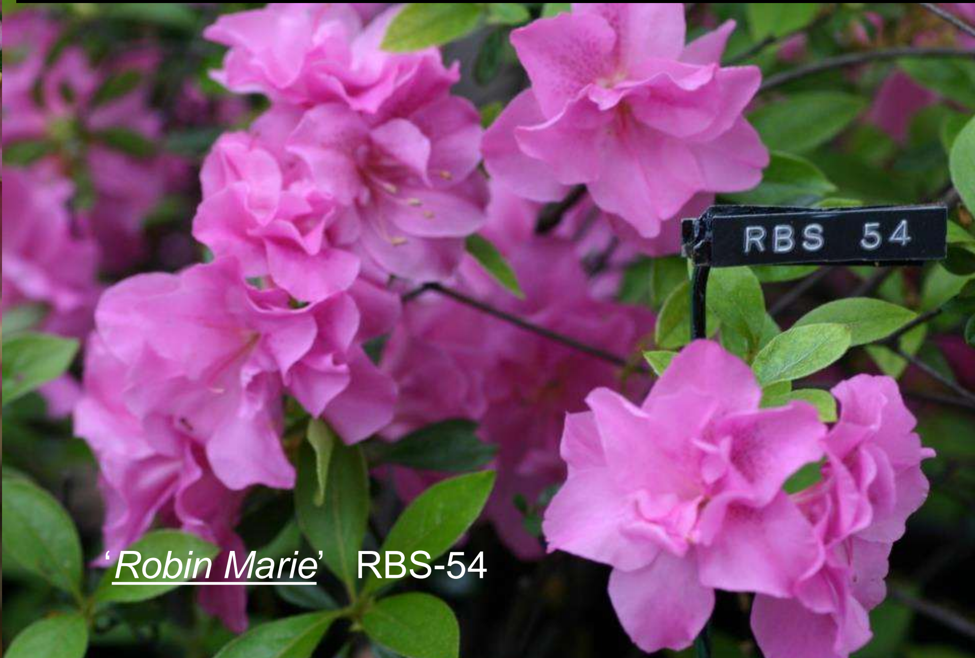
'Robin Marie' RBS-54