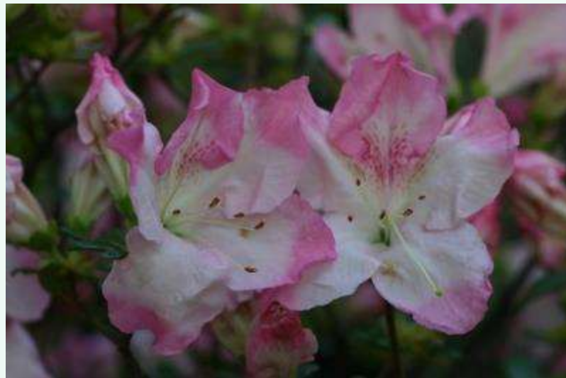
RBS-37 ' Sheri Ann '