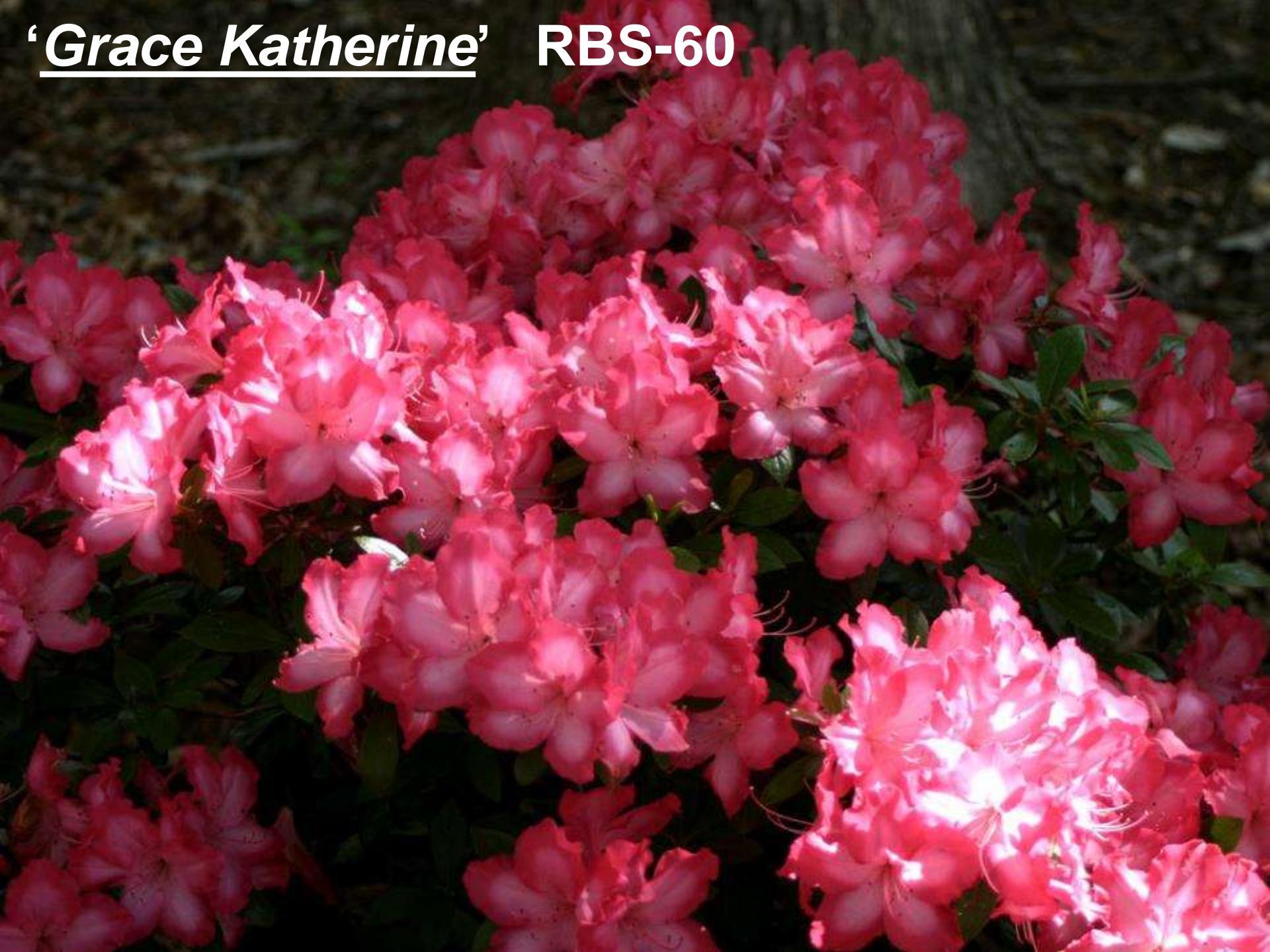
'Grace Katherine' RBS-60