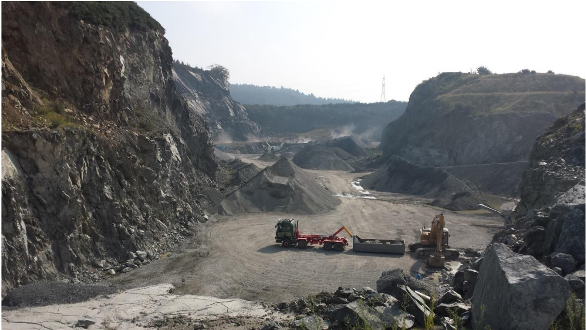
Plate 12-5 View of Area 2 looking north-east