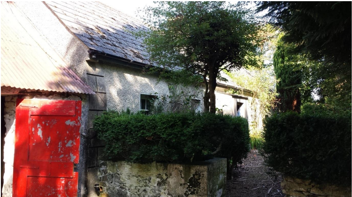
Plate 12-2 View of Structure 2 looking north