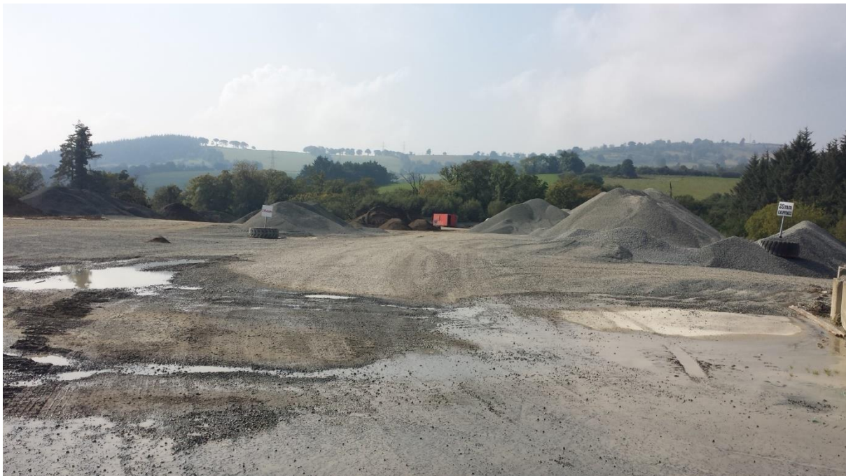
Plate 12-4 View of Area 1 looking east