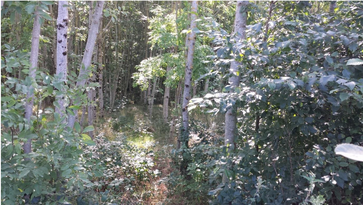
Plate 12-13 View of Area 10 looking south-west