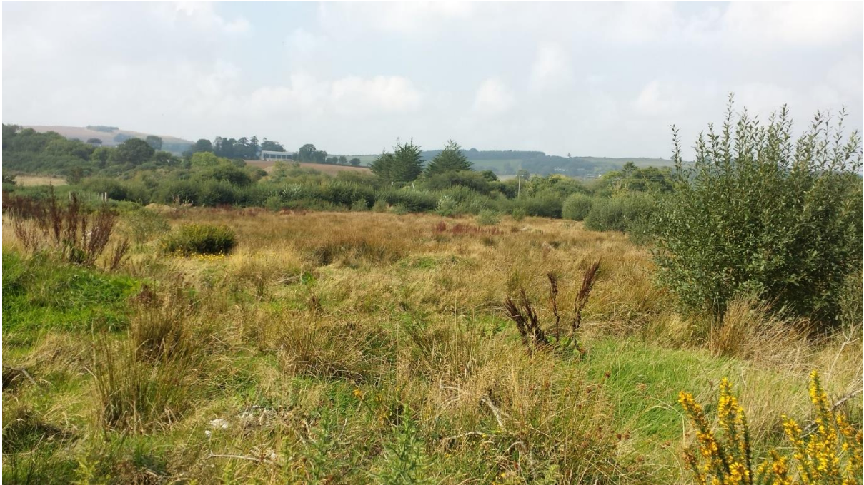
Plate 12-9 View of Area 6 looking west