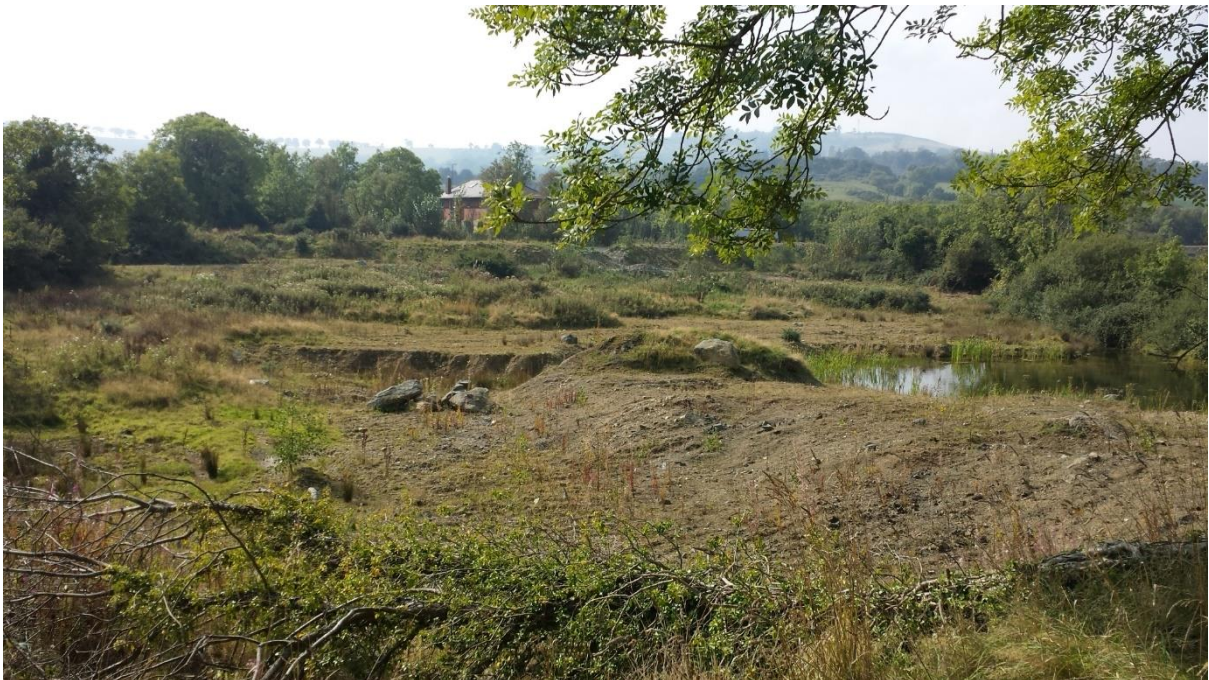
Plate 12-8 View of Area 5 looking south-west