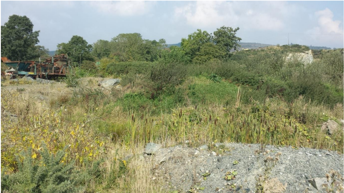
Plate 12-7 View of Area 4 looking north-west