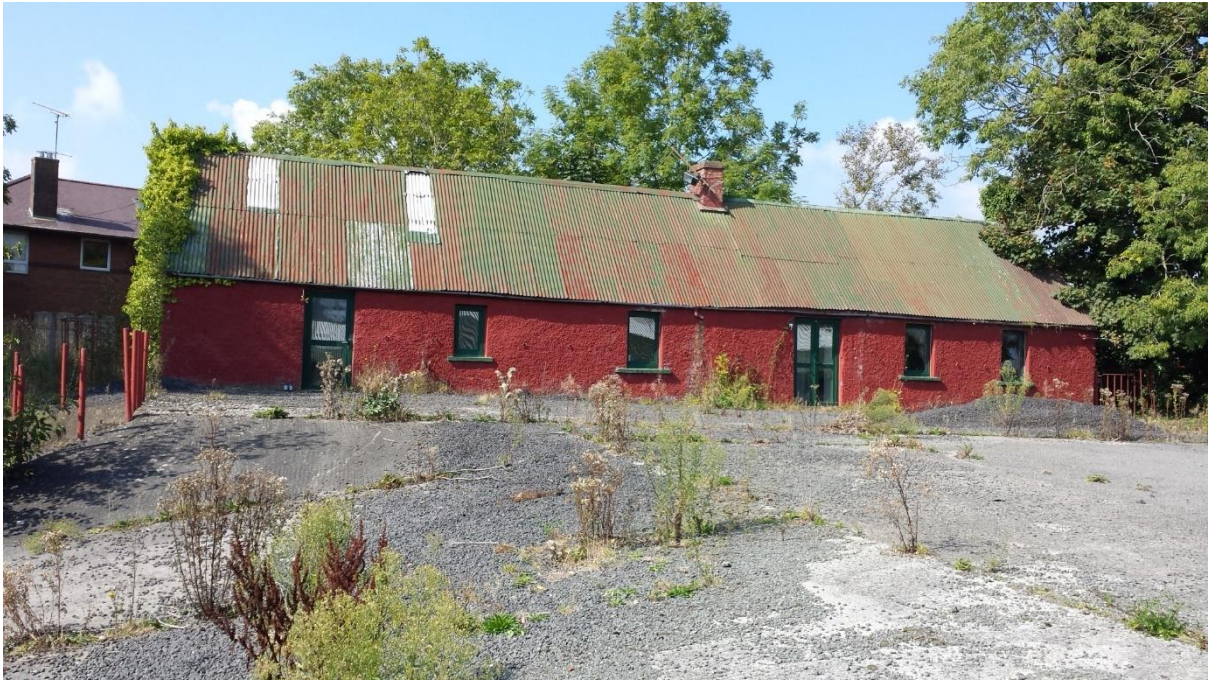
Plate 12-1 View of Structure 1 looking west.