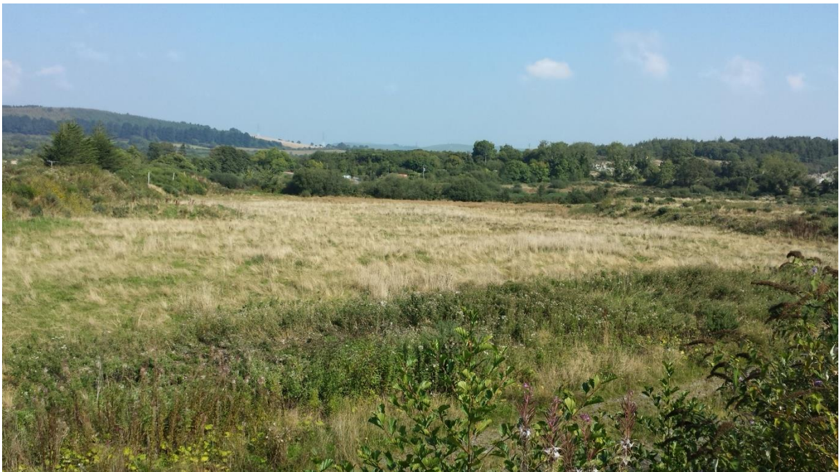
Plate 12-12 View of Area 9 looking north-east