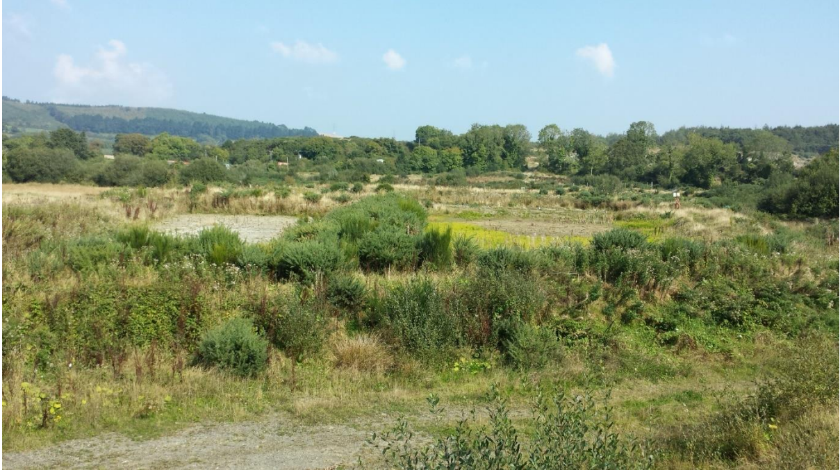
Plate 12-11 View of Area 8 looking north-east