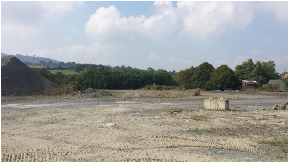
Plate 12-6 View of Area 3 looking south-west