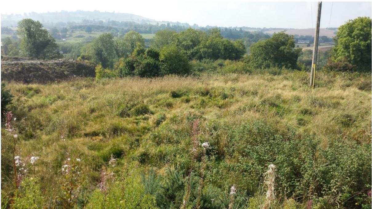
Plate 12-10 View of Area 7 looking west