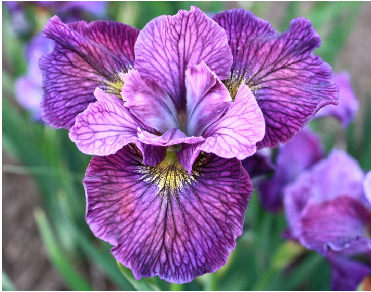
(above): Doreen Cambray (Hollingworth, 2007) Siberian