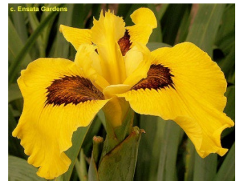
Changing Shadows (Norvell 2015) Contraband Girl Gerald Darby (Darby by Coe 1967) Get the Net (Jill Copeland 2019)