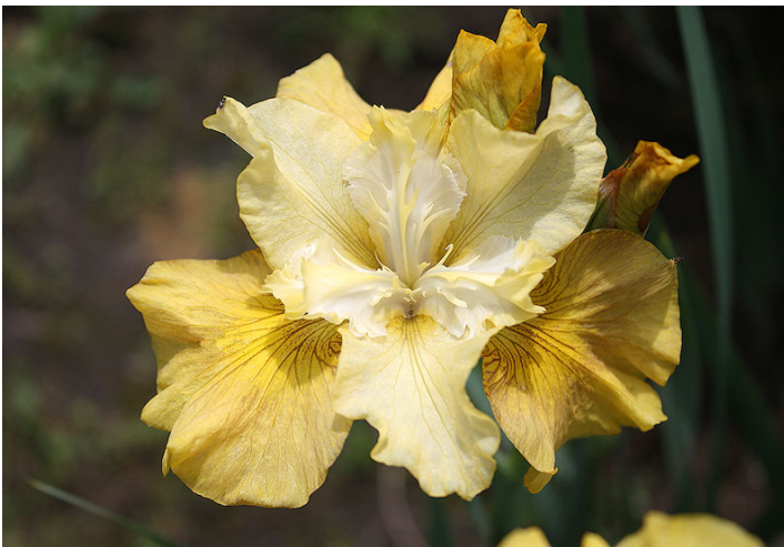
Wish Me Luck (Schafer/Sacks 2016) SIB photo by Ensata Gardens