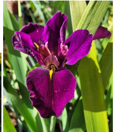
Ally Oops (Borglum 2002) Blue Splatter (Rudkin 2009) Brazos Moon (H. Nichols 2016) Cajun Serenade (H. Nichols 2008)