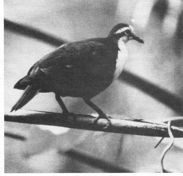
Caroline Islands Ground-Dove. Pohnpei. June 1983. Photo by P. Pyle