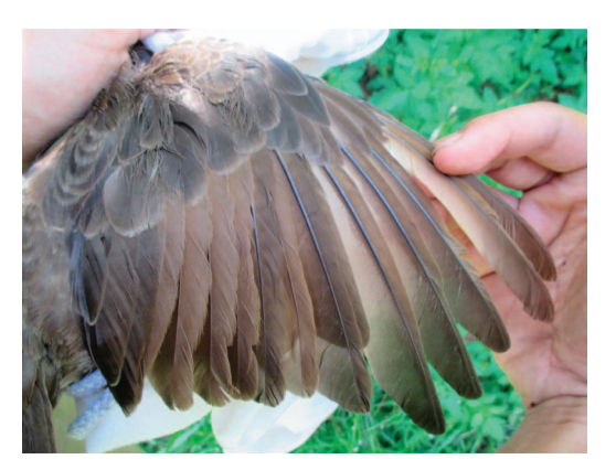
FIG. 7. Samoan Starling (band # 84423051 captured 27 Feb 2015) with growing p2 and p7 (symmetrically on both wings) and showing molt patterns among primaries and secondaries indicating staffelmauser or stepwise molt. Together with other Samoan Starlings as well as Wattled Honeyeaters that have begun prebasic molts with retained inner secondaries (e.g., s5 and s6; see Fig. 6, Table 2L), this suggests that staffelmauser in non-passerines and suspension for molt in passerines may share a common underlying mechanism.

One SAB female and one SAB male showed evidence that retained s5 and/or s6 from one molt could be among the first feathers replaced during the subsequent molt, as noted for Wattled Honeyeater (see Table 2L; Fig. 6), and one DPB female was captured undergoing staffelmauser-like replacement