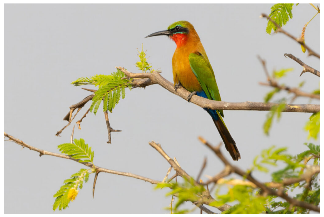
Red-throated Bee-eater