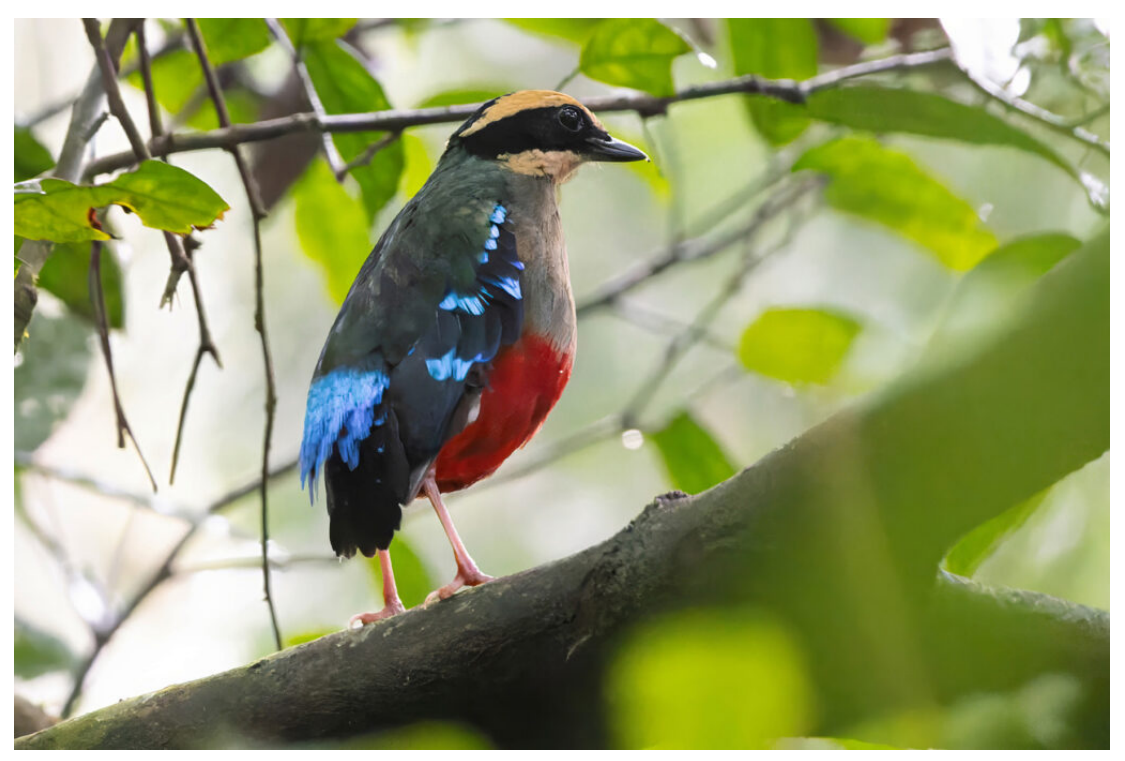
Green-breasted Pitta