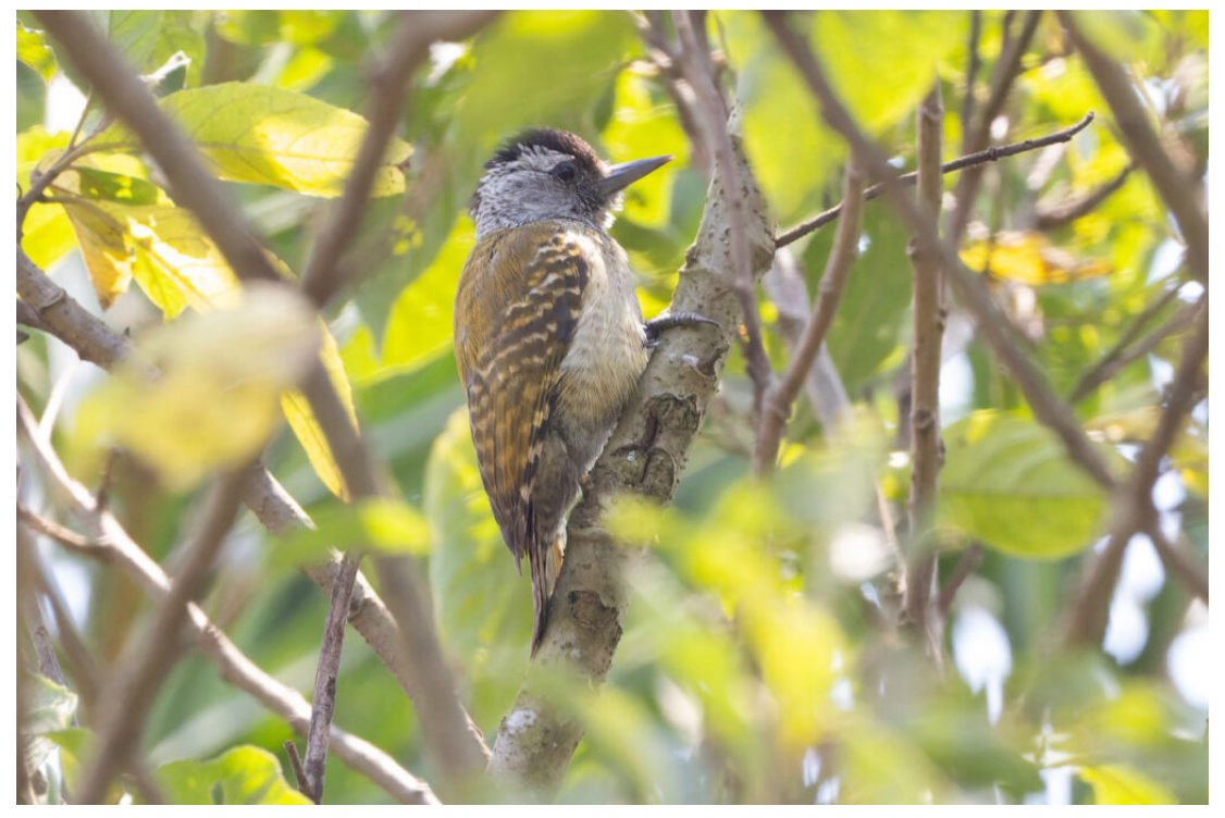
Speckle-breasted Woodpecker