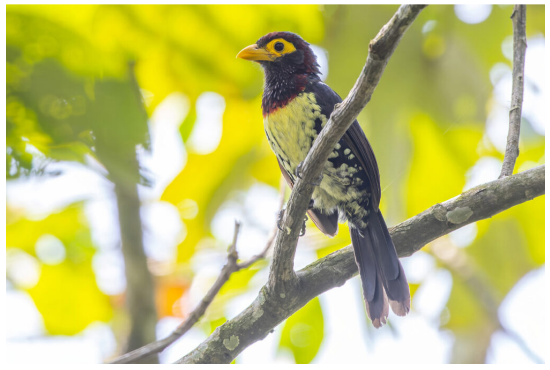
Eastern Yellow-billed Barbet