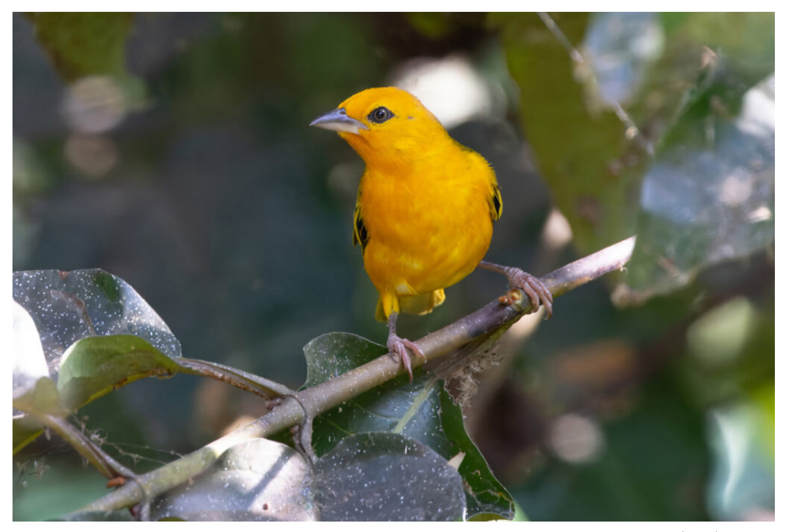
Orange Weaver