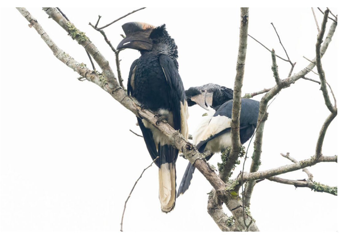
Black-and-white-casqued Hornbill