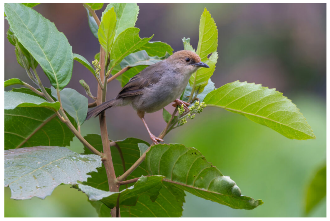
Chubb's Cisticola