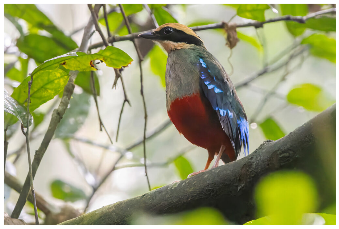
Green-breasted Pitta