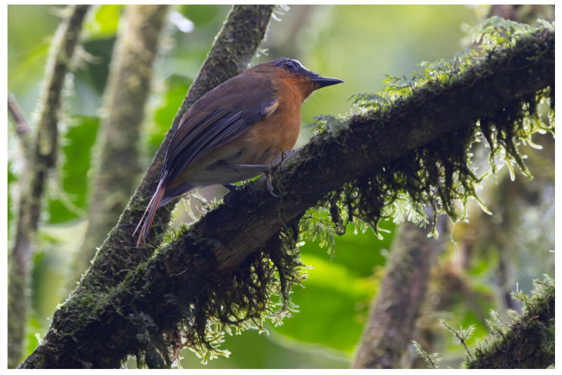
White-bellied Robin-Chat