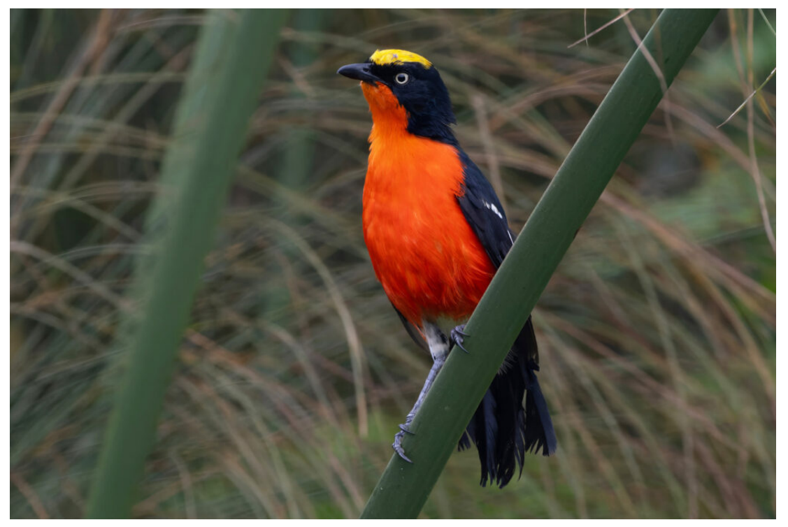
Papyrus Gonolek