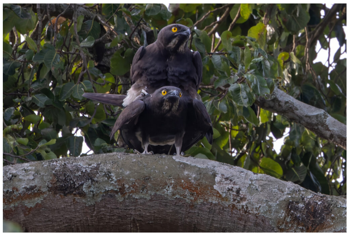
Bat Hawk