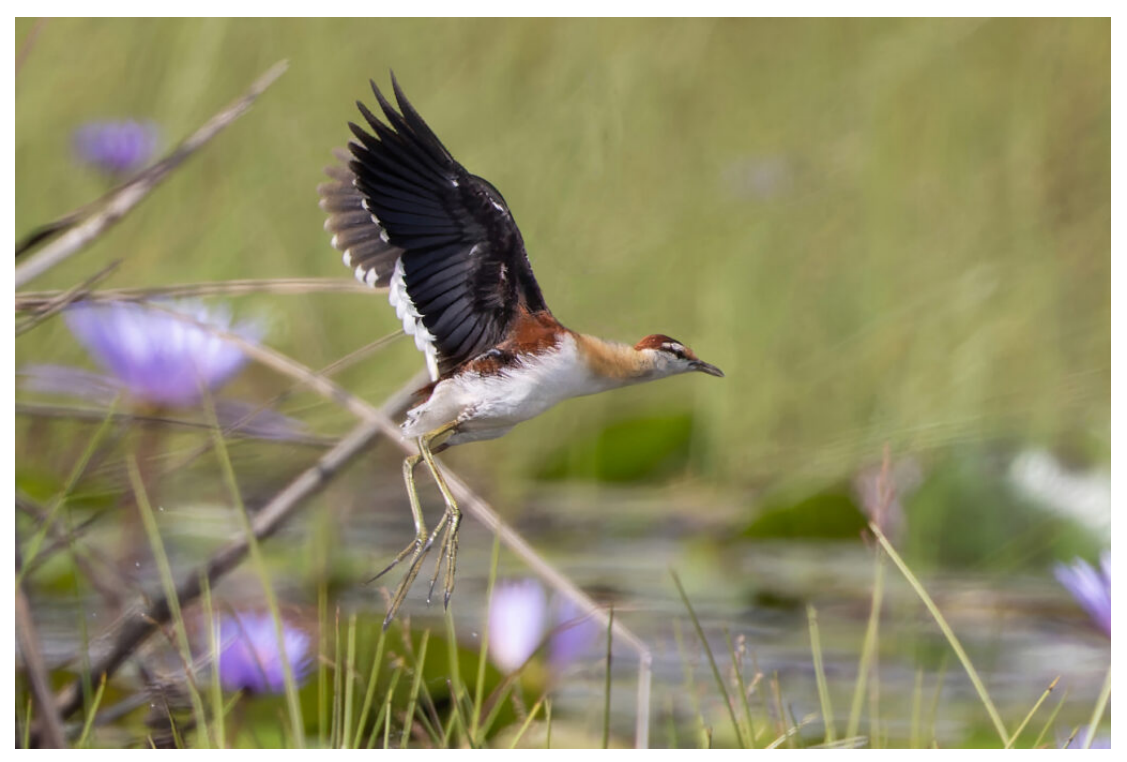
Lesser Jacana