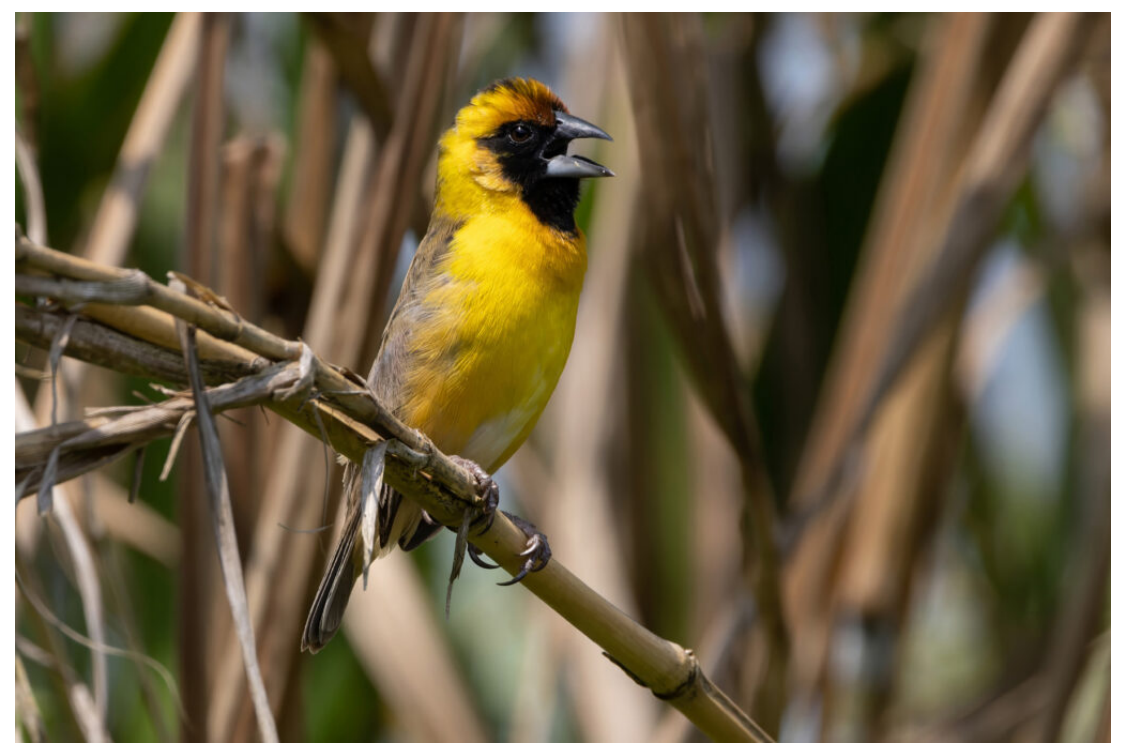
Compact Weaver (image by Nik Borrow)