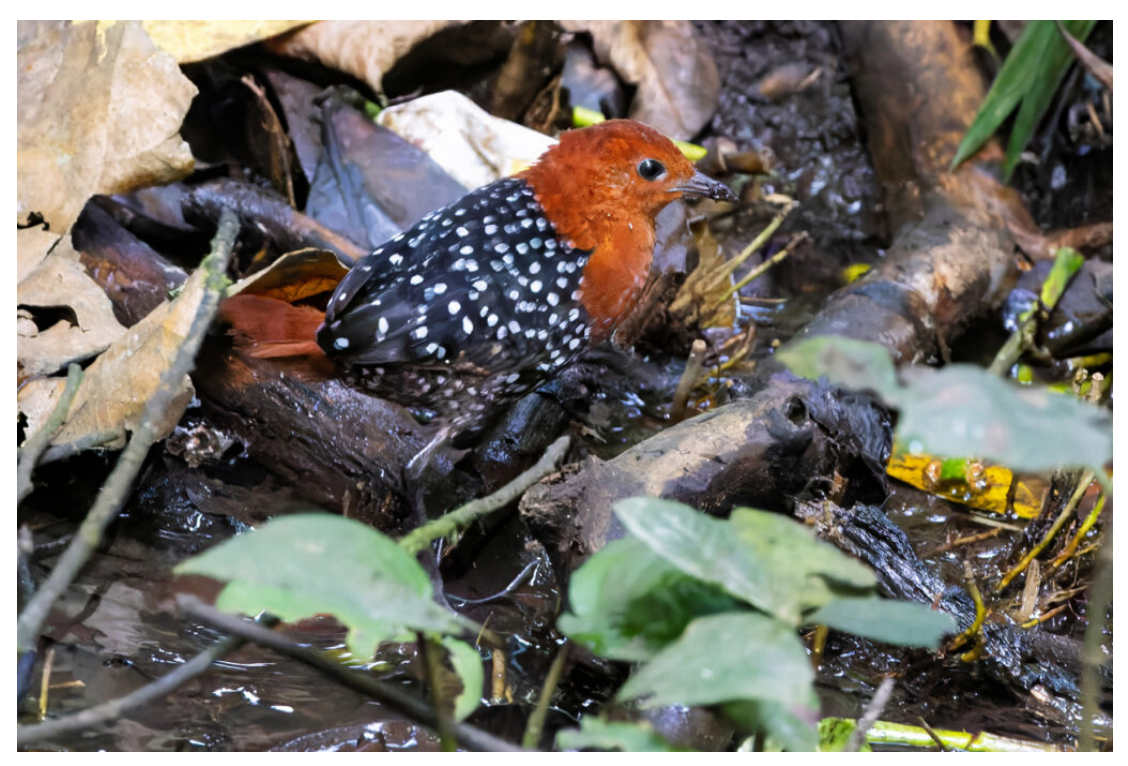
White-spotted Flufftail