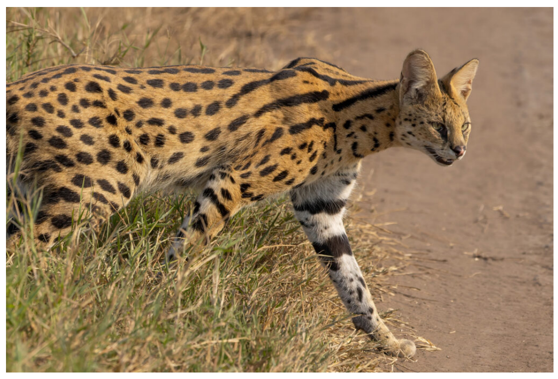
Serval (image by Nik Borrow)