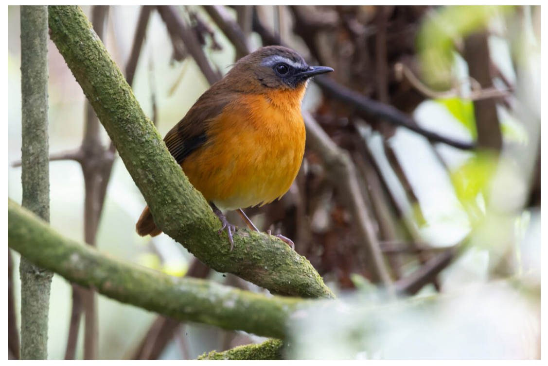
Archer's Ground Robin