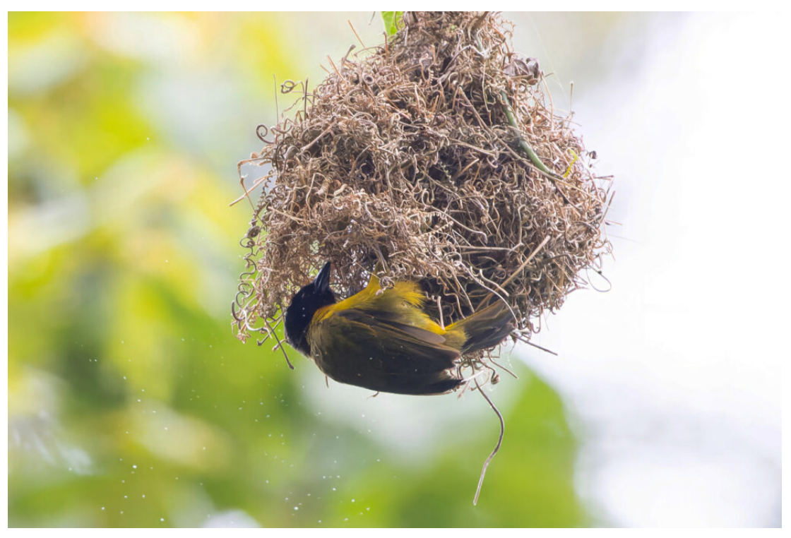
Strange Weaver