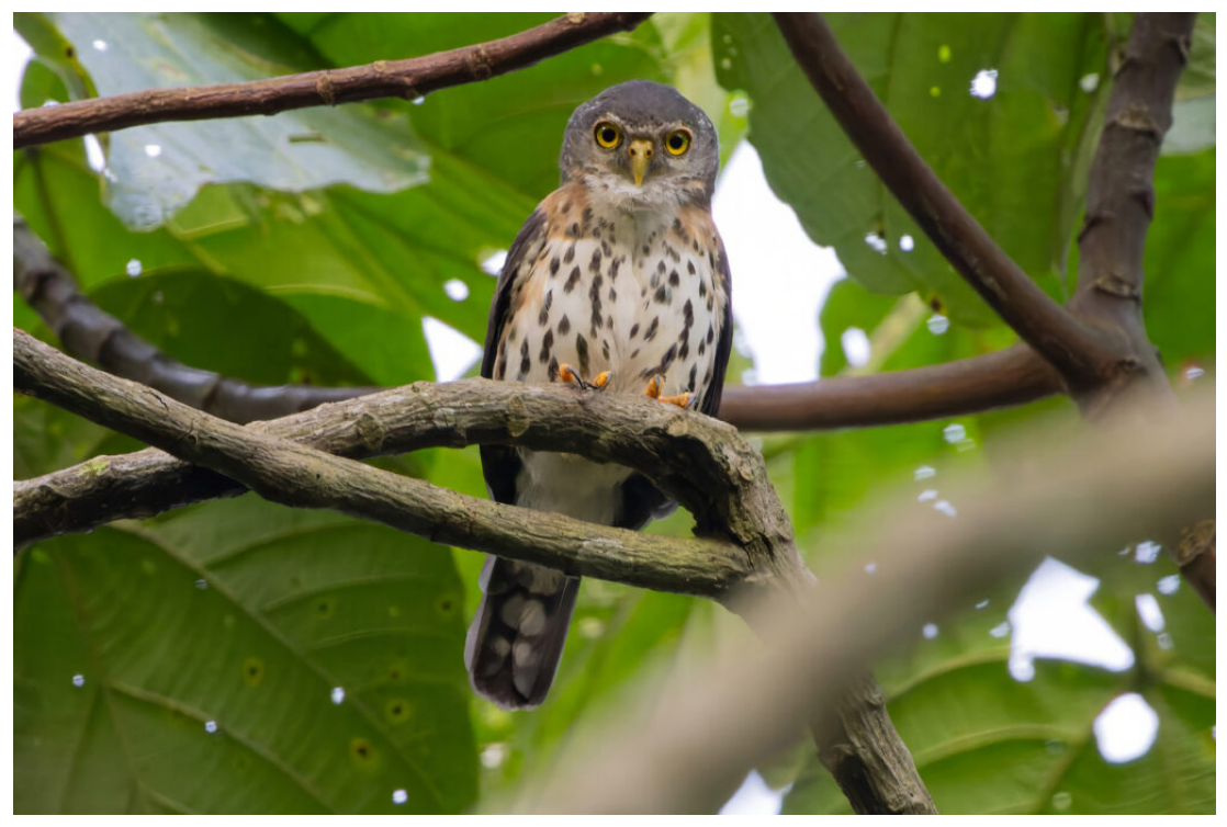
Red-chested Owl