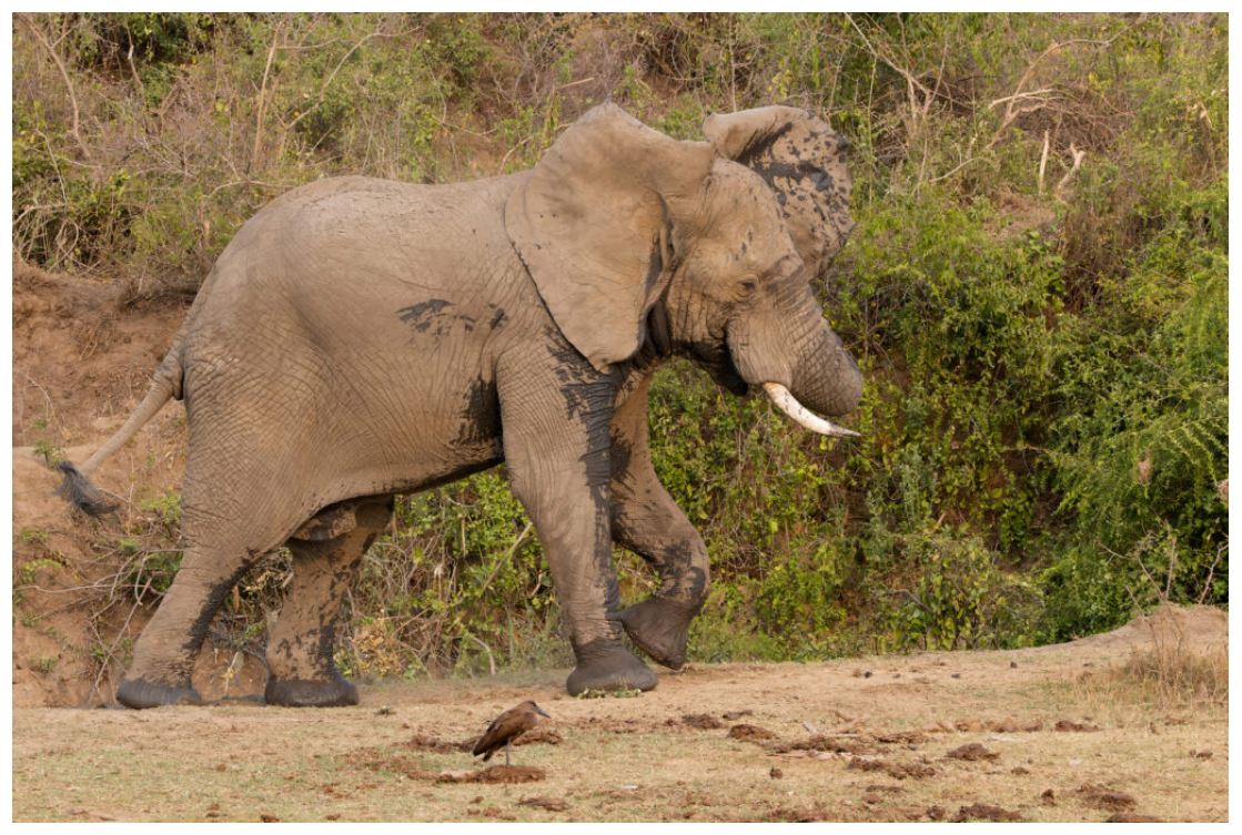
African Elephant