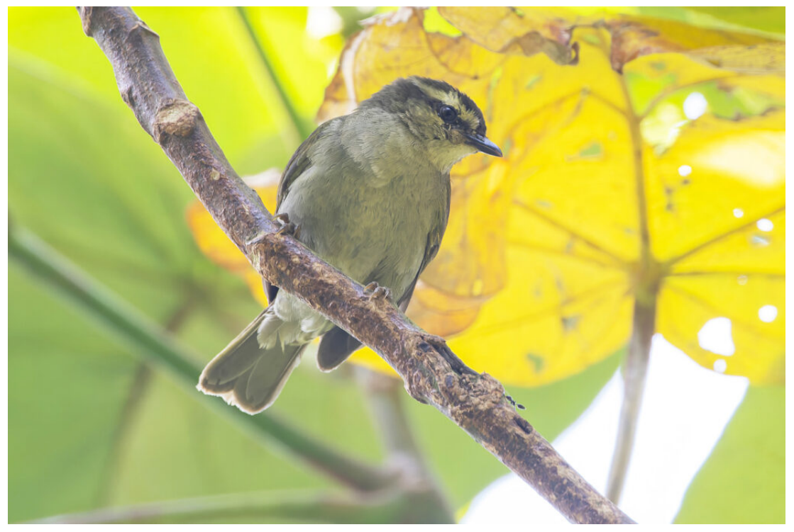
Green Hyla