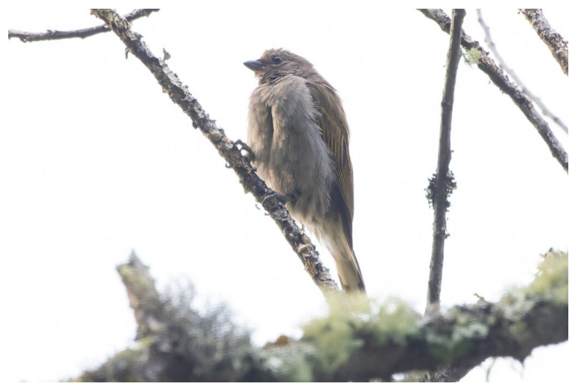
Dwarf Honeyguide