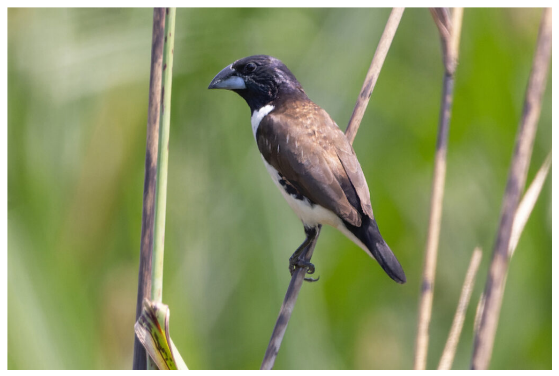
Magpie Mannikin