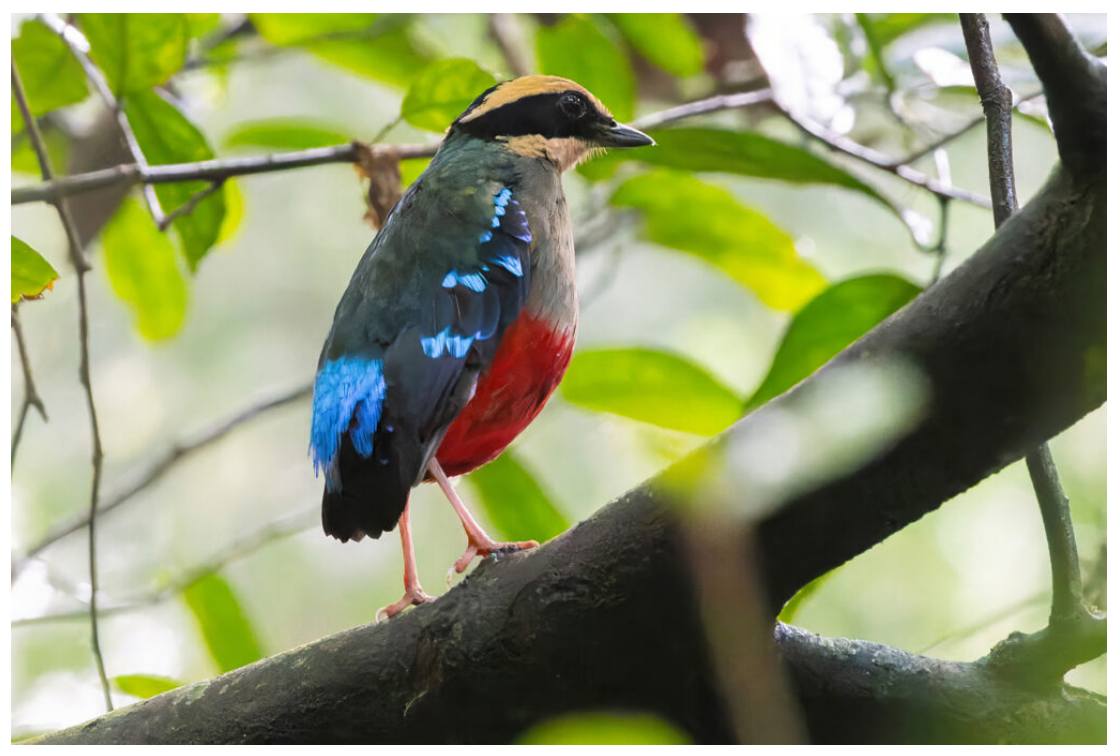
Green-breasted Pitta