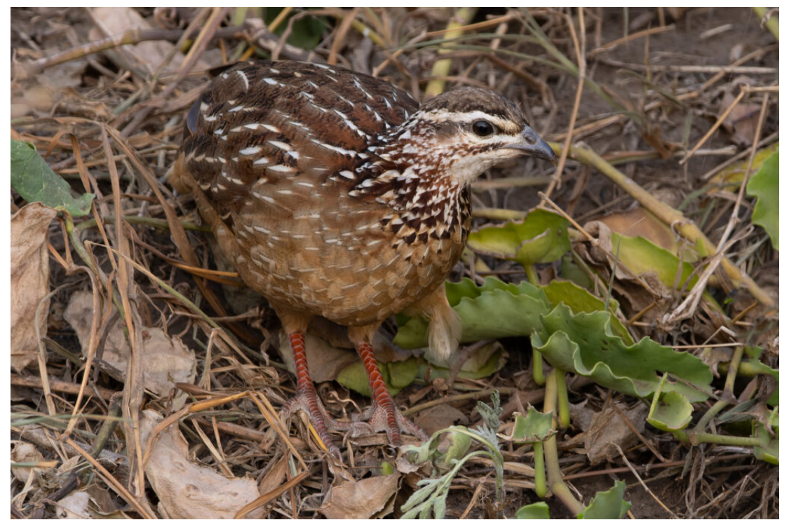
Crested Francolin