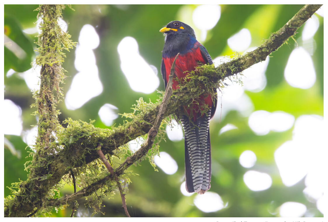
Bar-tailed Trogon