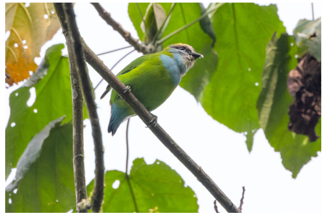
Grauer's Broadbill