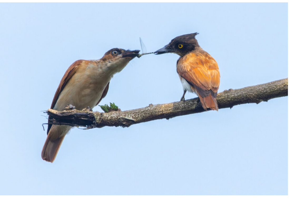
Black-and-white Shrike-flycatcher