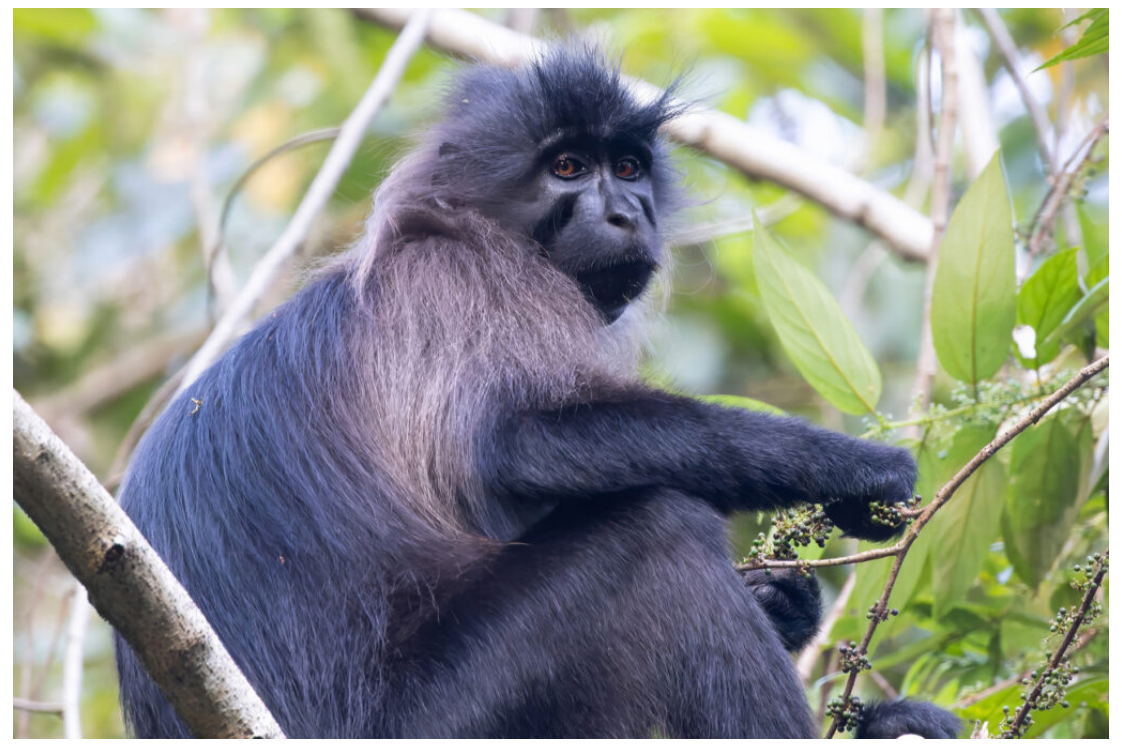
Grey-cheeked Mangabey