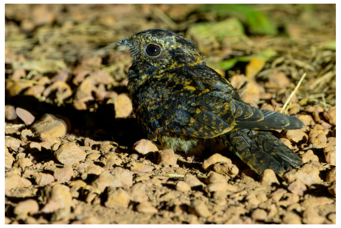
Rwenzori Montane Nightjar