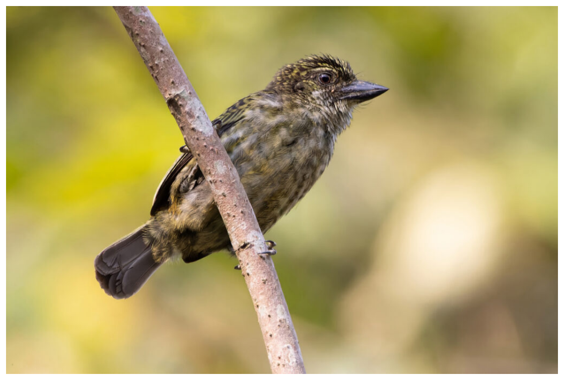
Speckled Tinkerbird