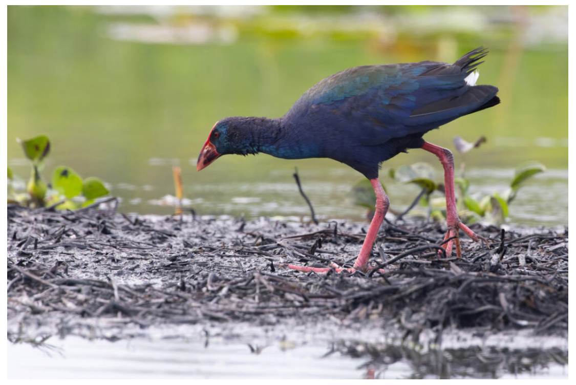
African Swamphen