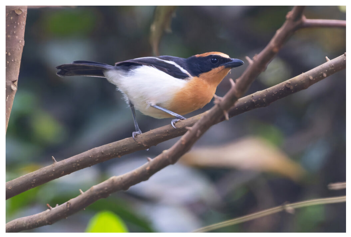
Luhder's Bushshrike