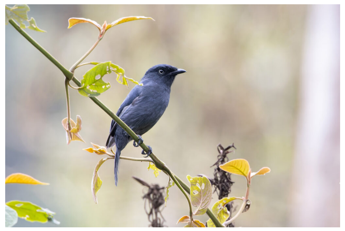
Yellow-eyed Black Flycatcher