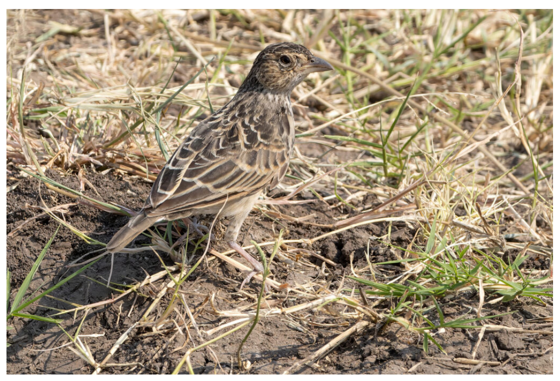
White-tailed Lark