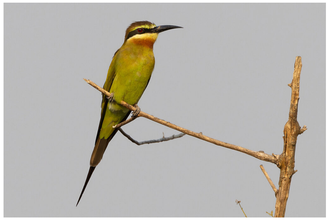
Olive Bee-eater