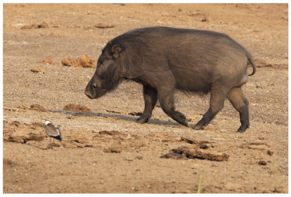
Giant Forest Hog