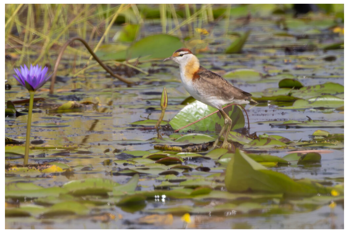
Lesser Jacana