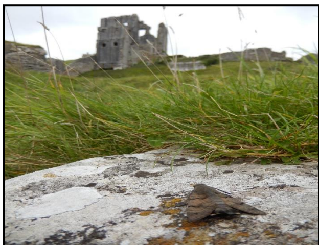
Moth trapping at Corfe