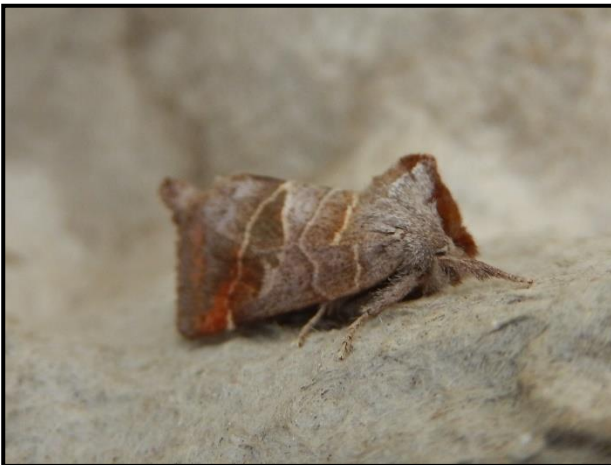
Small Chocolate Tip