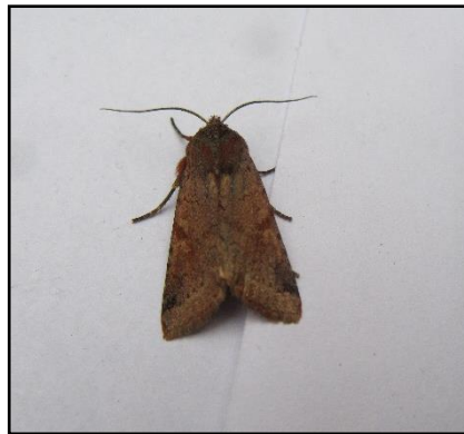
Southern Chestnut Goathorn 3 rd October

The species is classified as RDB 2, following discovery in the UK in Sussex in 1990. It has become well-known on heaths on the north side of the harbour and is known to be spreading. Following the first record it was found quite easily on Holton Lee on 2 occasions (1 and 3 specimens), again on Goathorn on (3 on 12 th October), and on Slepe Heath (3 on 14 th October). Unfortunately, the 2 attempts to trap for it on Canford Heath had to be abandoned through inclement weather. It would be interesting to confirm its likely presence on other heathland sites such as Studland, Arne, Upton and Canford next year. It would now seem highly possible that it has indeed spread to all suitable habitat around the harbour. It has a very convenient habit of appearing on the wing, and coming to light, for only about 45 minutes after dusk.