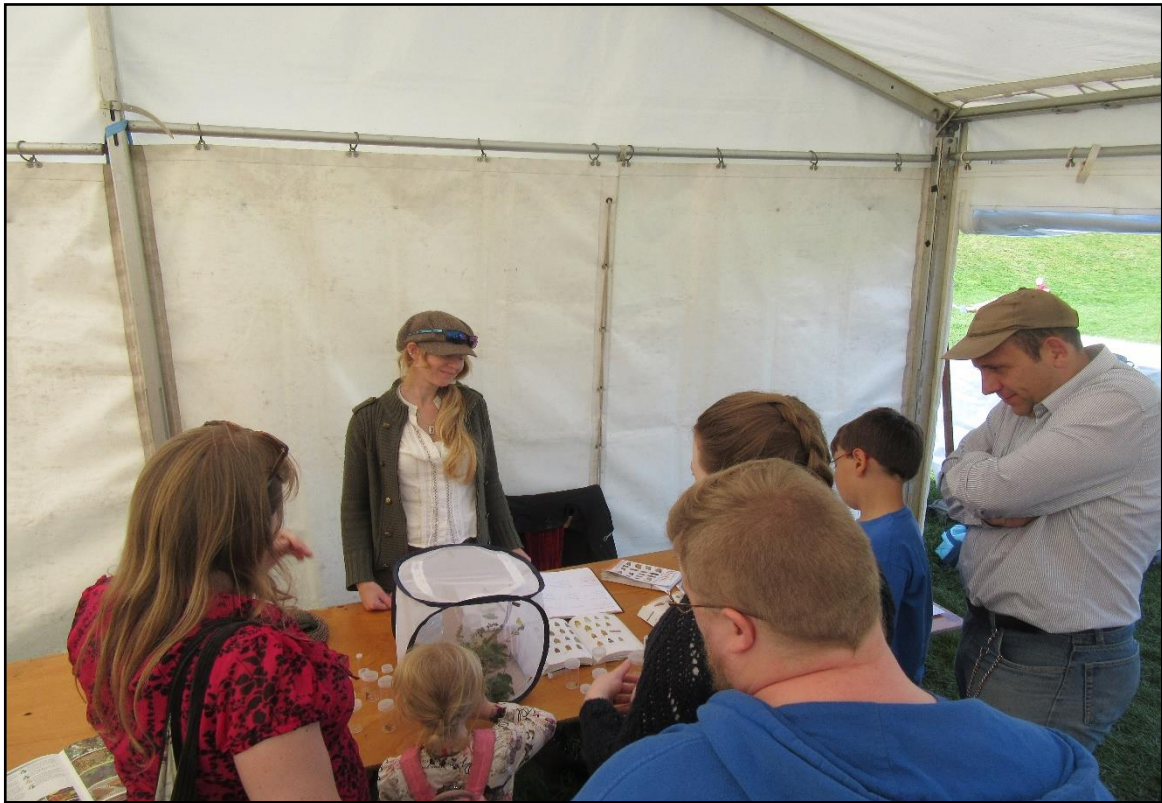
Visitors admire the catch of the day