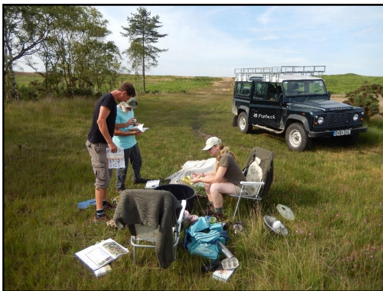
Checking the traps at Slepe Heath