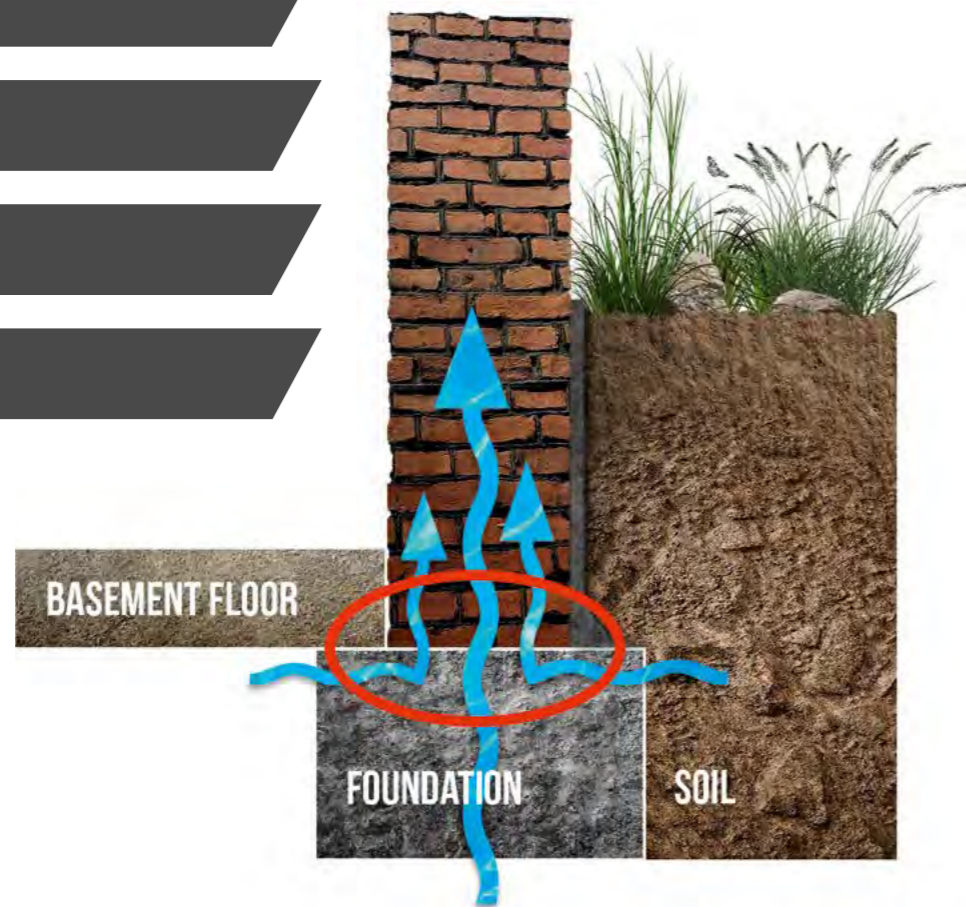
* Defective or non-existent horizontal barrier