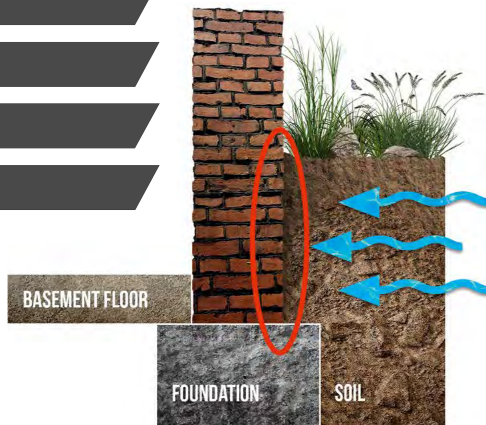
* Defective or no exterior waterproofing.