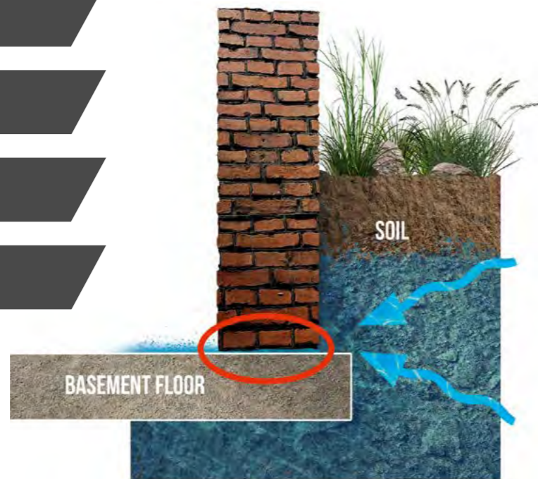
* Defective or leaking floor-wall joint.