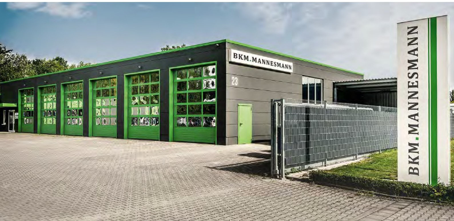
BKM.MANNESMANN AG, headquarters in Kamen

For further information: www.bkm-mannesmann.de