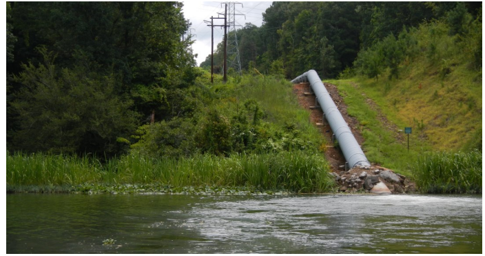
Gorgas Steam Plant's coal ash wastewater discharge pipe.

To report pollution anywhere in the Black Warrior River watershed, contact Nelson Brooke at (205) 458-0095 or reportpollution@blackwarriorriver.org .