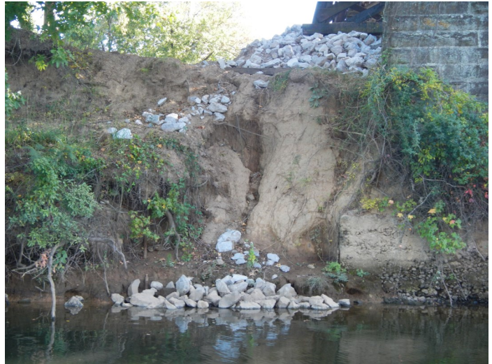
Erosion next to the M&O Railroad Bridge's pier in Tuscaloosa threatens the structure's integrity.