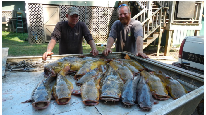
A nice haul of catfish from the river by commercial fishermen.