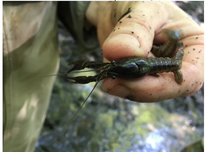
First Vernal Crayfish found in Hale County.

Such impressive crayfish biodiversity in the lower Black Warrior River basin is a good sign for the river and its floodplain. Moreover, these findings are a great addition to the growing Alabama crayfish record, all of which will be captured in an upcoming Alabama crayfish book that we eagerly await.