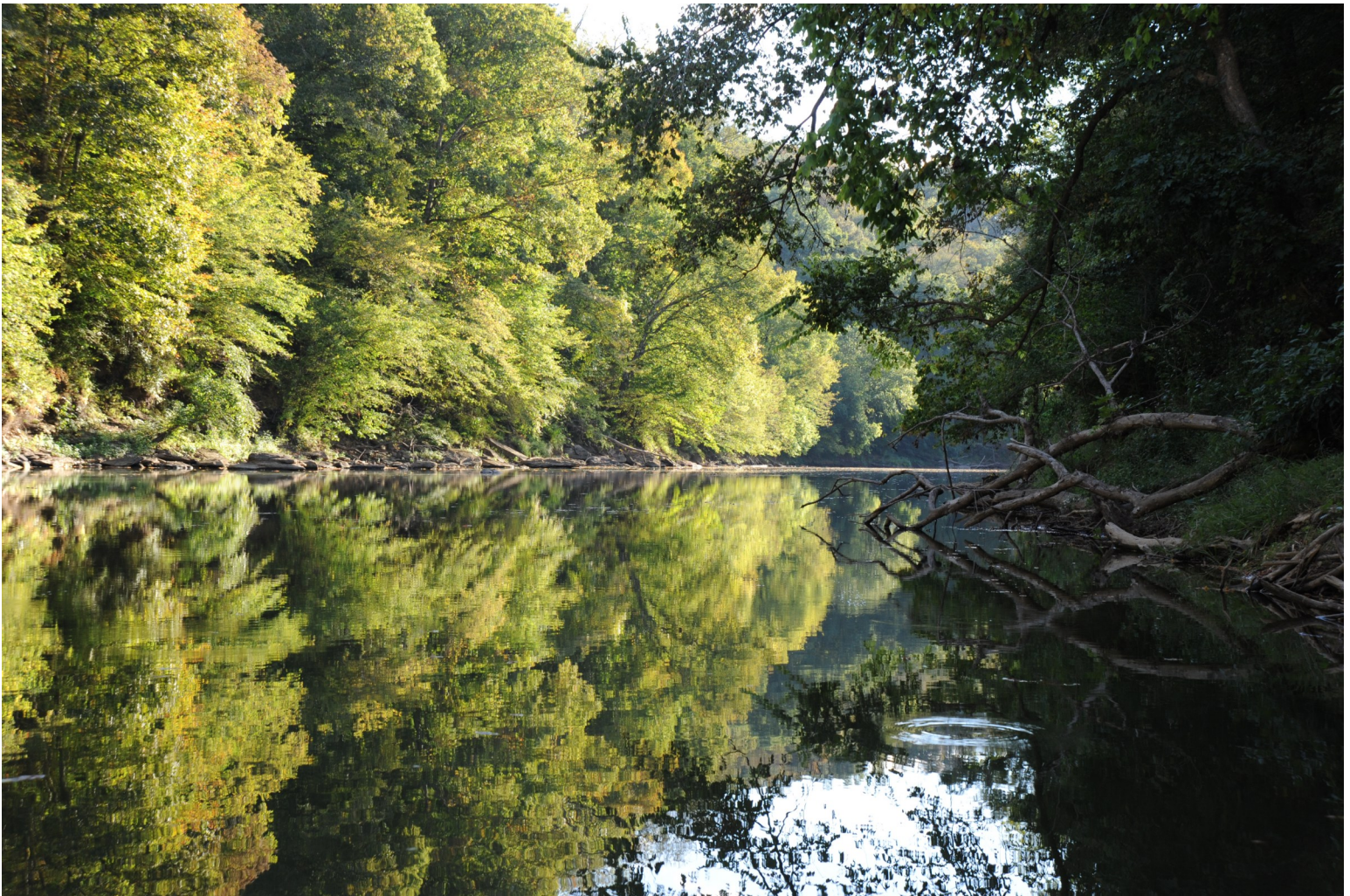
The Black Warrior River's Locust Fork in Jefferson County.

Conservation groups are challenging the U.S. Army Corps of Engineers' approval of a permit authorizing coal mining material to be dumped into streams that feed the Black Warrior River's Locust Fork. The groups charge that the agency failed to account for the permit's adverse effects on a watershed that has been degraded by previous and current mining for over a century. The Southern Environmental Law Center ( southernenvironment.org ) filed the challenge on behalf of Black Warrior Riverkeeper and Defenders of Wildlife ( defenders.org ), arguing that allowing stream filling at the Black Creek Mine site is yet another case where the agency has rubberstamped approvals without properly analyzing the site-specific and broader impacts of the permit, including compromised water quality and threats to wildlife.