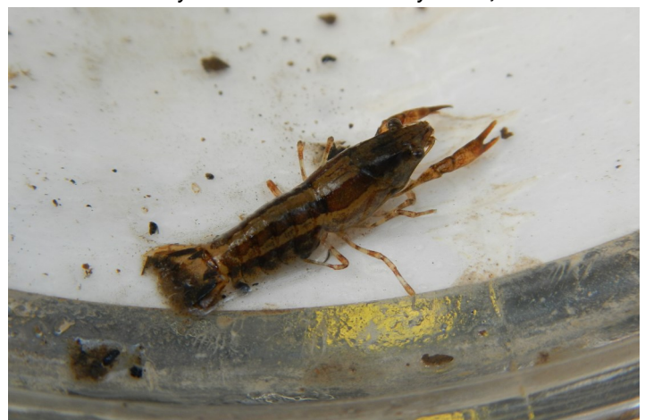
Discovered: an undescribed crayfish species.