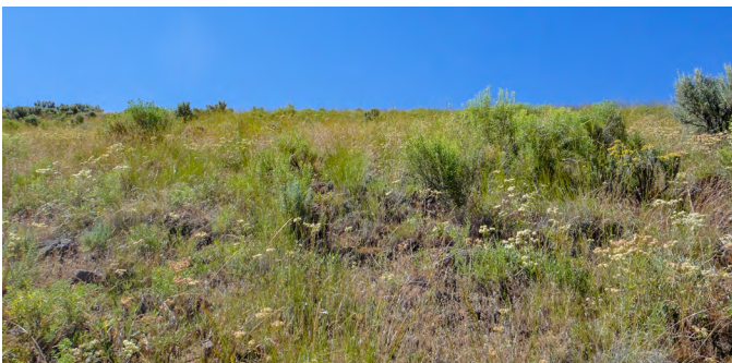
Figure 1. Parsnipflower buckwheat growing in mixed grassland/shrubland habitats in Oregon.

Habitat and Plant Associations. Parsnipflower buckwheat is common in big sagebrush ( Artemisia tridentata ) and antelope bitterbrush ( Purshia tridentata )-dominated vegetation in mountain foothills (Fig. 1) at the upper edge of the Wyoming big sagebrush ( A. t. subsp. wyomingensis ) zone (Ogle et al. 2012; Tilley and Fund 2017). It also occurs in grasslands, mountain brush ecosystems, woodlands, and conifer forests throughout its range (Munz and Keck 1973; Monsen et al. 2004; Reveal 2005; Welsh et al. 2016; Hitchcock and Cronquist 2018). Parsnipflower buckwheat occurs in areas receiving 12 to 25 inches (305-635 mm) of annual precipitation (Ogle et al. 2012; Tilley and Fund 2017). It dominates gravelly soils and rocky ridges (Taylor 1992).