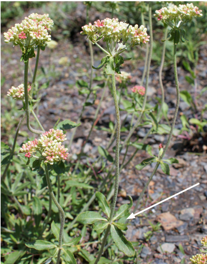
Figure 6. Parsnipflower buckwheat (var. heracleoides ) inflorescences on a plant growing in Utah. White arrow is pointing out whorled bracts at midstem.