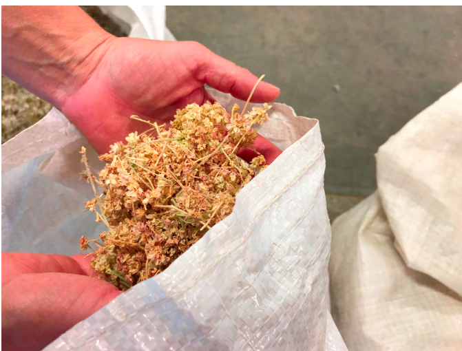
Figure 10. Wildland collected parsnipflower buckwheat seed.

Collection timing. Parsnipflower buckwheat seed is commonly ready to harvest in the summer (Fig. 10), and seed at low elevations generally matures before seed at high elevations. Ripe seed is typically available when flowers are dry, rust-brown, and easily released when plants are shaken (Camp and Sanderson 2007). Seed collection crews for the BLM SOS project have records for seed harvests made over 11 years in Washington, Oregon, Idaho, Nevada, and Utah (USDI BLM SOS 2017). Of the 47 collections, 14 were made in July and 18 in August. The earliest collection was made on June 24, 2013 in Malheur County, Oregon, at 4,600 feet (1,400 m). The latest collection was made on October 6, 2010 in Davis County, Utah, at 9,005 feet (2,745 m). In the single year with the greatest number of collections (14 harvests in 2010), the earliest occurred in early July in Douglas County, Washington, at 1,830 feet (560 m) and the latest in early October in Davis County, Utah, at 9,005 feet (2,745 m) (USDI BLM SOS 2017). In southern British Columbia, parsnipflower buckwheat produced most flowers in June, but in a year when October precipitation was 6 mm more than normal, some plants flowered a second time (Pitt and Wikeem 1990).