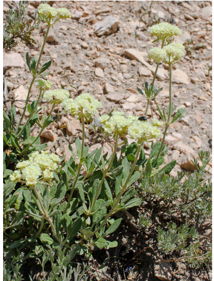
Figure 5. Parsnipflower buckwheat ( E. h. var. heracleoides ) in bloom growing in Utah.

Aboveground description. Plants often form large spreading mats up to 3.2 feet (0.6 m) across (Weaver 1915; Reveal 2005; Pavek et al. 2012; Welsh et al. 2016). Vegetative stems are persistent (Welsh et al. 2016). Flowering stems are not persistent but are long lasting and give plants their height (<30 in [75 cm]) (Ogle et al. 2012). Leaves are linear to broadly oblanceolate with short petioles (0.1-1.2 in [3-30 mm] long) and at least 3 and often 4 times long as wide (Fig. 5) (Munz and Keck 1973; Reveal 2005; Pavek et al. 2012; Welsh et al. 2016; Hitchcock and Cronquist 2018). They occur in loose basal rosettes and are tomentose throughout or at least on the undersides (Munz and Keck 1973; Pavek et al. 2012; Welsh et al. 2016).