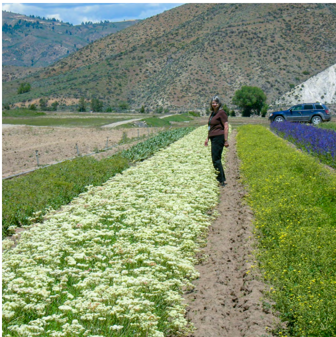
Figure 13. Parsnipflower buckwheat bareroot nursery production plots growing at USFS Lucky Peak Nursery in Boise, ID.

Production of parsnipflower buckwheat container stock takes 4 to 6 months plus hardening time (Shaw 2004). Based on bareroot seedling production at the USFS Lucky Peak Nursery near Boise, Idaho, seed can be sown in fall without pretreatment or in spring with artificial stratification (Fig. 13). Roots can be pruned to improve plant uniformity. Plants are lifted after 1 year in the seedbed and then stored cold until wildland use (Shaw 1984).