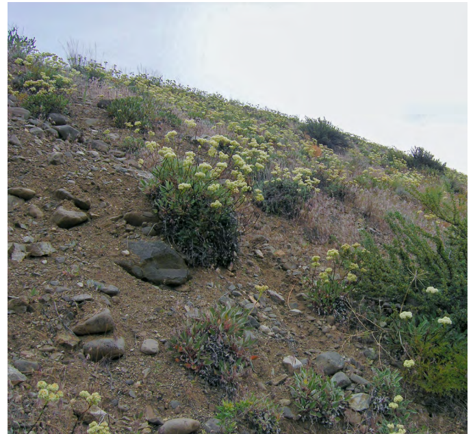
Figure 3. Parsnipflower buckwheat growing in rocky soils in Oregon.

Soils. In parsnipflower buckwheat habitats, soils are often described as dry, shallow, and gravelly to rocky (Fig. 3), but it does occur on soils with textures ranging from clay to loam to sand (Reid et al. 1980; Skinner 2008; Hitchcock and Cronquist 2018).