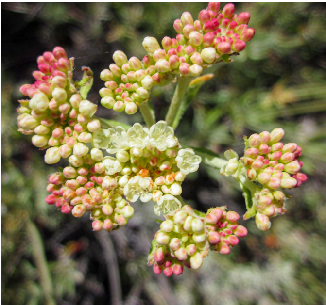
Figure 7. Parsnipflower buckwheat inflorescences and individual flowers on a plant growing in Oregon.

Reproduction. Parsnipflower buckwheat reproduces from seed. Flowers (Fig. 7) are usually perfect, but plants are infrequently polygamodioecious, meaning they produce perfect and male flowers or perfect and female flowers (Reveal 2005). Parsnipflower buckwheat typically flowers in the summer, but flowers can appear from May to October (Munz and Keck 1973; Pitt and Wikeem 1990; Reveal 2005). Flowers are insect pollinated and attract a variety of pollinators (see Insects section).