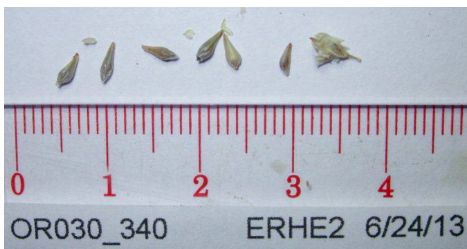
Figure 11. Clean and enlarged parsnipflower buckwheat seed and a representation of seed size (mm).

Several procedures were reported for large collections of field-grown seed. The general procedure was to dry the seed, then screen, chop, or rub the seed to remove it from the perianth, and then re-screen. Seed was then processed using a gravity table, air screen, or air blower to remove unfilled seed and debris (Stevens et al. 1996). Seed grown at the Oregon State University Malheur Experiment Station in Ontario, Oregon, was collected using a small-plot combine. Unthreshed