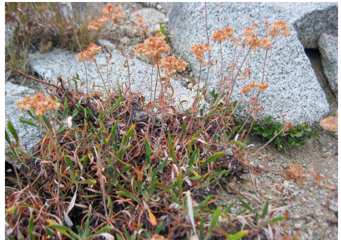
Figure 9. Parsnipflower buckwheat seed heads on a plant growing in Utah.

Wildland Seed Collection. Parsnipflower buckwheat seed is generally ripe in the summer (USDI BLM SOS 2017) and is ready for harvest when flowers are dry and rust colored (Fig. 9) (Camp and Sanderson 2007). Holmgren (1954) reports that ripe parsnipflower buckwheat seed remains on the plant for a considerable amount of time. Stevens et al. (1996) suggests seed is retained for up to 3 weeks once mature. Good seed crops are reported in most years and even in some dry years (Monsen et al. 2004), but a portion of seeds will likely have insect damage (Tilley and Fund 2017). Camp and Sanderson (2007) report that seed yield is often low and advise collecting large amounts of seed when possible. See cleanout ratios in Table 7.