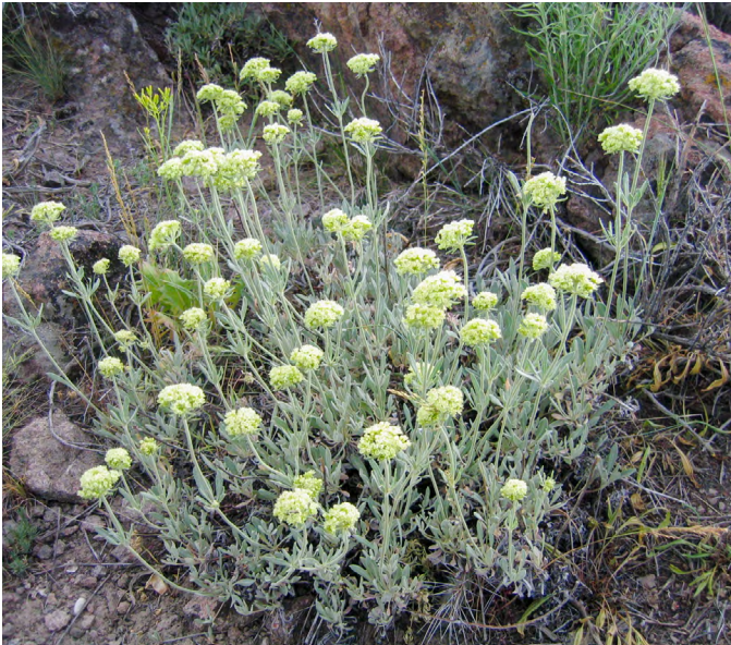
Figure 4. Parsnipflower buckwheat plant growing in Utah.

Belowground description. Parsnipflower buckwheat plants have extensive root systems. A single plant excavated from a dry prairie in southeastern Washington produced a strong woody taproot (1 in [2.5 cm] diameter), which split into seven equal-sized lateral roots at the 6-inch (15 cm) depth. One of the laterals extended 13.5 feet (4 m) from the plant and had a total length of 14.3 feet (4.4 m). All laterals tapered gradually and produced additional lateral roots, which branched up to 5 times. Plants also had prostrate branches with adventitious roots, which anchored them and extracted moisture from superficial soil layers (Weaver 1915). A single plant excavated from the Boise River Watershed in Idaho produced 6 primary roots (0.8-1.2 in [2-3 cm] thick), which remained thick down to about 3 feet (1 m) deep. Roots were highly branched and occupied a large portion of an area 4.6 feet (1.4 m) long and 3.3 feet (1 m) wide. Roots reached a maximum depth of 15 feet (4.6 m) and spread a little more than 3.3 feet (1 m) (Woolley 1936).