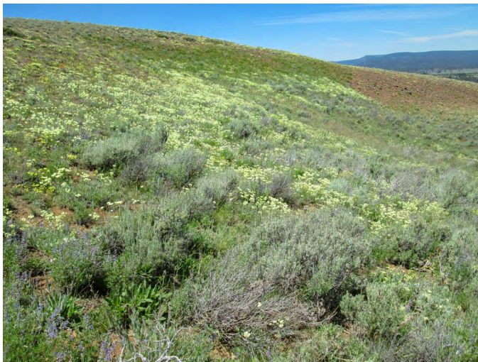
Figure 2. Parsnipflower buckwheat growing in big sagebrush habitat in Oregon.

soils (Day and Wright 1985). In a study of dwarf sagebrush vegetation in northern Nevada, parsnipflower buckwheat occurred in habitat types dominated by little sagebrush ( A. arbuscula ) but not those dominated by black sagebrush ( A. nova ) (Zamora and Tueller 1973). Parsnipflower buckwheat occurred (1-3% cover) in more than half of 15 Saskatoon serviceberry ( Amelanchier alnifolia )-dominated stands on steep, south- to southwest-facing slopes near Victor, Idaho, and adjacent western Wyoming (Major and Rejmanek 1992). In Utah, parsnipflower buckwheat is most abundant in mixed-mountain brush communities in the Wasatch Range (R. Johnson, Brigham Young University, personal communication, September 2019).