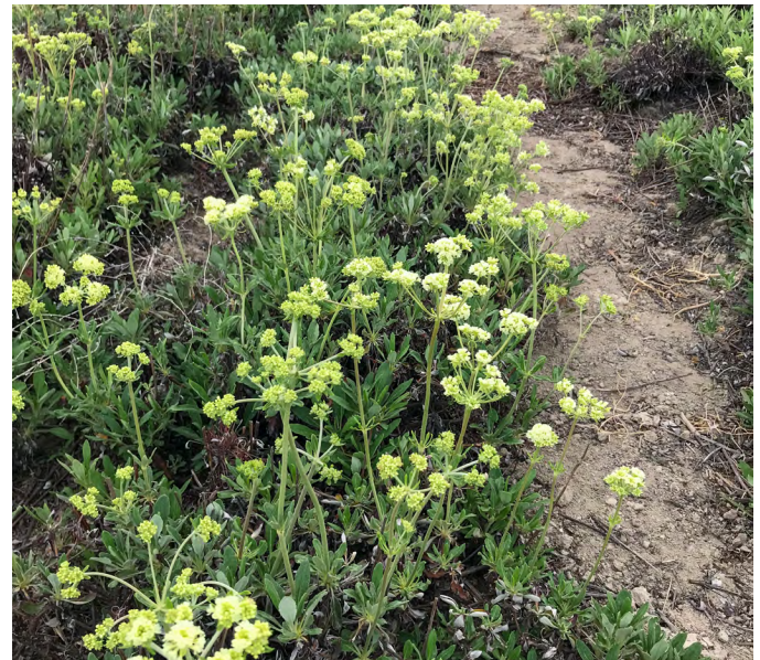
Figure 12. Parsnipflower buckwheat seed production plots growing at Oregon State University's Malheur Experiment Station (OSU MES) in Ontario, OR.

Weed Management. Mechanical and hand weeding is recommended until plants reach at least 2 years old and are considered competitive with weeds (Stevens et al. 1996). Weed barrier fabric is also an effective control method (Tilley and Fund 2017).