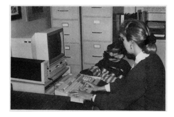
Figure 2. Use of the nasometer in the evaluation of resonance.

pick up acoustic energy from the nasal and oral cavities. The nasometer then computes the ratio of nasal acoustic energy to total (nasal plus oral) acoustic energy and displays this in real time. In this way, an average "nasalance" score can be computed for a given speech segment. When one of the standardized passages is used, the nasalance score can be compared to normative data.