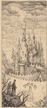
"We stood before a warehouse of souls (not so bonny) doomed."