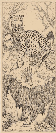
"A Giant Southern Leopard known to be fierce."