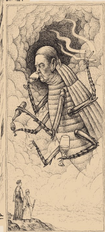
"A squat, beetle-browed figure, puffing mightily, out of breath."

The Vinferno Some like it Hot, which is a Damned good Thing, as a Legion of Malo-factors, unregenerate Zinners, cork-sniffing Collaboracionists, indeed all manner of Oenil-doers, are heading straight to Wine Hell. Those who have lost their immortal Sols are doomed to an Oenternity of domestic Chablis or worse.