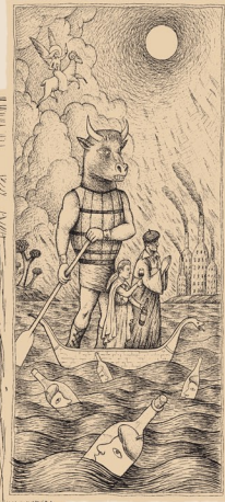
"We must endure for passage, but disagreeable ship, to ferry us across the treacherous Vacheron River."