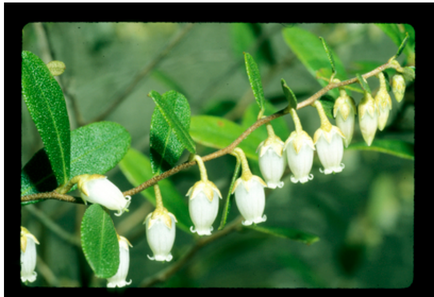
Chamaedaphne calyculata (L.) Moench (Leatherleaf)