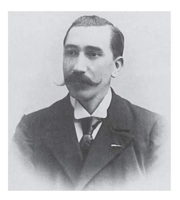
Figure 3. Louis Calvet in 1901

Waters<sup>188</sup> discovered the external brooding sacs (that he called as 'ovicells') and an ovary in Aetea sica (Couch, 1844) (as A. anguina forma recta ). Later this was confirmed by Robertson<sup>189</sup> and Mawatari.<sup>190</sup> The female gonad is positioned inside the adnate, horizontal part of the maternal zooid, and contained four young oocytes.