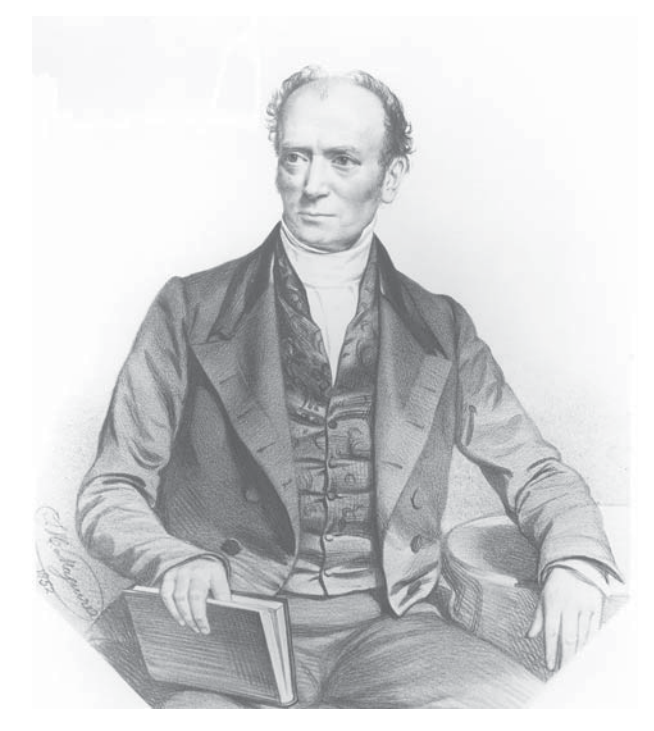
Figure 1. Robert Edmond Grant

ovicellate cheilostomes), contradicted the traditional point of view. For instance, Thompson<sup>49</sup> observed 'an ovum or ovarium' on the body wall inside the autozooid of ' Vesicularia ', and Milne-Edwards<sup>50</sup> also mentioned it there in ' Cellariae '.