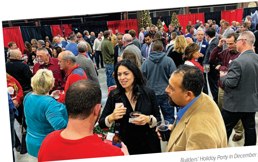
Builders' Holiday Party in December

Holiday parties were hosted in all three Regions: Jefferson City on Dec. 5, Springfield on December 12, and Kansas City on Friday the 13th. KC's "Haunted Christmas" came complete with a DJ.