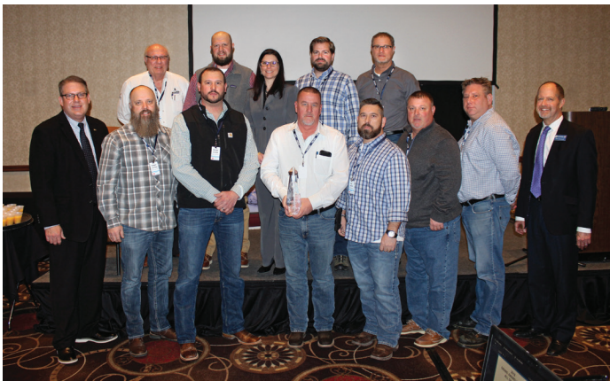
Rand Construction Company, 2019 Grand Award Winner

Also in March, Kansas City Chapter, AGC member HNTB Corp. was recognized at the National AGC Construction Safety Excellence Awards (CSEA) ceremony during the AGC's 100th Annual Convention in Denver, Colorado. They placed 2nd in the Service Provider and Supplier Division, over 1 million work hours.