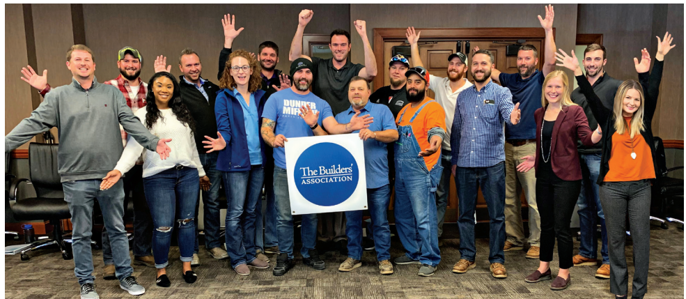
Builders' Leadership Course, October 2019

According to the Mid-America Regional Council (MARC), Kansas City will need to add 1,500 workers in 2020 to its baseline of 50,000 construction workers to meet demand. Our team is committed to meeting this demand with new recruitment and development strategies.