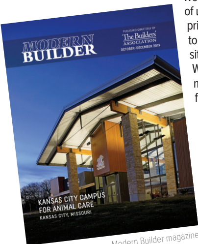
Modern Builder magazine

Keeping you informed and connecting you with our services and marketing opportunities will continue to be our priority in 2020.