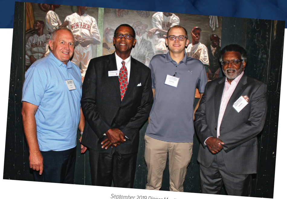
September 2019 Dinner Meeting at the Negro Leagues Baseball Museum

You are The Builders' Association, and we look forward to adding value to your membership in 2020. Happy New Year to all!