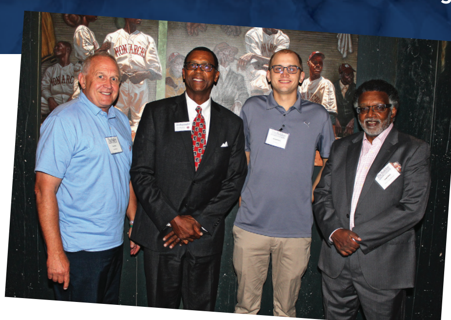
September 2019 Dinner Meeting at the Negro Leagues Baseball Museum

You are The Builders' Association, and we look forward to adding value to your membership in 2020. Happy New Year to all!