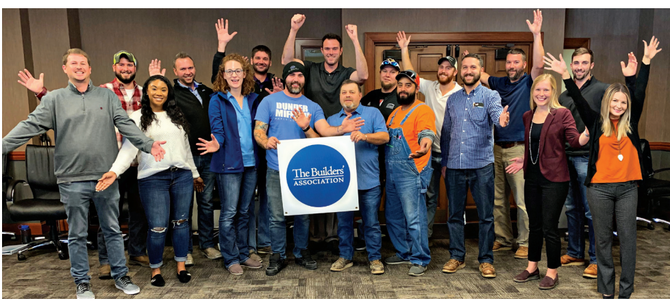
Builders' Leadership Course, October 2019

According to the Mid-America Regional Council (MARC), Kansas City will need to add 1,500 workers in 2020 to its baseline of 50,000 construction workers to meet demand. Our team is committed to meeting this demand with new recruitment and development strategies.