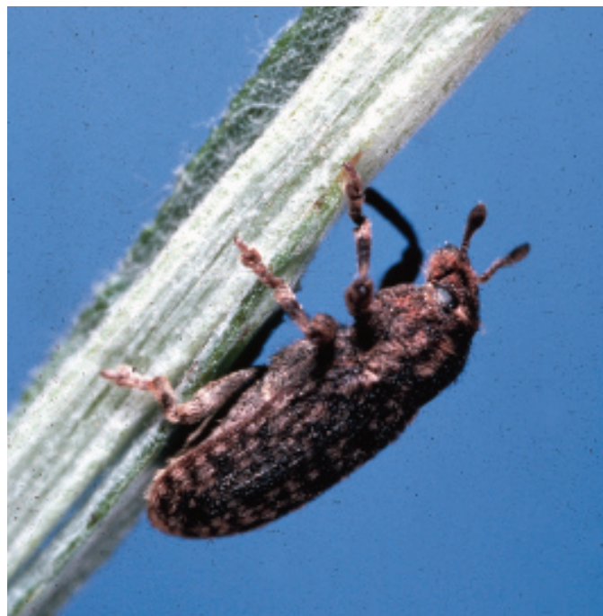
Bud weevil. Bangasternus orientalis is one of many biocontrol agents released in California to control yellow starthistle.

Many years are necessary to research, test, and release biological controls for use on a target weed. As a result, biocontrol is usually developed for the most damaging and widespread weeds. In the development of weed biological control, scientists examine the target weed in its area of origin and identify the most promising natural enemies for use as potential agents. These natural enemies are subjected to a series of host-specificity tests to examine