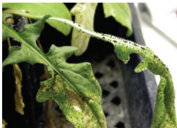
Mediterranean rust fungus. Puccinia jaceae var. solstitialis on yellow starthistle.

Of all the seed head insects, only two, the hairy weevil and the false peacock fly, have proven to consistently build up high numbers and cause a substantial amount of seed destruction (Pitcairn and DiTomaso 2000, Woods et al. 2002, Pitcairn et al. 2003). The combination of these two insects has been reported to reduce seed production by 43 to 76% (Pitcairn and DiTomaso 2000). Balciunas and Villegas (1999) reported a 78% reduction in seed production when seed heads contained false peacock fly larvae alone. The hairy weevil is an approved agent and is available for use to landowners. The false peacock fly is not a permitted biological control agent and therefore is unavailable. Despite this, the false peacock fly is a very common insect and is found almost everywhere that yellow starthistle is known to occur (Pitcairn et al. 2003). It is likely that the false peacock fly is already present at locations identified for yellow starthistle control