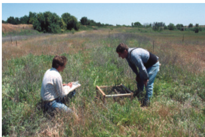
Post-release monitoring. After release, biocontrol insects are carefully monitored for effectiveness and spread.

The objective of a biological control program is to establish self-sustaining populations of the biological control agents at locations throughout the infested area. First, release sites must be identified for the biological control agents. The release site should contain at least one acre of yellow starthistle that is undisturbed by farm equipment, vehicular traffic, livestock (no grazing), mowing, and pesticide use. These sites are small refugia that allow the control agent to reproduce and build up high numbers that eventually spread outward into adjacent yellow starthistle populations. To build up their population, the control agents require yellow starthistle to reproduce and develop. Insects are killed if the plant is destroyed before flower maturation. The release site