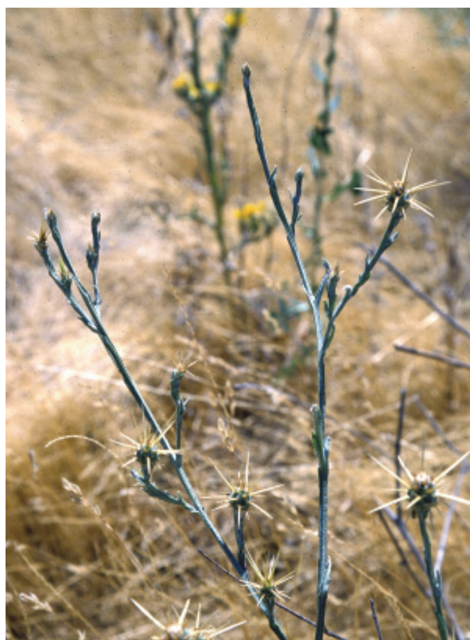
Biological control damage. Buds attacked by the hairy weevil ( E. villosus ) early in development fail to flower (upper center).

including lettuce (Pitcairn et al. 2000b). In contrast to Ascophyta n. sp., these pathogens are more aggressive at warmer temperatures, causing symptoms characterized by wilting and yellowing (Woods and Fogle 1998). It is important to note that none of these pathogens has been approved for use as a biological control agent and land managers need to rely on naturally occurring infection if their benefits are to be realized. It may be possible to isolate a host-specific form of S. minor or C. gloeosporioides that could be used as a mycoherbicide for use in infested grasslands, but this is many years away from development.