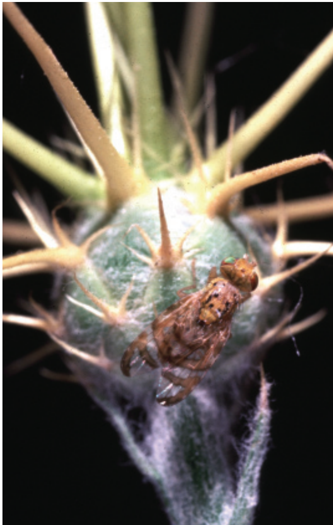
Peacock fly. Although Chaetorellia australis has established populations on yellow starthistle, it has not established in densities sufficient to produce a significant reduction in starthistle.