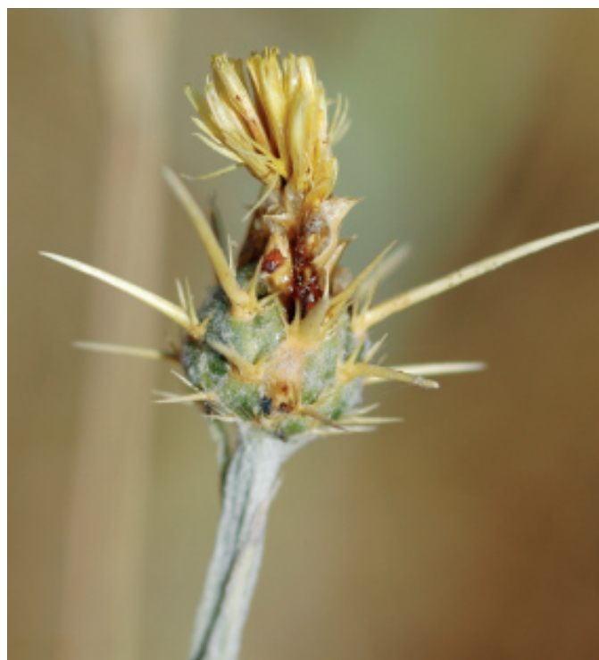
Damage by hairy weevils. Yellow starthistle plants may respond to damage caused by adult hairy weevils by emitting sap around the damaged area.

While the rust has been released in California, its continued release and establishment is regulated