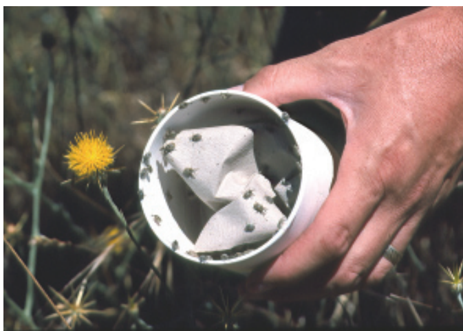
Release in the field. Biocontrol agents are released only after years of host-specificity testing.