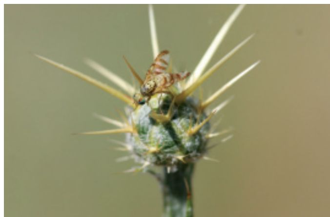
False peacock fly. Accidentally introduced, the false peacock fly is one of the most common seed head insects found on yellow starthistle.

Several plant pathogens are known to attack yellow starthistle seedlings and rosettes in California: Sclerotinia minor , Colletotrichum gloeosporioides and a new species of Ascophyta (Woods 1996, Woods and Fogle 1998, Pitcairn et al. 2000b). All three species are naturally present in California. Seedlings of yellow starthistle were observed to be infested with Ascophyta n. sp. during two winters at one location in central California (Woods 1996). Unfortunately, infestations by Ascophyta n. sp. have not been observed since then. More commonly, S. minor and C. gloeosporioides have been observed to cause high mortality rates in starthistle seedlings at several locations, particularly in areas where skeletons of previous years starthistle plants provide shading. Both of these pathogens are not host specific and are able to infect important crops