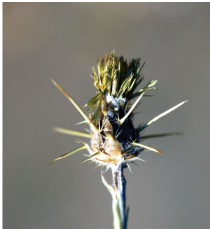
Seed head damage. This seed head has been damaged by the false peacock fly ( Chaetorellia succinea ).

The combined impact of five of the insects (except the peacock fly) has been evaluated at three long-term study sites in central California (Pitcairn et al. 2002). The hairy weevil and the false peacock fly are the most abundant insects and appear to cause the largest amount of seed destruction. The other three insects failed to build up high numbers and have had little impact on seed production. Since 1995, seed production at the three study sites has steadily declined due to the steady increase in attack by the hairy weevil and the false peacock fly. Recently, the density of mature plants has declined at two sites (Pitcairn et al. 2002). Although it is too early to know the stable level of control provided by the seed head insects, as of 2004 mature plant density had declined over 50% at both sites. It is important to note that these sites experienced no