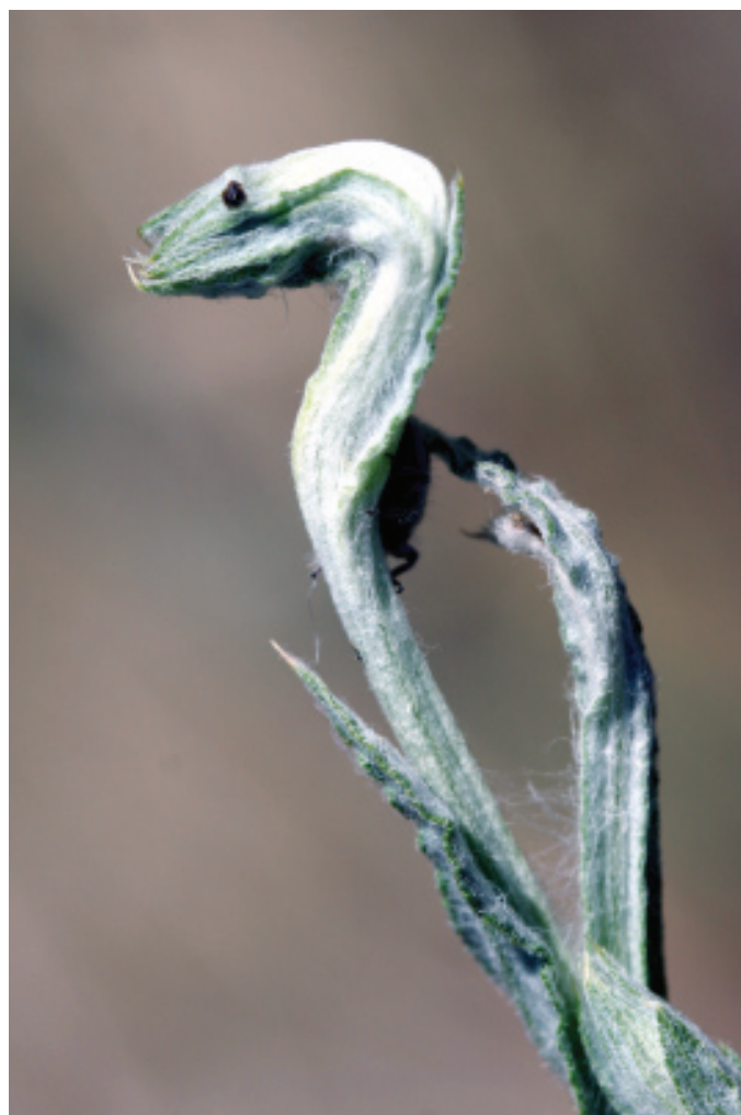
Hairy weevil damage. This yellow starthistle bud will never open due to damage from the hairy weevil.

The risk of indirect impacts also appears to be very low for the biological control agents of yellow starthistle. Pearson et al. (2000) found that gall flies used as biocontrol agents on spotted knapweed ( Centaurea maculosa ), caused indirect increases in populations of deer mice by providing a food source over the Montana winter. However, a similar scenario is unlikely with yellow starthistle, because yellow starthistle favors mild-winter areas and is an annual plant which dies by winter.