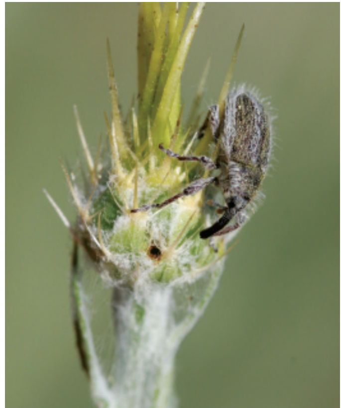
Hairy weevil. Eustenopus villosus is the most damaging biological control insect established against yellow starthistle. It feeds by chewing a small hole in young flower buds and feeding on the soft internal tissues. This feeding damage kills young buds and stops their development.

western United States. Six insect species and a rust disease have been introduced against yellow starthistle in the United States. Of the six insects, five have established (see Table 2). Three of these are widespread: the bud weevil ( Bangasternus orientalis ), hairy weevil ( Eustenopus villosus ), and gall fly ( Urophora sirunaseva ). Two of the other insects, the peacock fly ( Chaetorellia australis ) and the flower weevil ( Larinus curtus ), occur only in a few isolated locations and have failed to build up numbers high enough to substantially reduce seed production. The sixth insect, Urophora jaculata , failed to establish and does not occur here. In addition to the five insects established as control agents, another insect, the false peacock fly ( Chaetorellia succinea ) was accidentally released in southern Oregon in 1991 and is now widespread throughout California (Balciunas and Villegas 1999). The false peacock fly is not an approved biological control agent and did not undergo host specificity testing prior to