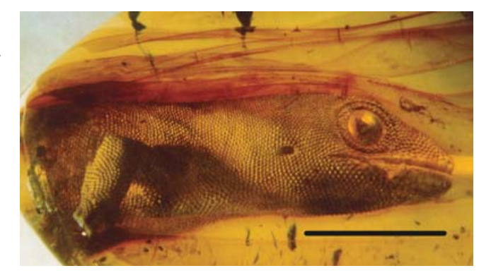
Fig. 1. Yantarogekko balticus sp. nov. from Baltic amber of the Lower Eocene of north-western Russia. Lateral view of holotype illustrating general habitus and scalation features. Darker area in centre of eye is an artefact and does not represent the pupil. Oak bud trichomes in the amber matrix beneath the head of the specimen are indicator fossils for Baltic amber. Scale = 5 mm.

Yantarogekko : from the Russian 'янтарь' (yantar) meaning amber and the onomatopoeic, Malay-derived 'gekko'; balticus : in reference to the origin of the specimen from Baltic amber.