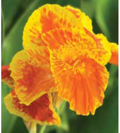
Yellow King Humbert

Crimson Beauty Red and pink fused together for a fabulous shade of hot pink. Complemented by shiny green leaves. Tried and true mid-height canna. $12.00 bulb (only)