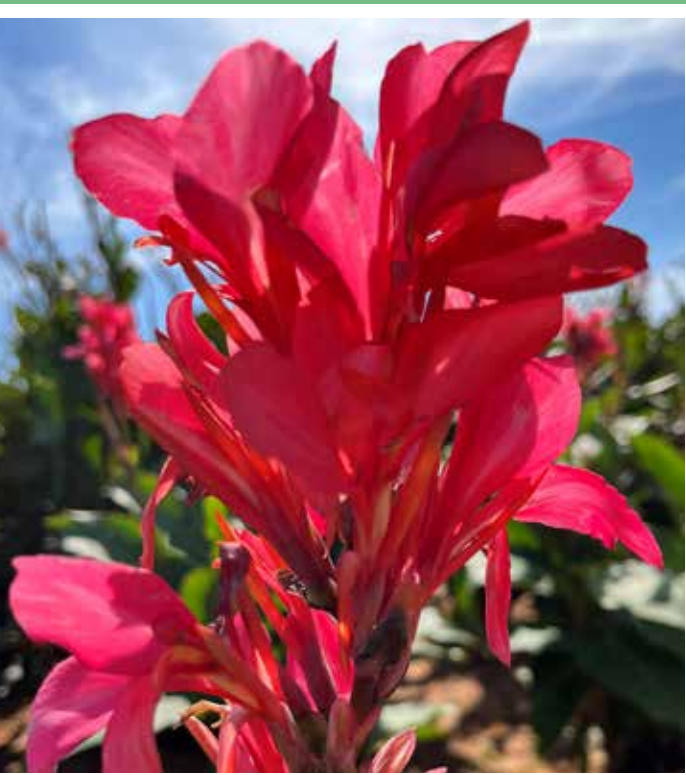
Berry Pink Exclusive! Vivid reddish-pink or cerise blooms with lots of upright petals. Pairs well with yellow blooming cannas. Medium height of four feet. $12.00 bulb