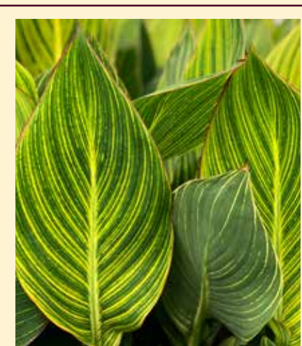
Pretoria foliage is every bit as lovely as its blooms. It is available to purchase as a rhizome and as a live plant. See page 10.