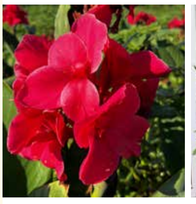
Mew! Pink Magic

Large, globe shaped blooms with dark pink petals. Adds a magical twirl of deep pink to flowerbeds or containers. Dwarf height of three feet tall. $17.00 bulb (only)