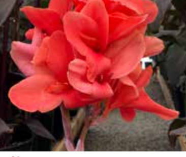
Mew! Whithelm Pride

Soft, salmon-pink flowers with elongated petals. Blooms sit just above subtle hues of blue green foliage. Dwarf height of three to four feet tall. $17.00 bulb (only)