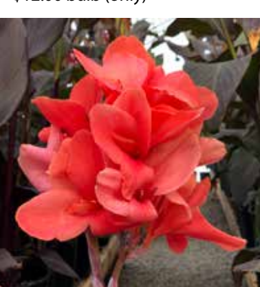
Mew! Thai Pink

Soft, salmon-pink flowers with elongated petals. Blooms sit just above subtle hues of blue green foliage. Dwarf height of three to four feet tall. $17.00 bulb (only)