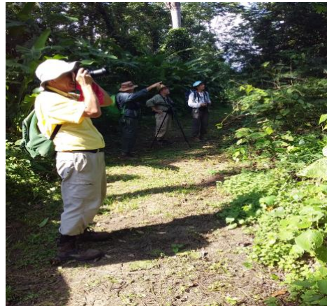
El Salto road trail