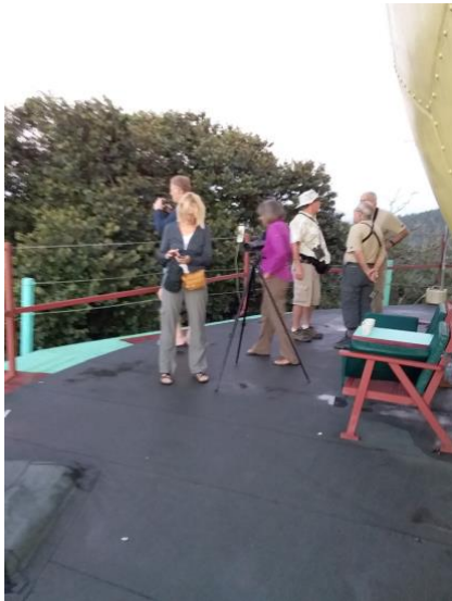
Morning at Canopy Tower