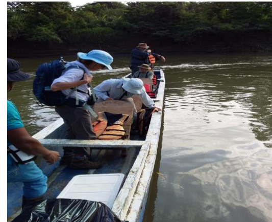
Canoe trip to Embera village