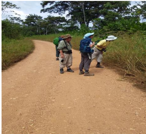
El Salto road