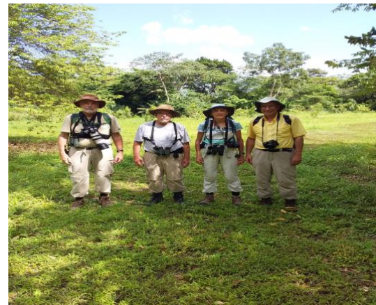
San Francisco reserve

With these two photos I want to thank you for participating in our butterfly tour in December. In total we saw 305 species reported for all our tour. At the Canopy Camp we saw a rare species for Panama ( Zelotaea phasma phasma ). We hope to see you soon for another tour with the Canopy Family! Thank you very much for joining us!